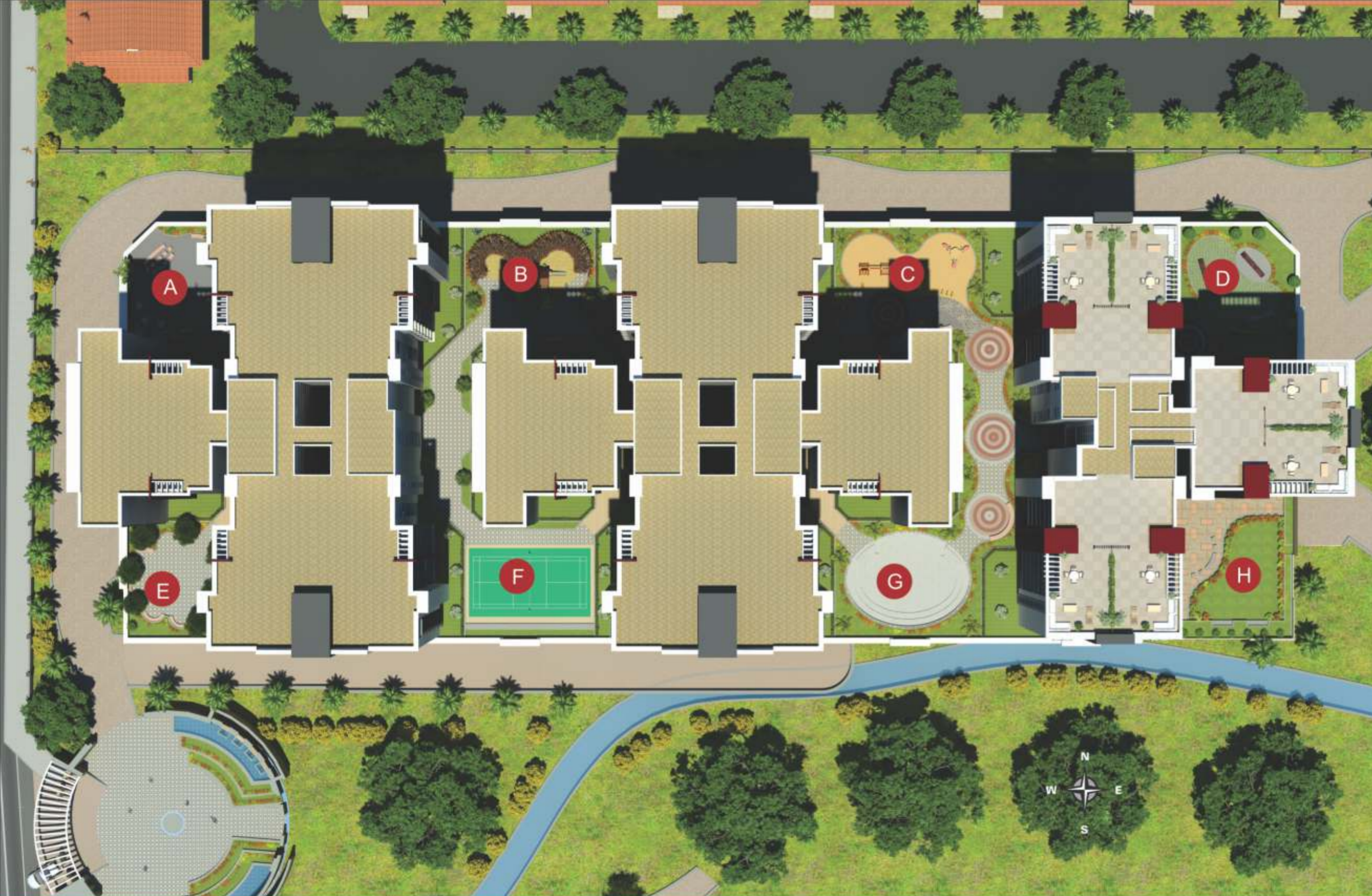
A. The Sunset Strip | B. The Playpen | C. The Backyard | D. The Zen Zone | E. The Sunny Side | F. The Sports Centre | G. The Ring | H. The High Court