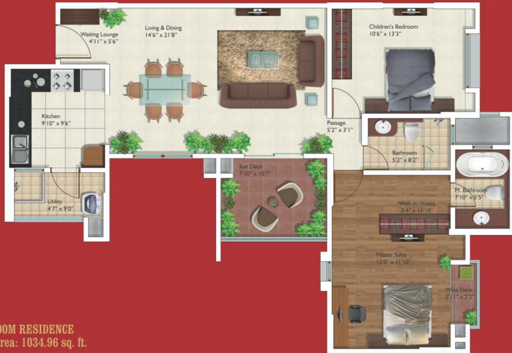
2 BEDROOM RESIDENCE Carpet Area: 1034.96 sq. ft.