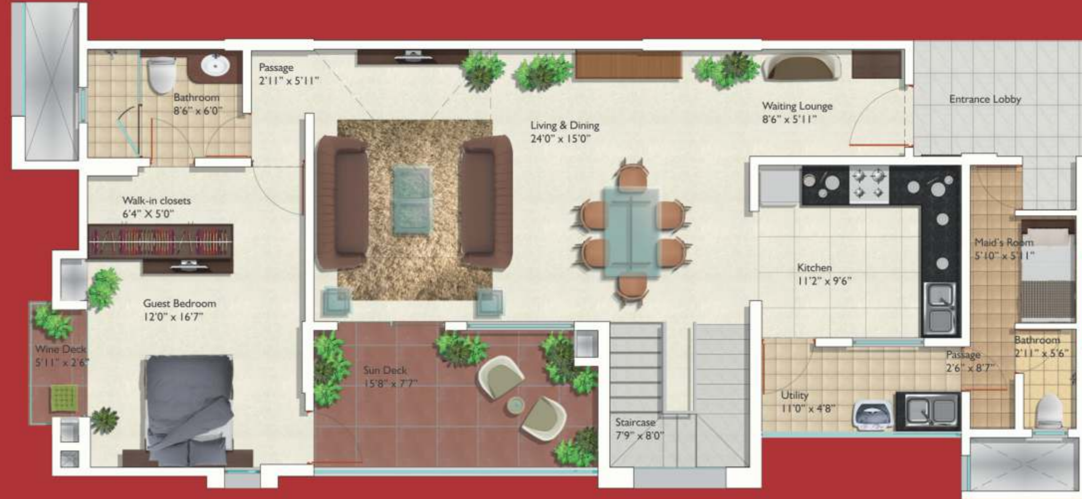
3 / 4 BEDROOM RESIDENCE Total Carpet Area: 1930.61 sq. ft.