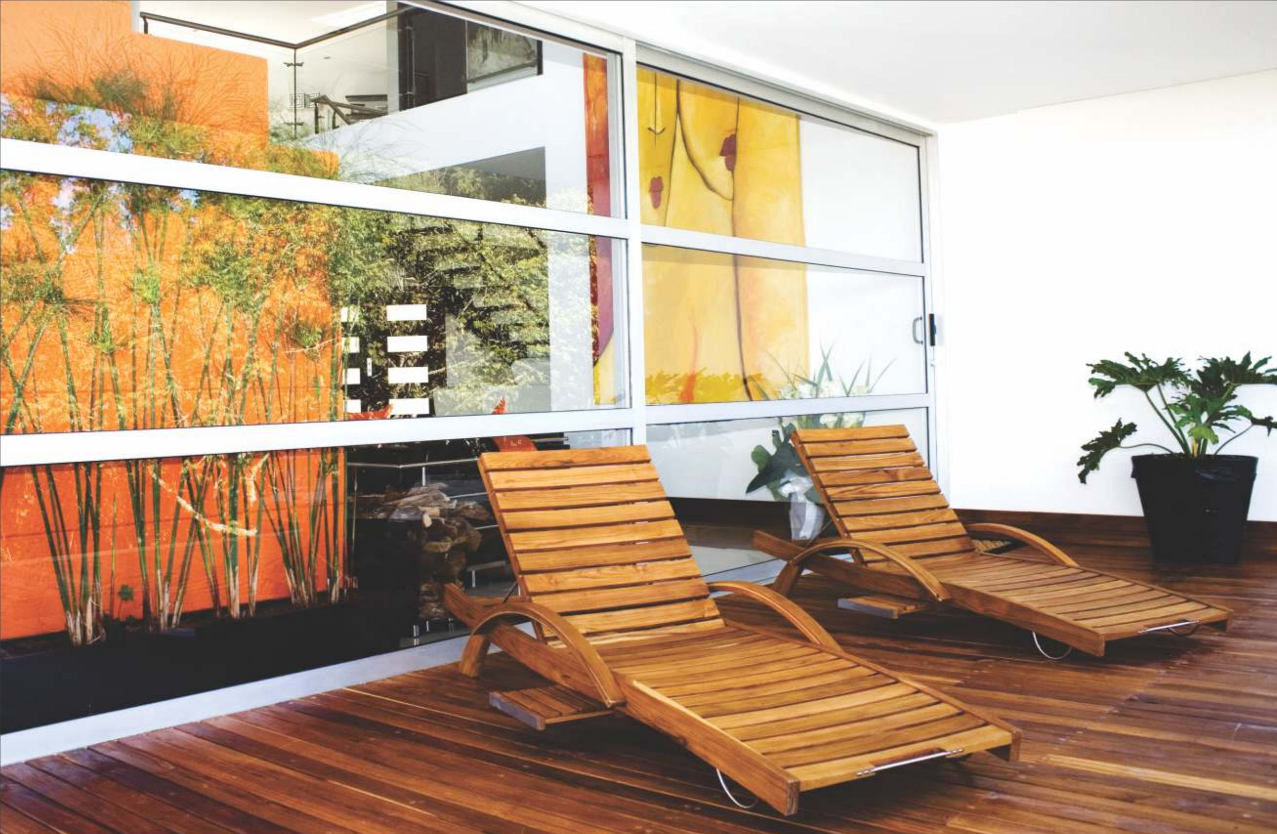
Nestled terrace | Wine deck | Pre lobby