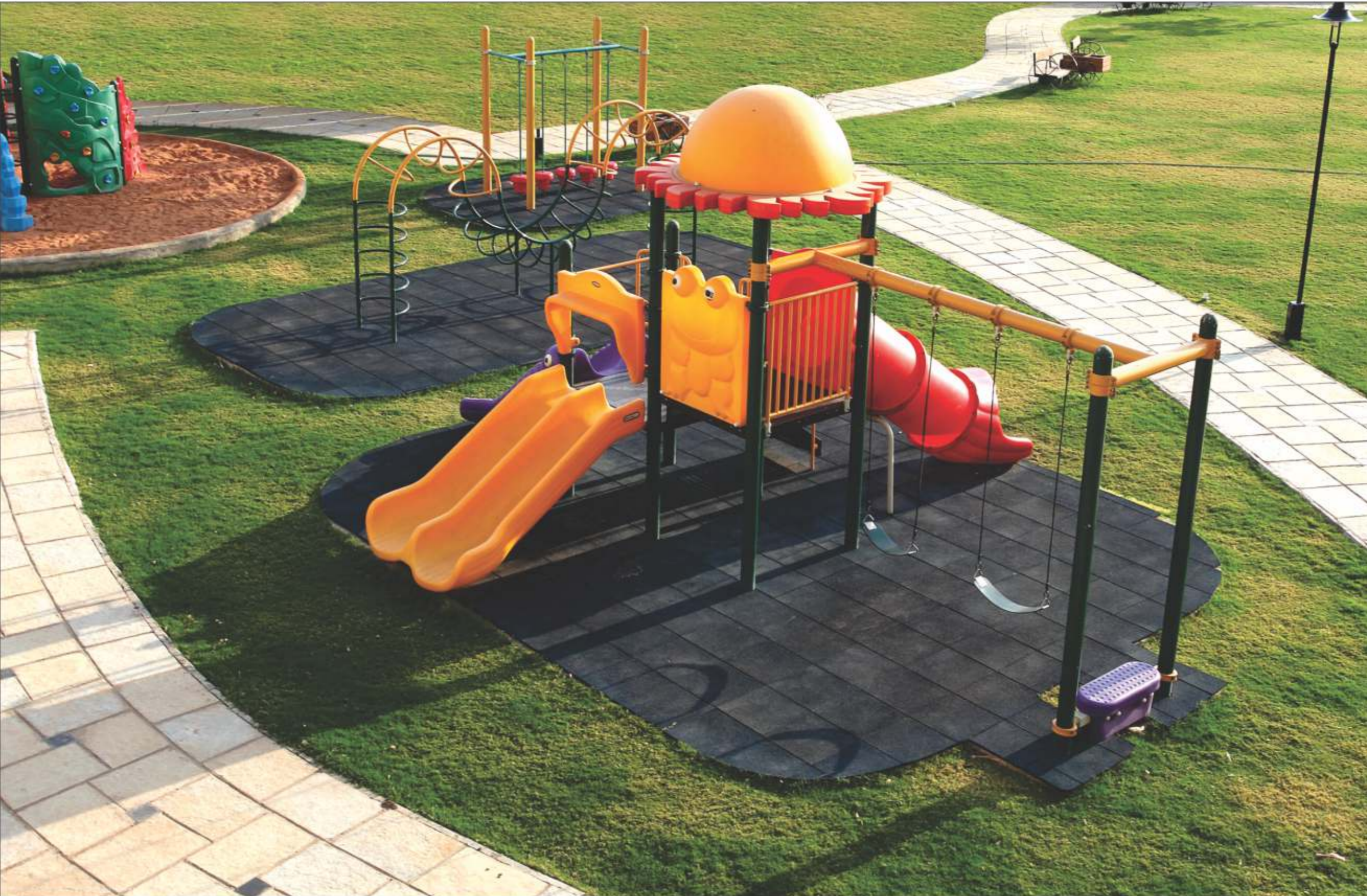
Sandpit | Toddlers' zone | Children's play area