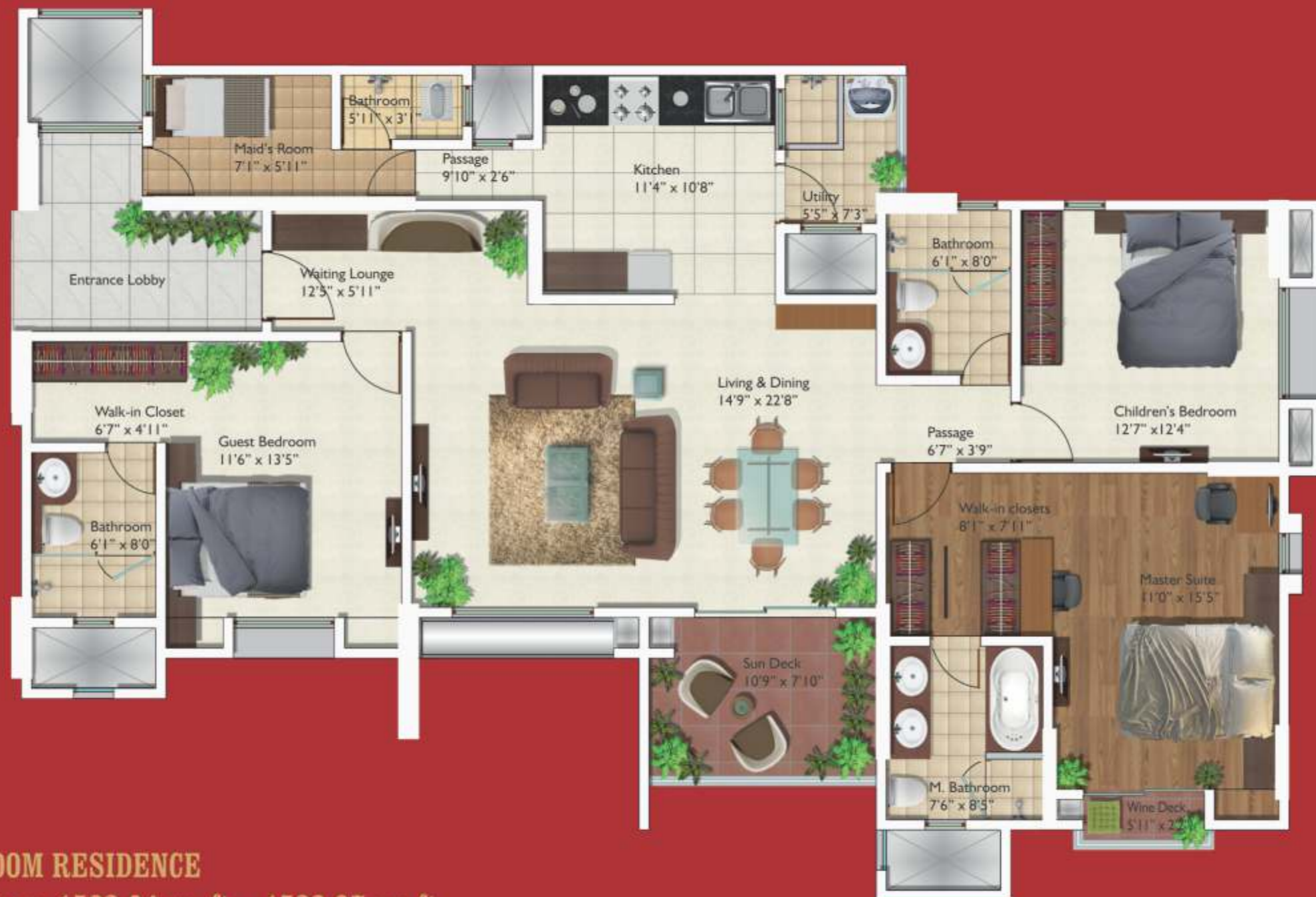
3 BEDROOM RESIDENCE Carpet Area: 1532.04 sq. ft. - 1533.97 sq. ft.