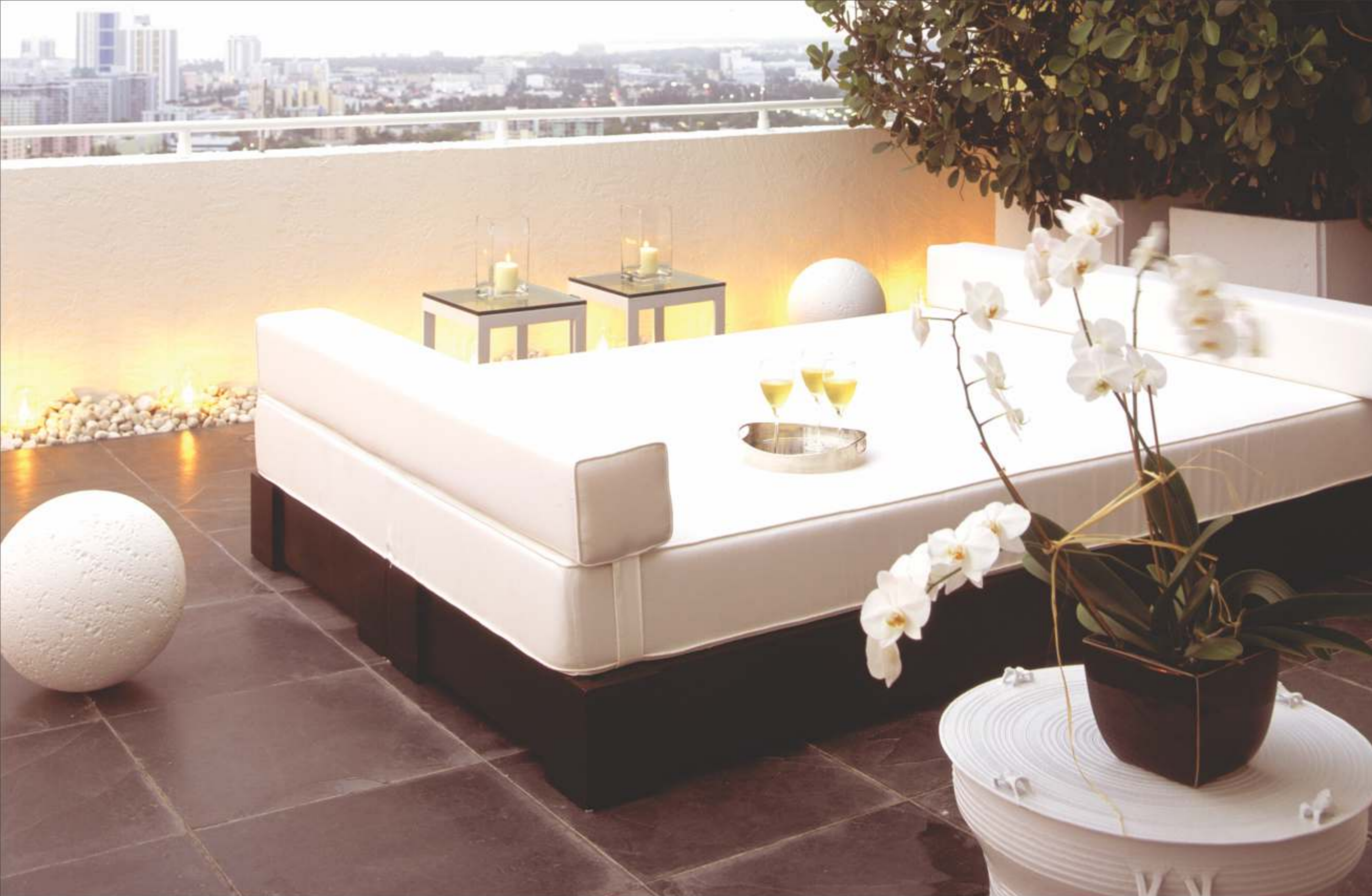
Exclusive rooftop cabana spaces