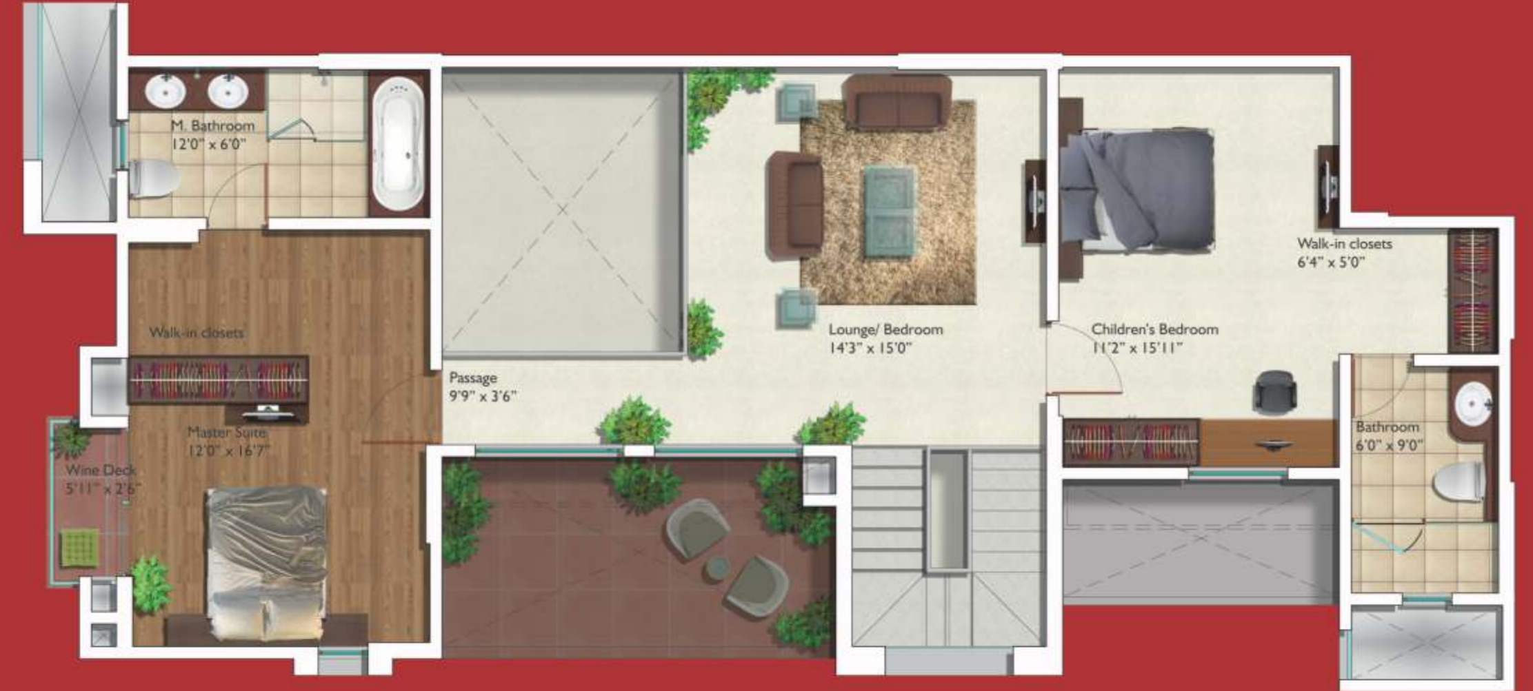
3 / 4 BEDROOM RESIDENCE