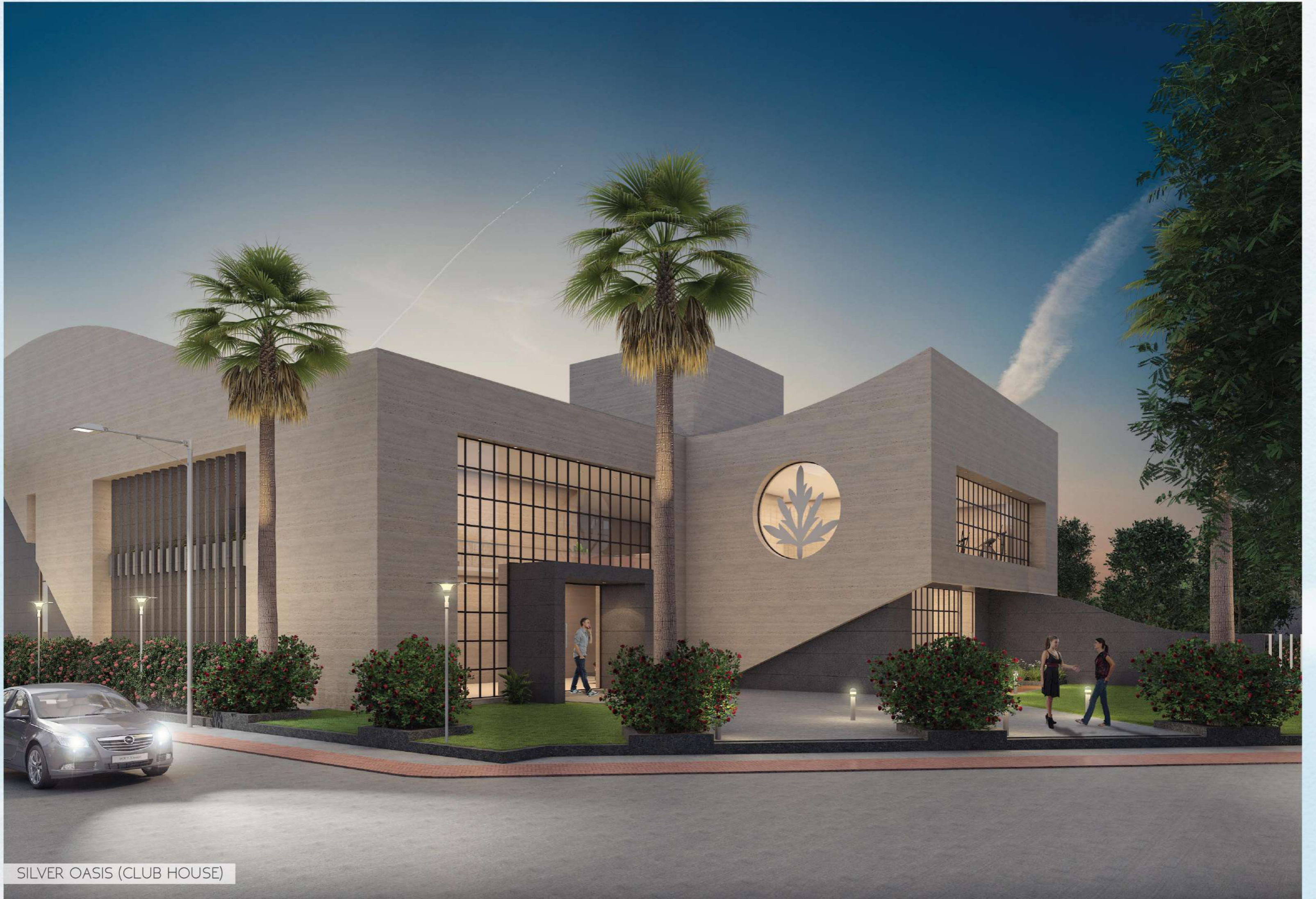
SILVER OASIS (CLUB HOUSE)