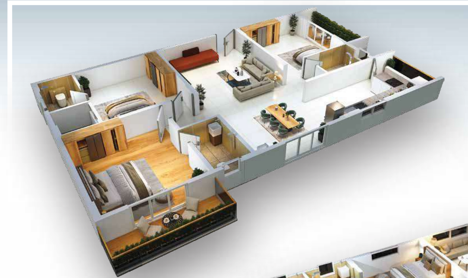
FLAT # 2