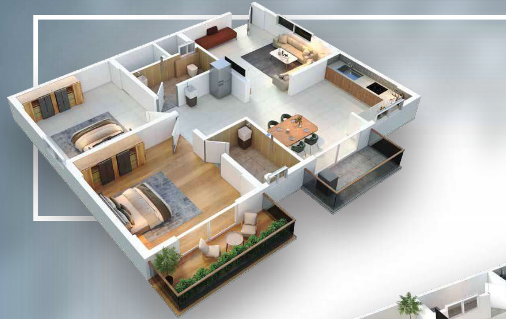
FLAT # 3 & 4