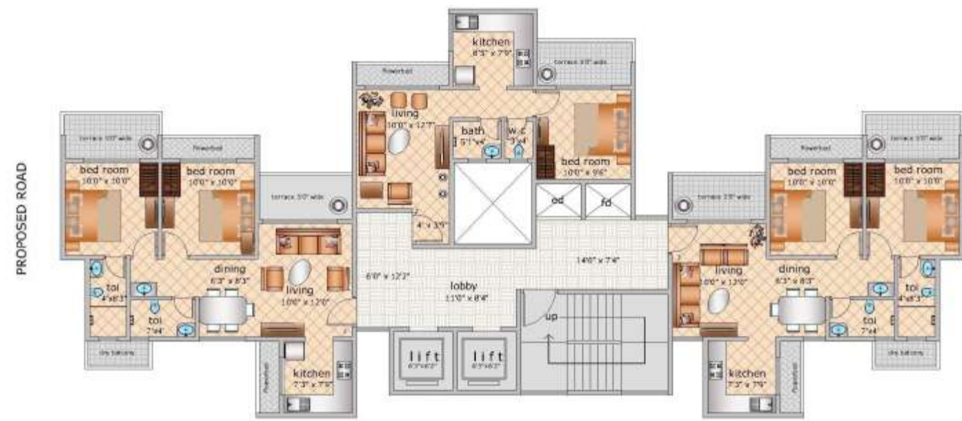
1st, 3rd, 5th, 7th, 9th & 11th Floor Plan