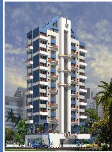
R. S. GRANDEUR, Koparkhairane