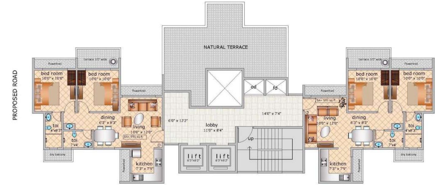
14th Floor Plan