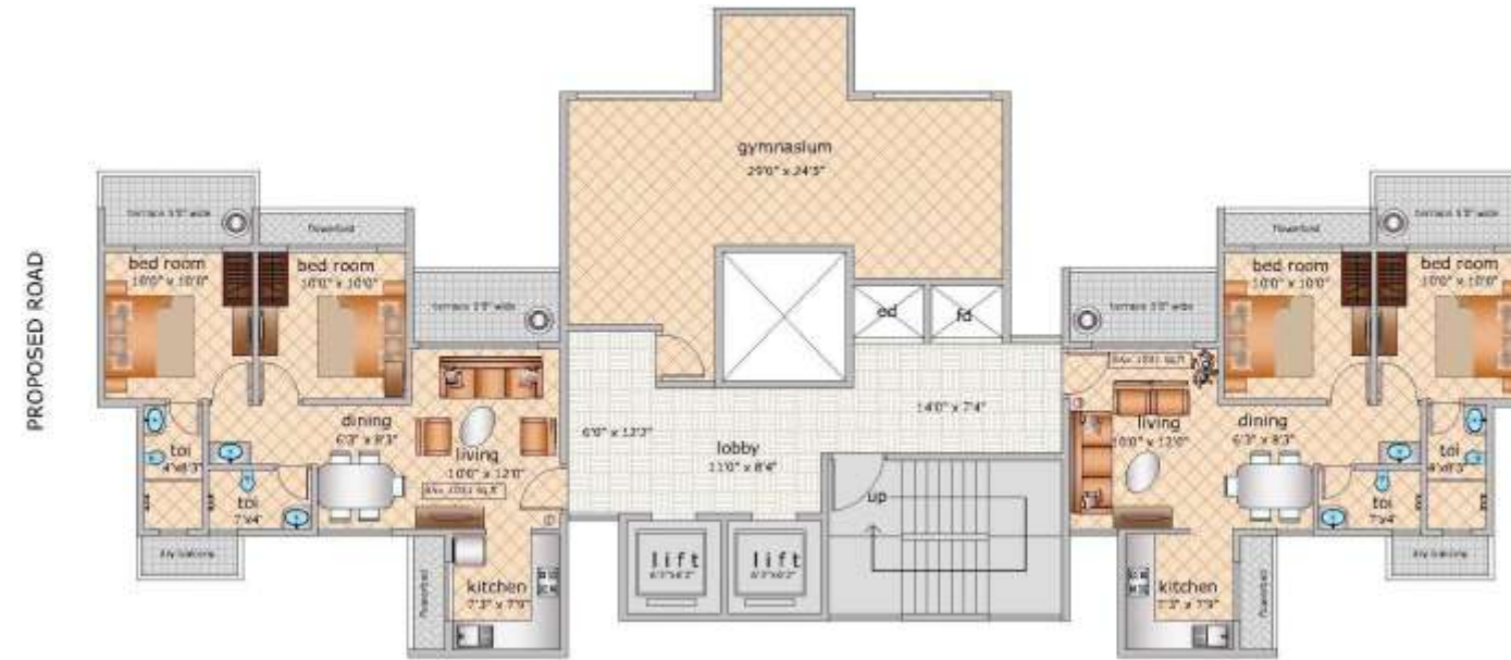
13th Floor Plan