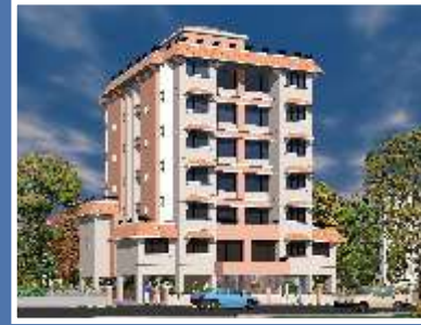
SATT BHAWAN, Koparkhairane