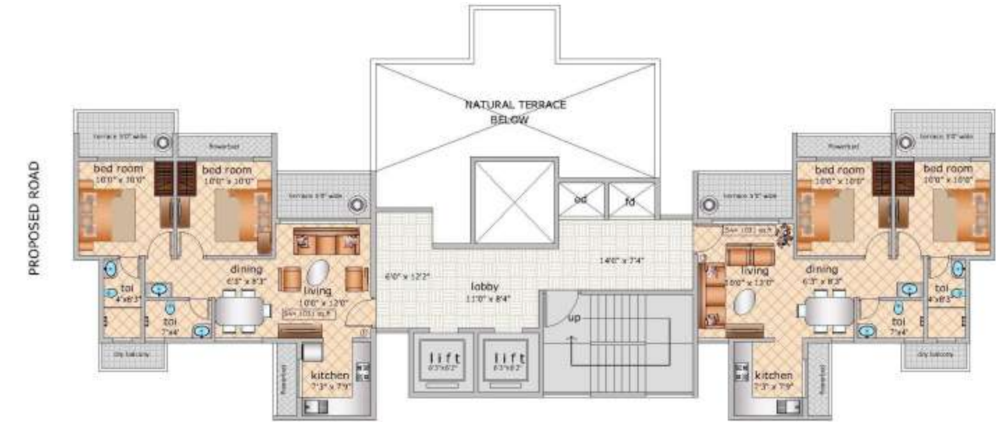
15th Floor Plan