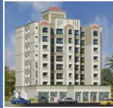
R. S. REGENCY, Koparkhairane