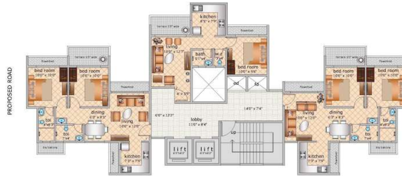
2nd, 4th, 6th, 8th, 10th & 12th Floor Plan