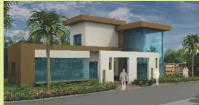
Our Club House