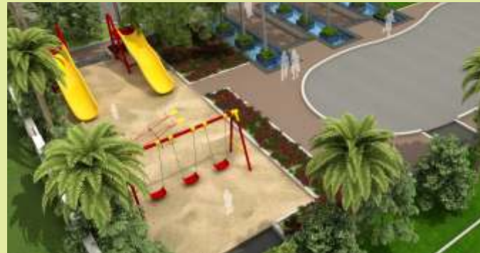
Our Children Play Area