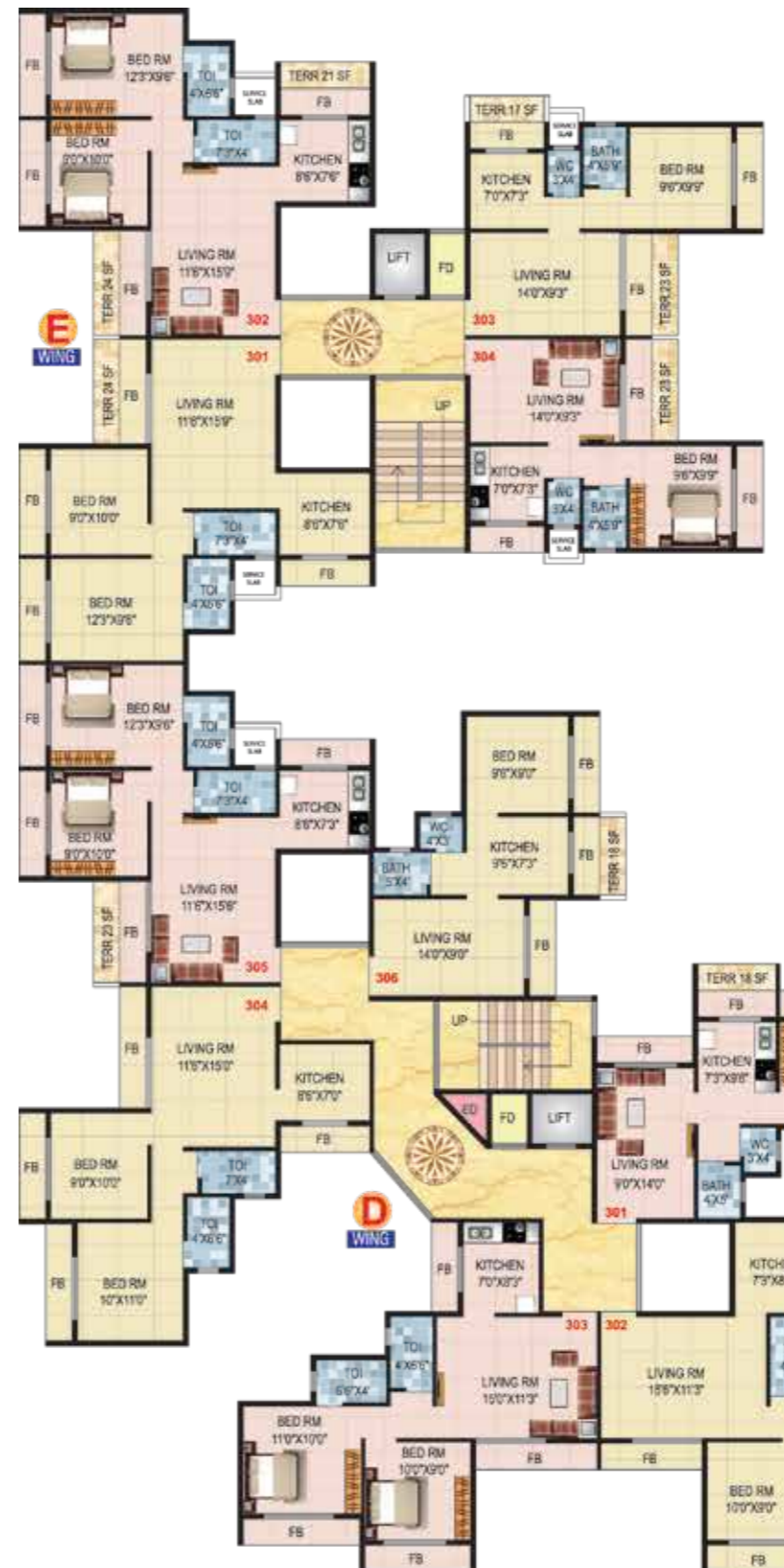
3rd Floor Plan