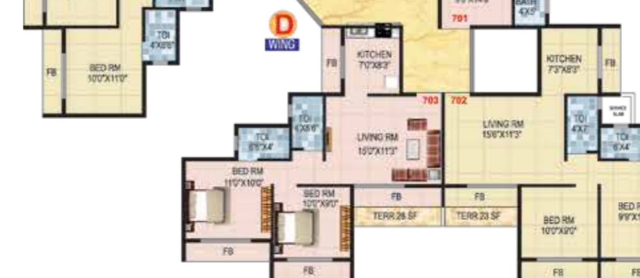
7th Floor Plan