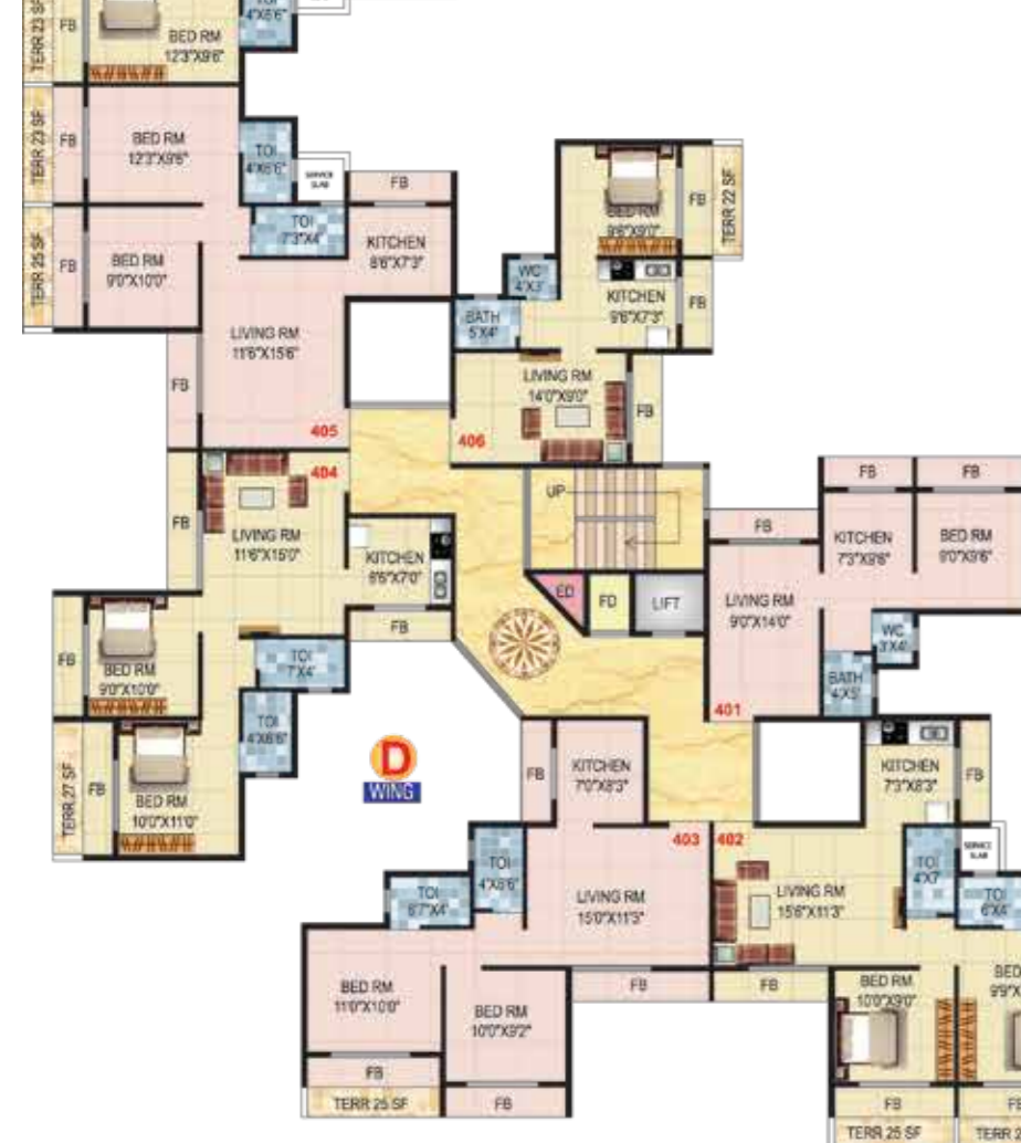
4th Floor Plan