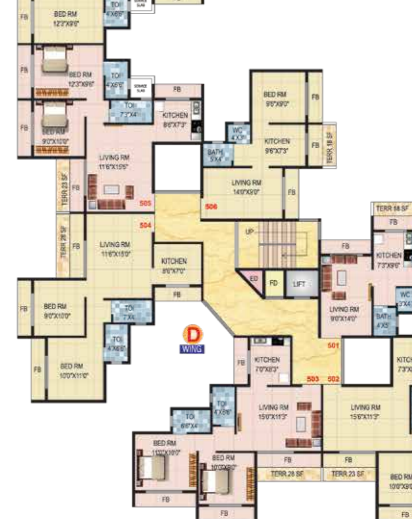
5th Floor Plan