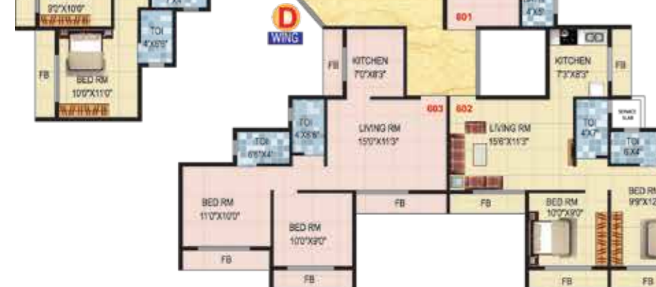
6th Floor Plan