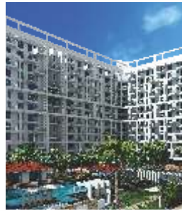
PRISTINE PROLIFE WAKAD