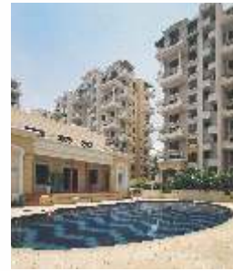
MONT VERT PRISTINE OFF AUNDH ROAD