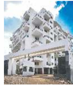
PRISTINE FONTANA BAVDHAN