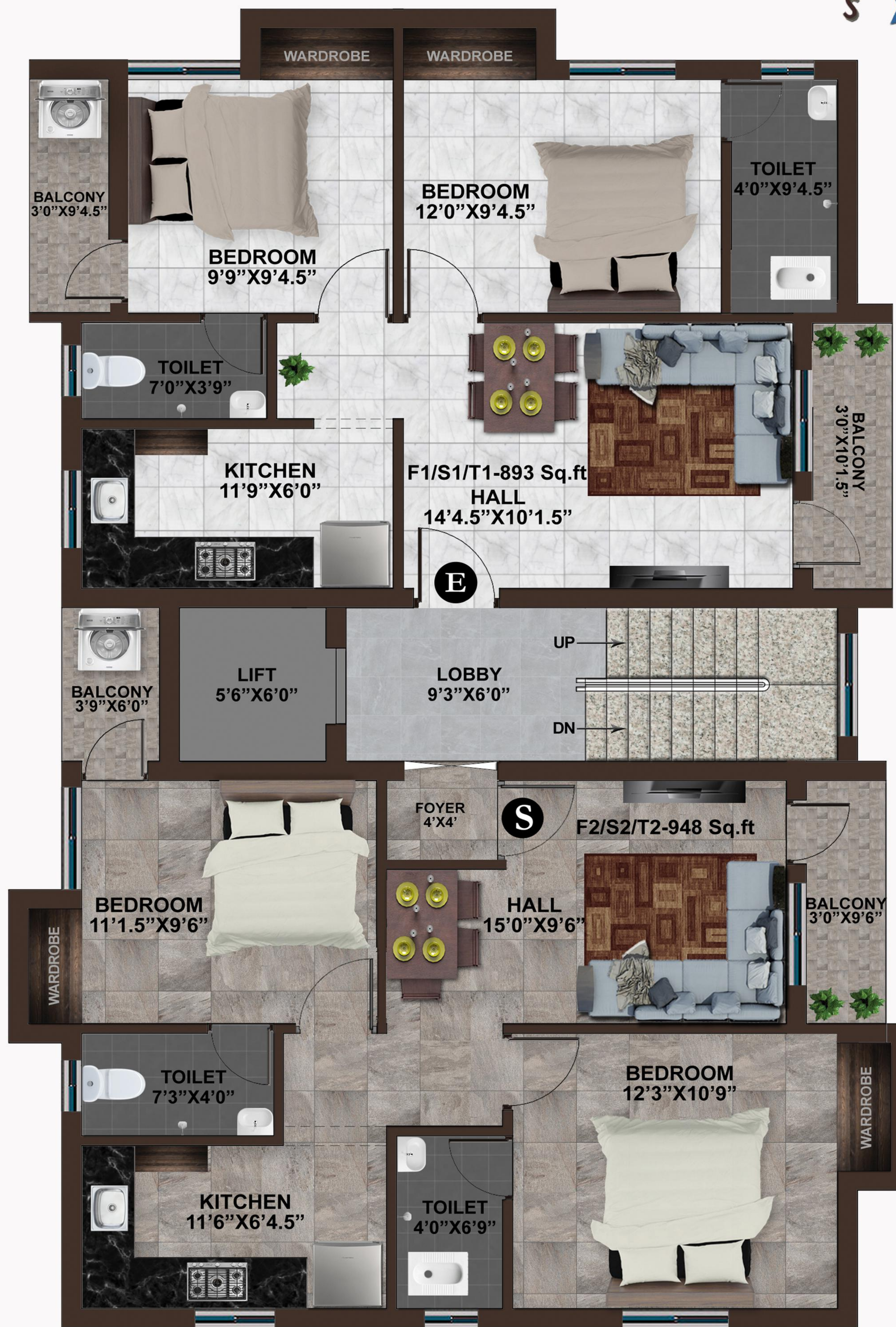
TYPICAL 1st, 2nd & 3rd FLOOR PLAN