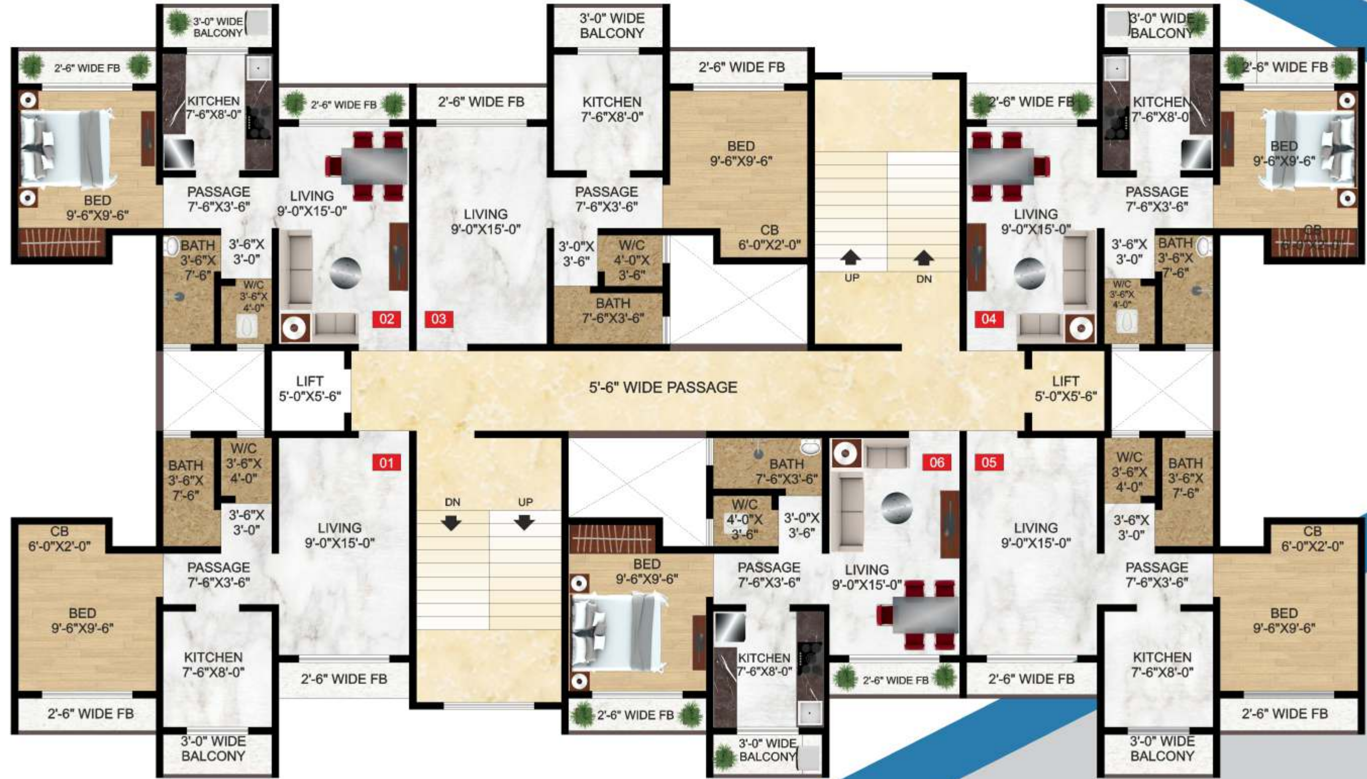
TYPICAL FLOOR PLAN (1ST TO 7TH) (BLDG-B)