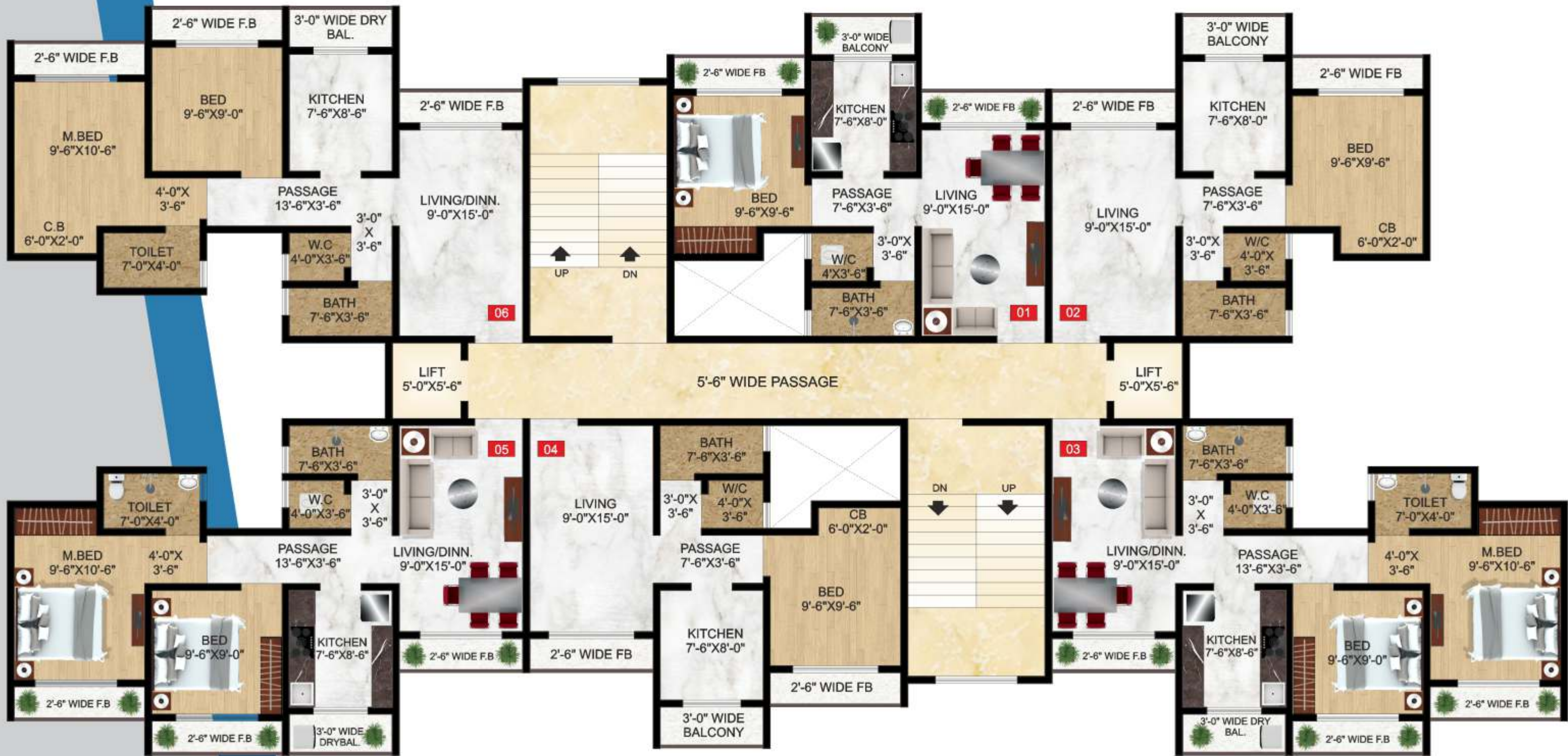
TYPICAL FLOOR PLAN (1ST TO 7TH )(BLDG-A)