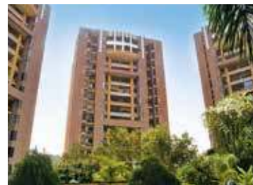
VIJAY ENCLAVE TOWER 1, 2 & 3