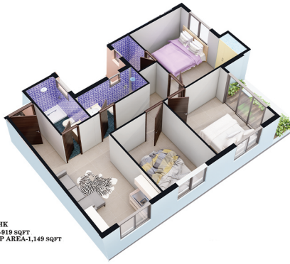
FLAT =B 3BHK BUILT-UP AREA-919 SQFT SUPER BUILT-UP AREA-1,149 SQFT