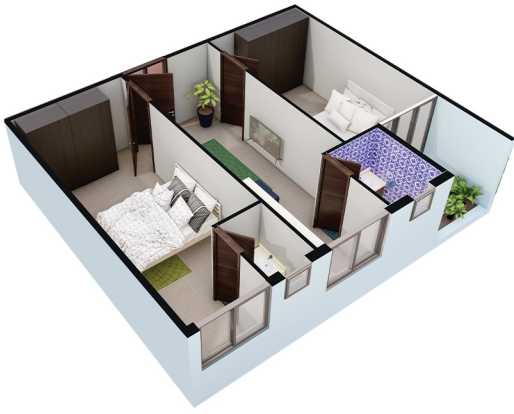
FLAT =D 2BHK BUILT-UP AREA-701 SQFT SUPER BUILT-UP AREA-876 SQFT