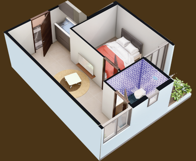
FLAT =E 1BHK BUILT-UP AREA-430 SQFT SUPER BUILT-UP AREA-534 SQFT