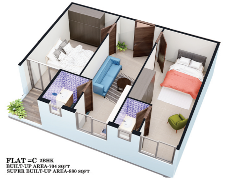
FLAT =C 2BHK BUILT-UP AREA-704 SQFT SUPER BUILT-UP AREA-880 SQFT