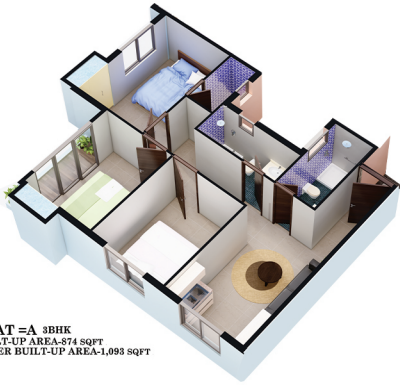
FLAT =A 3BHK BUILT-UP AREA-874 SQFT SUPER BUILT-UP AREA-1,093 SQFT