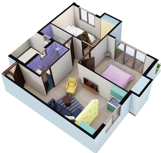
FLAT =H 2BHK BUILT-UP AREA-687 SQFT SUPER BUILT-UP AREA-859 SQFT