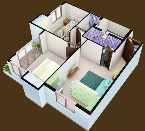
FLAT =G 2BHK BUILT-UP AREA-698 SQFT SUPER BUILT-UP AREA-873 SQFT