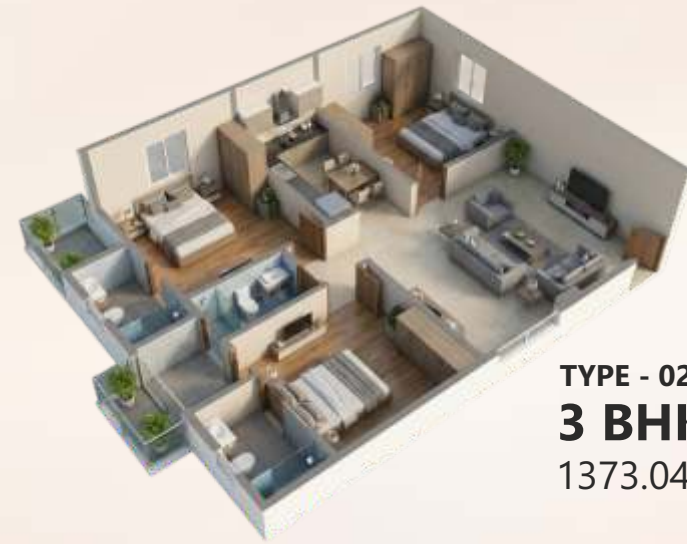
TYPE - 02 3 BHK 1373.04 SQ. Ft. —