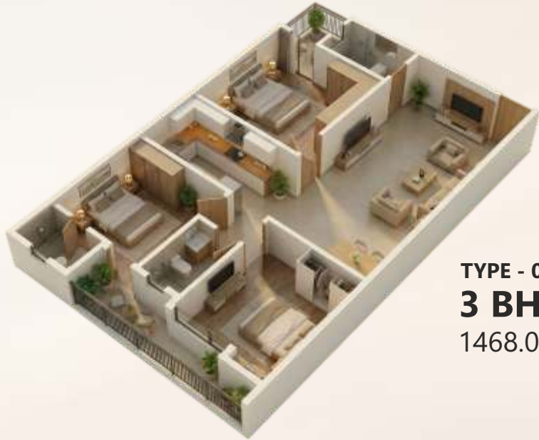
TYPE - 01 3 BHK 1468.06 SQ. Ft. —