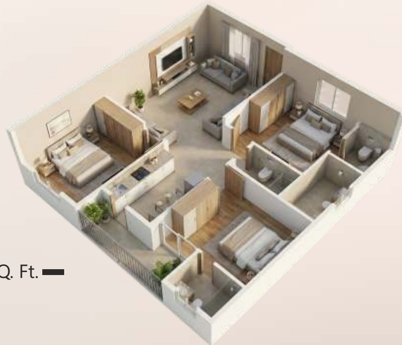
TYPE - 07 3 BHK 1370.06 SQ. Ft. —