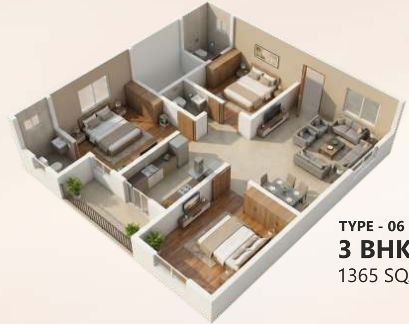
TYPE - 06 3 BHK 1365 SQ. Ft. —