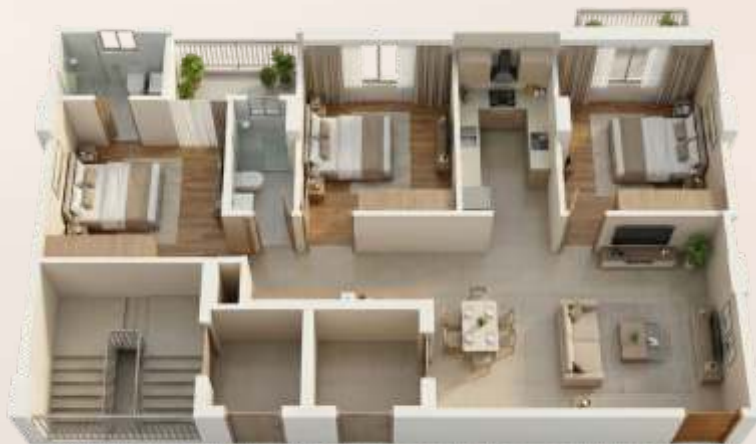
TYPE - 03 3 BHK 1330 SQ. Ft. —