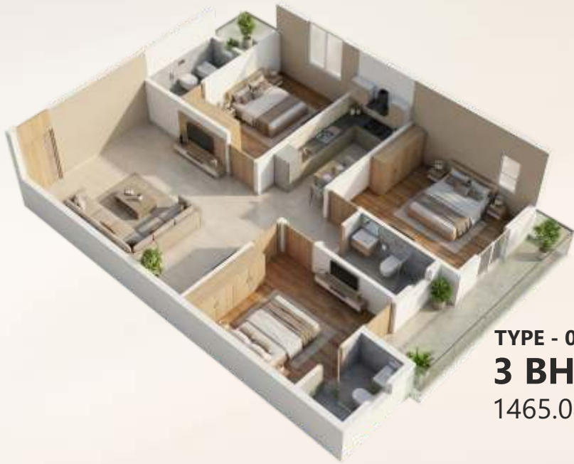
TYPE - 05 3 BHK 1465.08 SQ. Ft. —