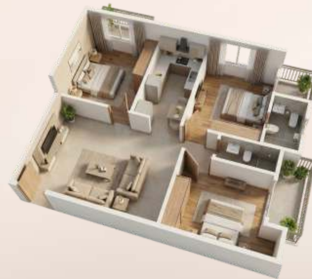
TYPE - 04 3 BHK 1317.04 SQ. Ft. —