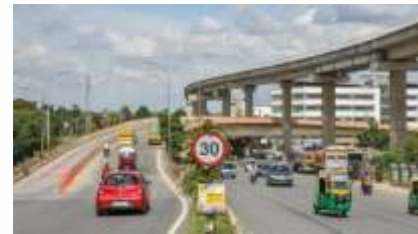
A top-level official in the BDA said that the state cabinet would likely approve the project in a few weeks following the court's green signal.

Sneha Ramesh DHNS Bengaluru, JAN 16 2022, 01:03 | UPDATED: JAN 16 2022, 01:52 IST