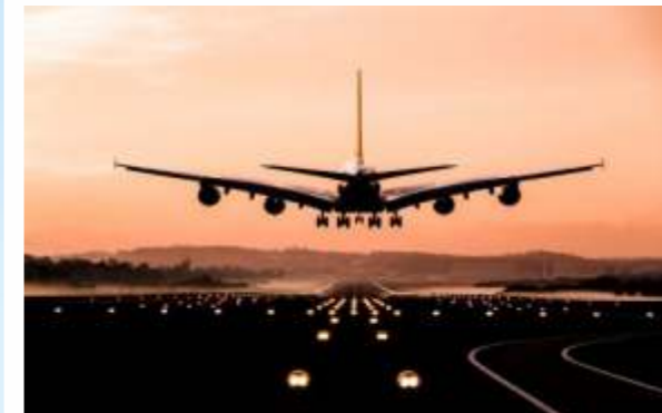
The Centre has granted approval for use of the Hosur airport under the UDAN scheme.

The industrial hub of Hosur in Tamil Nadu may have its own airport, with the Tamil Nadu Industrial Development Corporation (TIDCO) seeking proposals from consultants to assess demand, forecast air traffic and identify potential sites for the project.