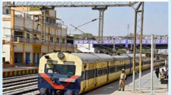
The K-RIDE has started a tender for construction of corridor number 1, that is from Baiyappanahalli to Chikkabanasavara.

BENGALURU, FEBRUARY 02, 2022 04:00 IST UPDATED: FEBRUARY 02, 2022 04:00 IST