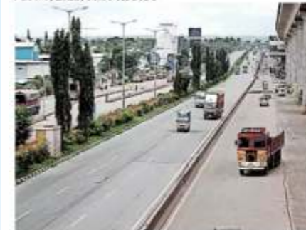
The Satellite Ring Road will connect Dobbaspet (Tumakuru Road) to Doddaballapur (Hyderabad Road). It's the first bypass around Bengaluru that will span across another state

Finally, big news for Bengaluru as the much-delayed Satellite Ring Road (STRR) project is set to take off. This project is crucial in driving away heavy traffic from entering the city, while this road will help people travel from one destination to another.