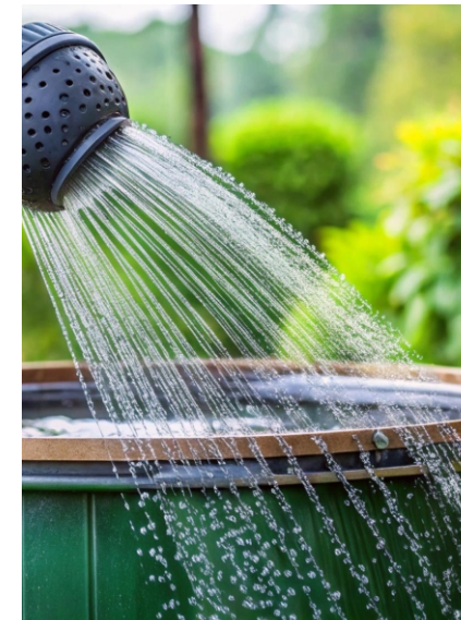
Rainwater harvesting collects and stores rainwater to save water and recharge groundwater.