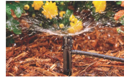
Use of Drip irrigation system with moisture sensors for efficient water management in horticulture areas.