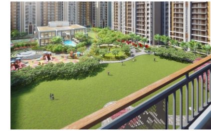
Experience nature every day with lush green surroundings and open spaces.