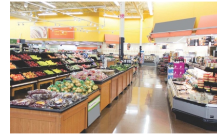
Daily essentials like grocery store, salon, bank, community centre and medical shop within 1 km walking distance from the building entrance.