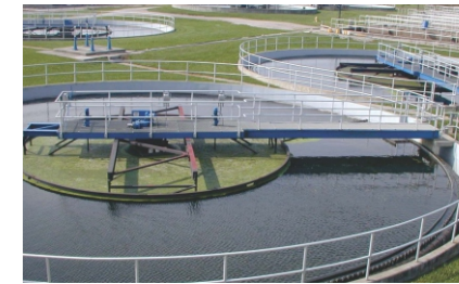
Sewage Treatment Plant (STP) to recycle wastewater for landscaping and flushing purposes.