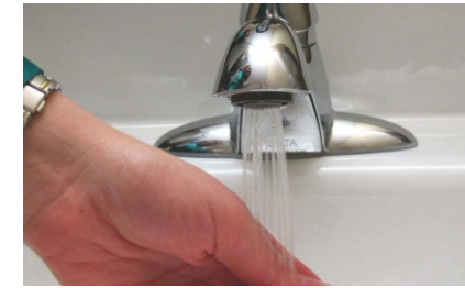
Low-flow water fixtures installed to conserve water.