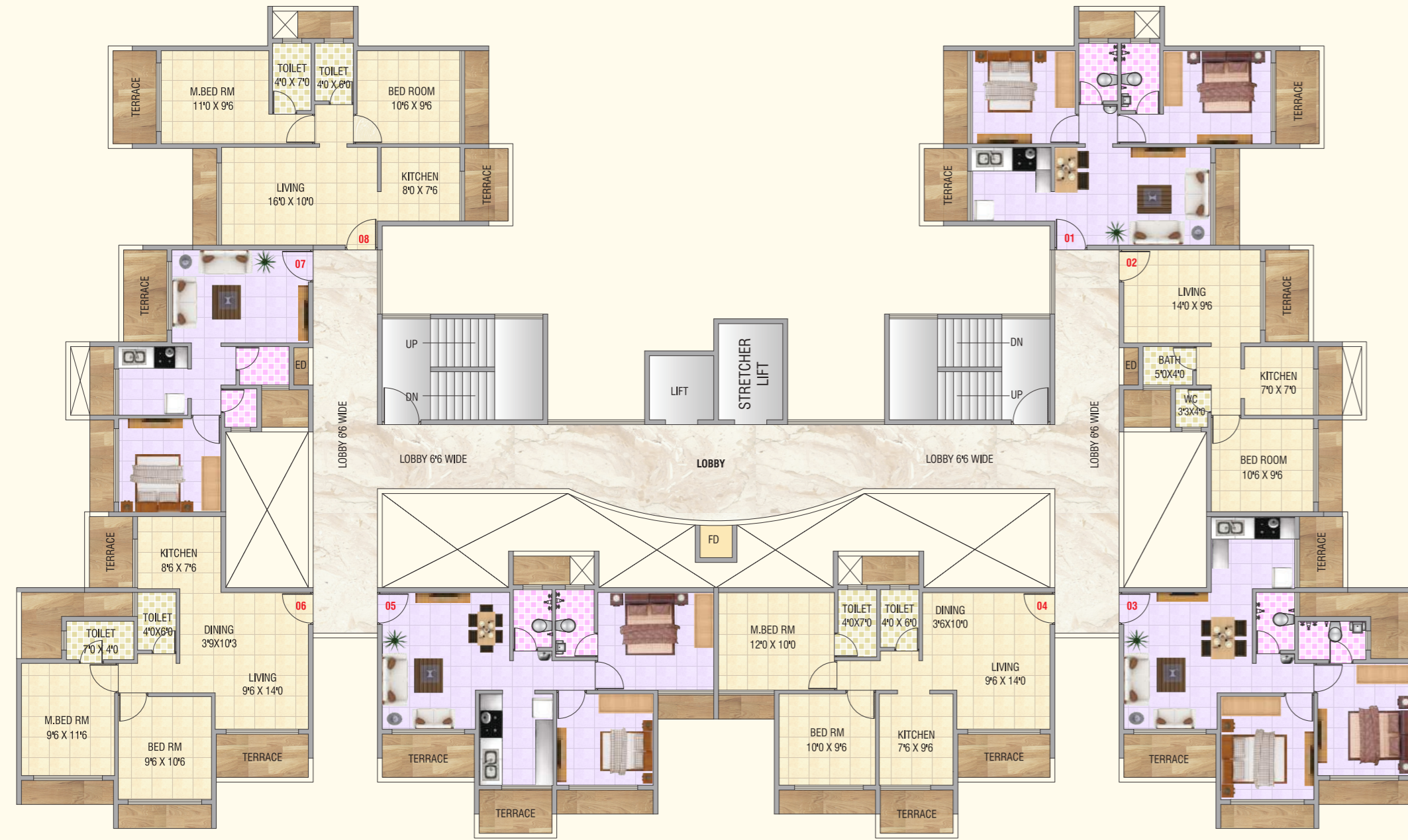
Typical Odd Floor Plan