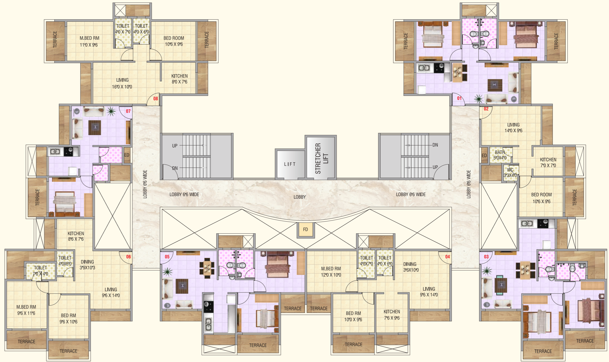
Typical Even Floor Plan