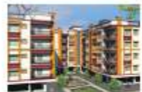
MEENA RESIDENCY 2