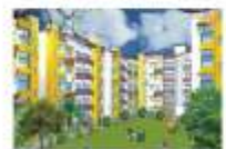
MEENA RESIDENCY 1