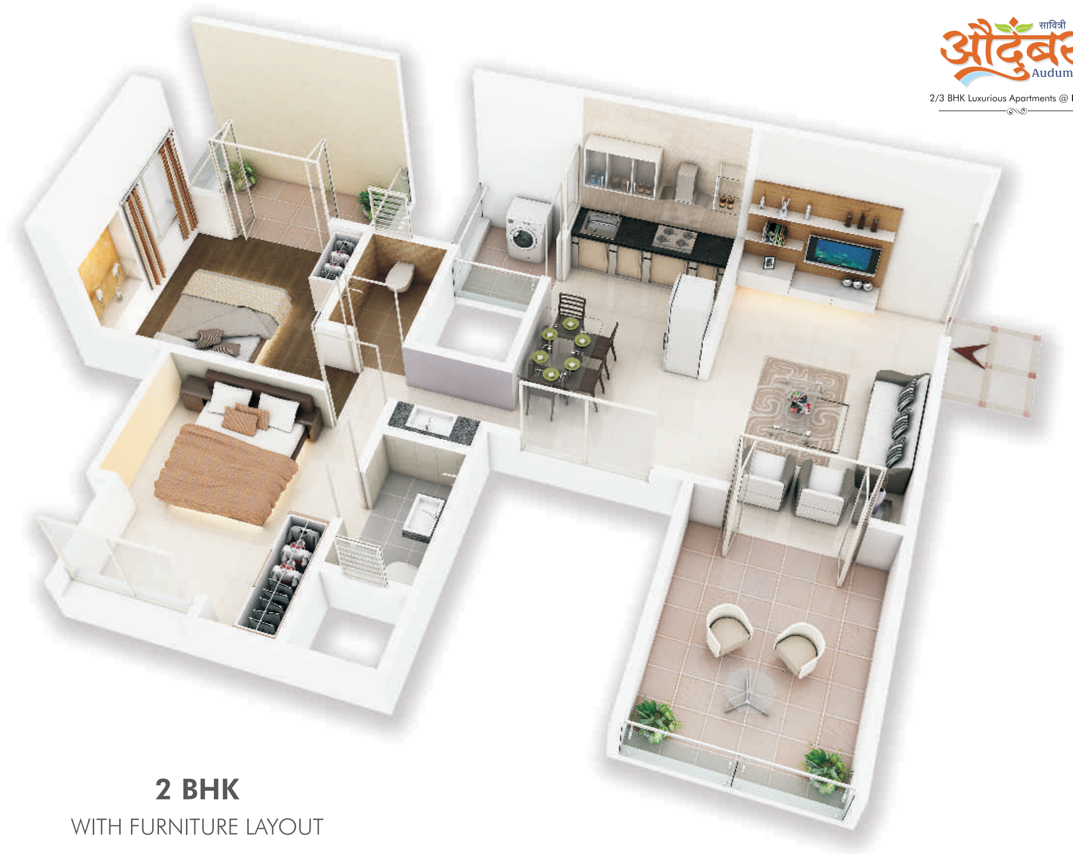
2 BHK WITH FURNITURE LAYOUT