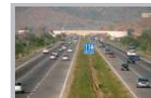
Mumbai -Pune Exp. Highway