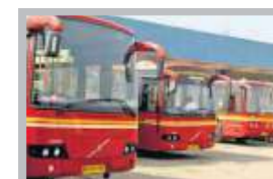
Panvel St Stand