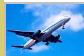
Up coming Airport