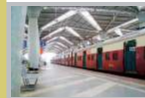
Panvel Railway Station