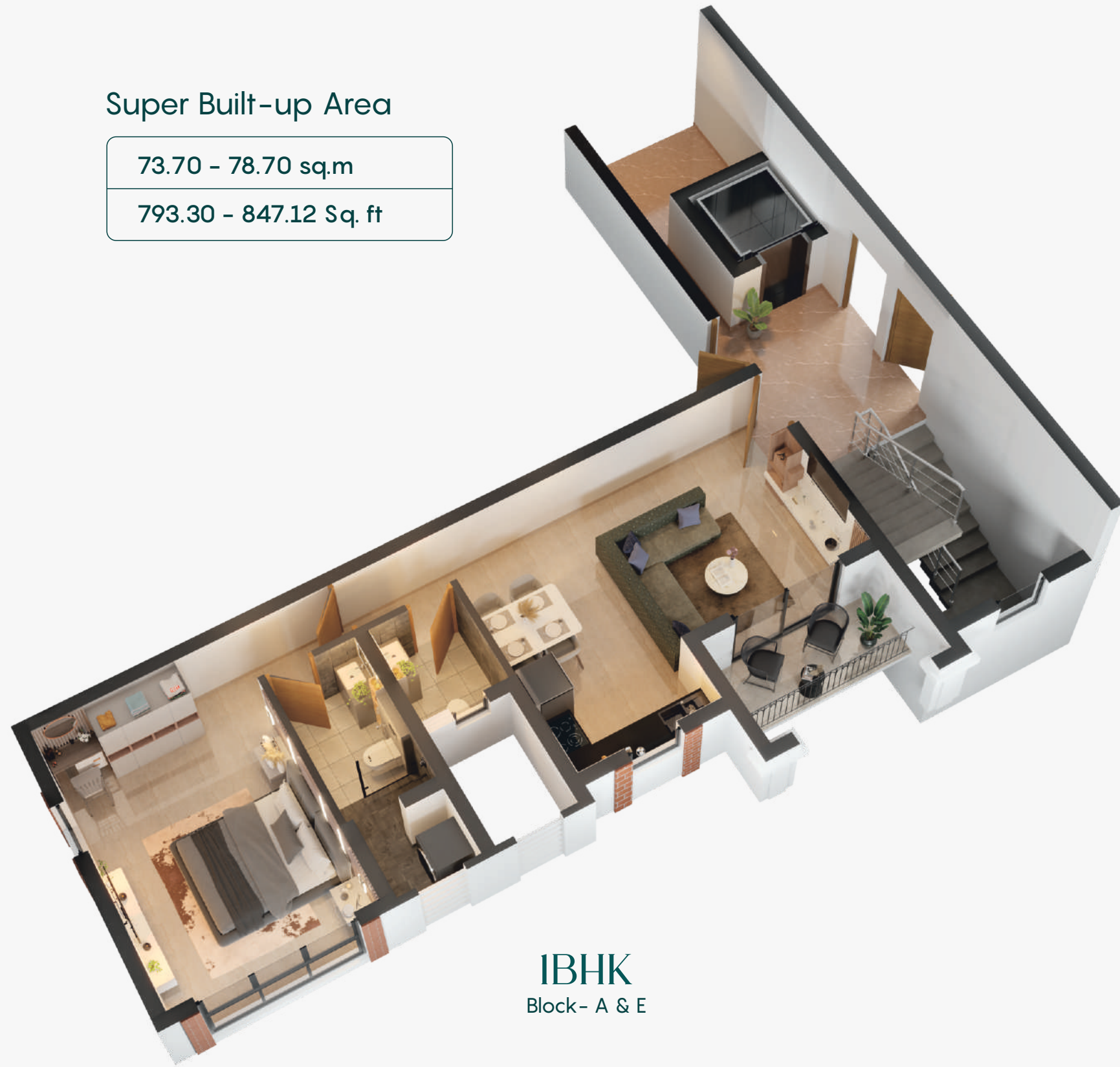
IBHK Block- A & E