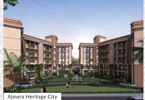
Ajmera Heritage City