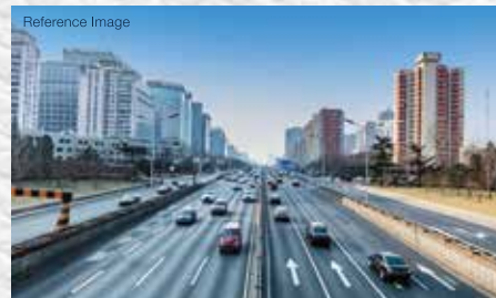
SION PANVEL HIGHWAY