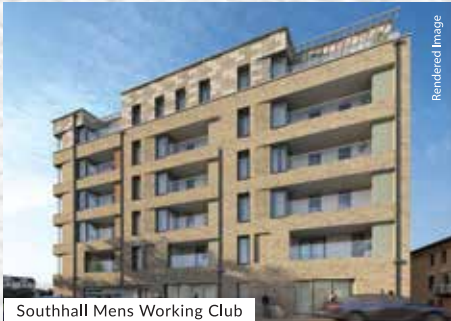
Southhall Mens Working Club