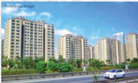
DIRECT ACCESS TO EASTERN FREEWAY