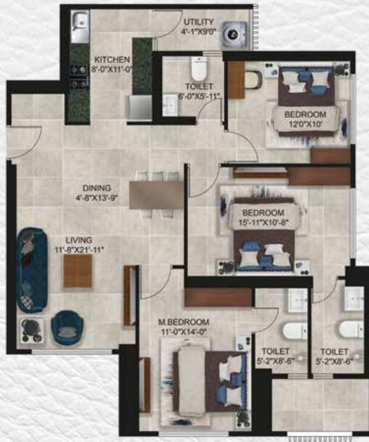
3 BHK LUXURY | RERA CARPET: 1122 SQ.FT