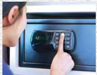
SAFE DEPOSIT LOCKERS