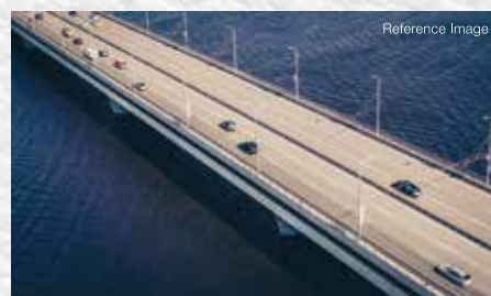
10 MINUTES TO PROPOSED NHAVA SHEVA SEA LINK