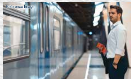
PROPOSED METRO RAIL - LINE 4