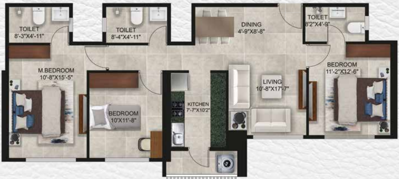
3 BHK ELEGANT | RERA CARPET: 977 SQ.FT