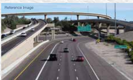
7 MINUTES TO BKC VIA BKC CHUNABHATTI CONNECTOR