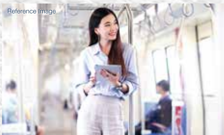
BHAKTI PARK MONORAIL STATION