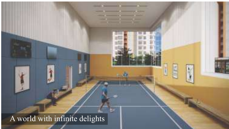
A world with infinite delights