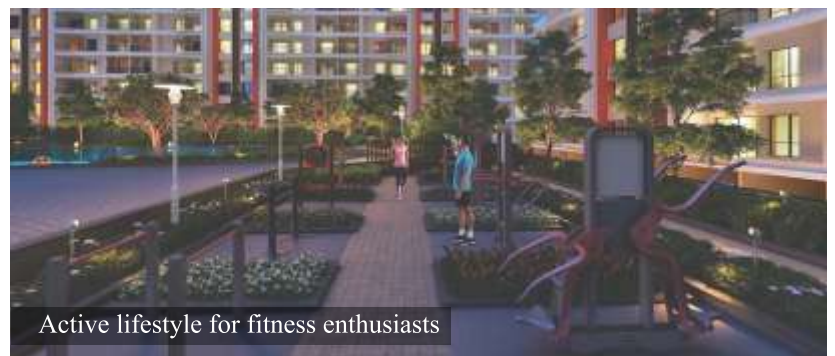
Active lifestyle for fitness enthusiasts