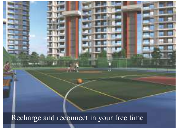
Recharge and reconnect in your free time