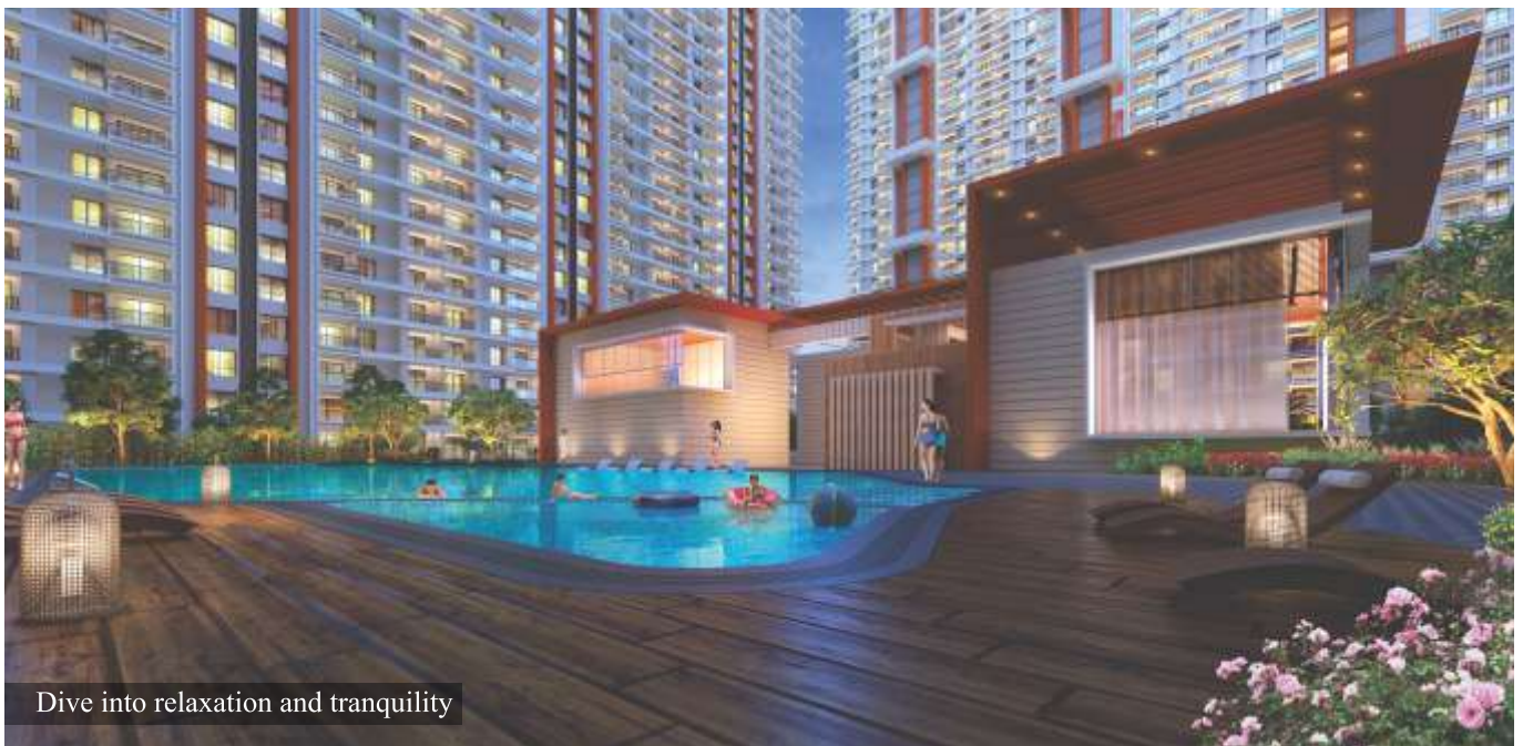
Dive into relaxation and tranquility

Play Zones: Toddlers' Play Area | Sand Pit | Kids' Play Area | Ludo | Skating Rink