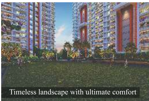
Timeless landscape with ultimate comfort