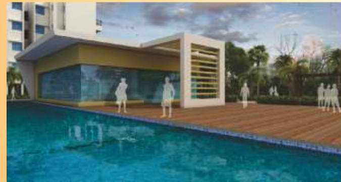
Our Swimming Pool