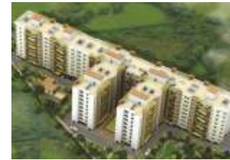
Aapla Ghar, Chakan