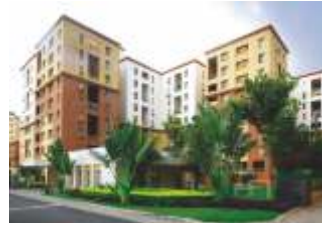
Zircon, Viman Nagar (2 & 3 BHK)