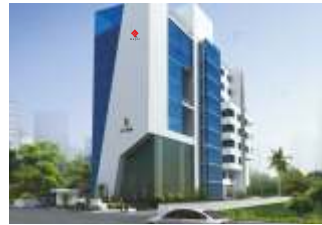
City Square, Shivaji Nagar