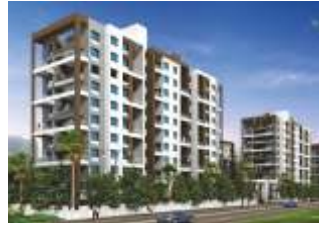
Aura County, Wagholi (1 & 2 BHK)