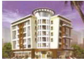
Sai Sparsh, Sadashiv Peth