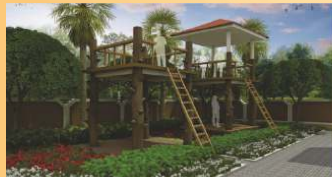
Our Chit-Chat Zone