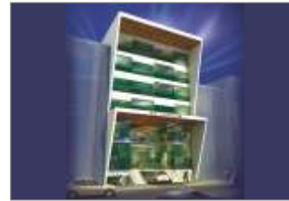
Sai Platinum, Sadashiv Peth