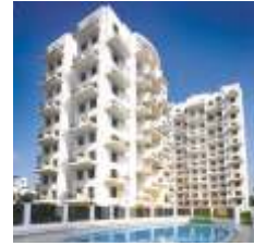
Prism, Aundh (2 & 3 BHK)