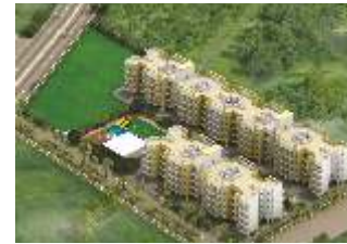
Aapla Ghar, Sanaswadi