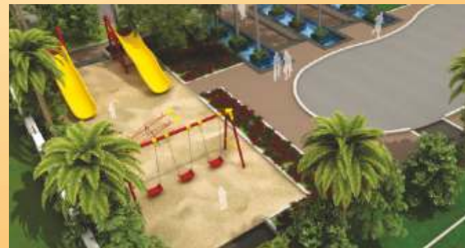
Our Play Ground