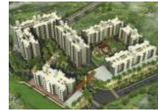
Aapla Ghar, Ranjangaon

100 Lac Square Feet, 13000 Units Ongoing Project