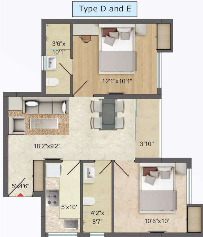
Type D and E