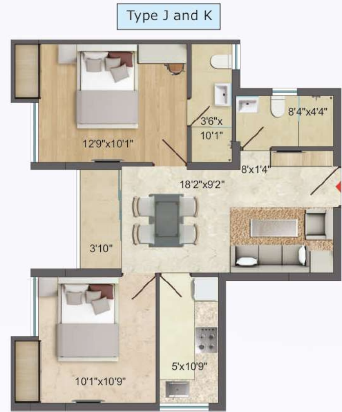
Type J and K