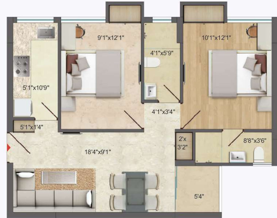
Type F and G