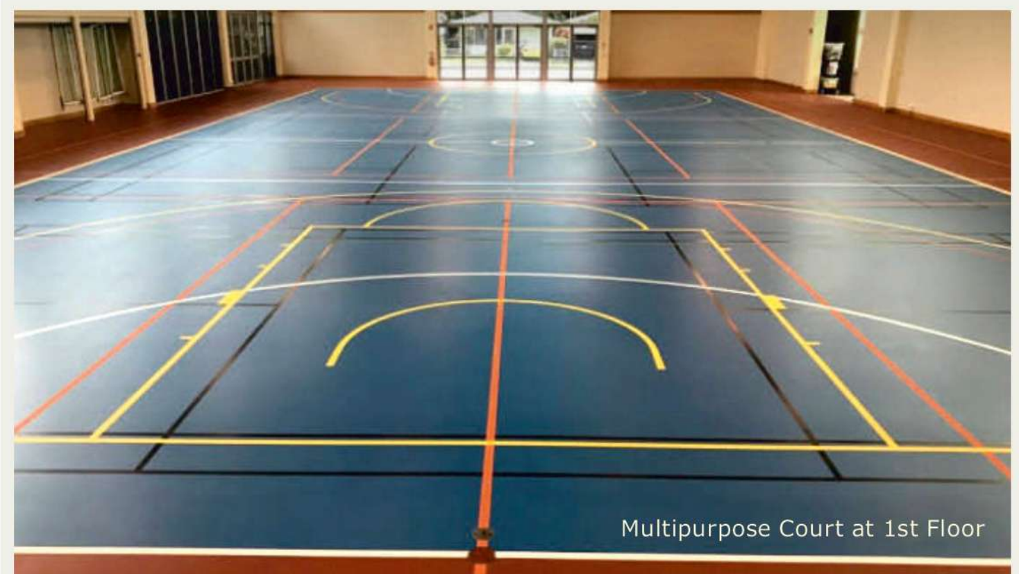
Multipurpose Court at 1st Floor