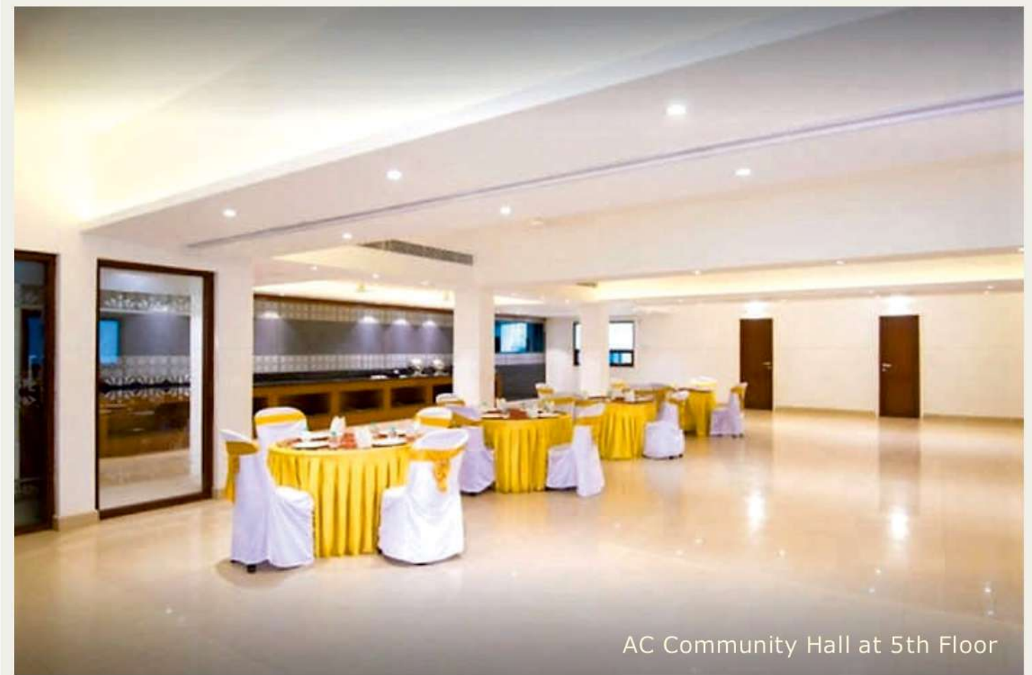
AC Community Hall at 5th Floor