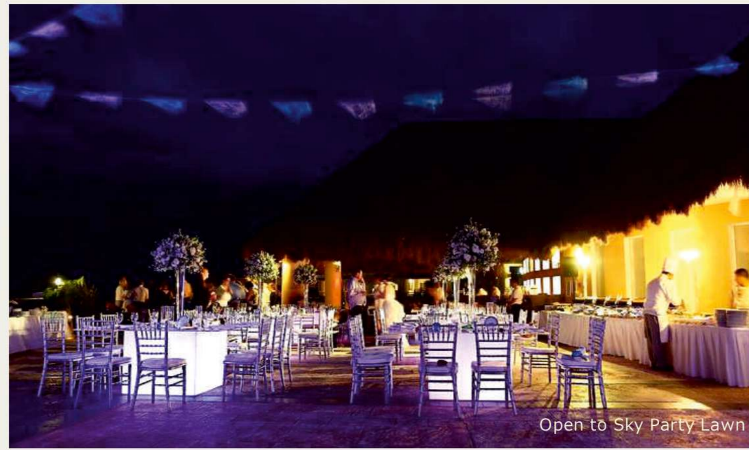
Open to Sky Party Lawn