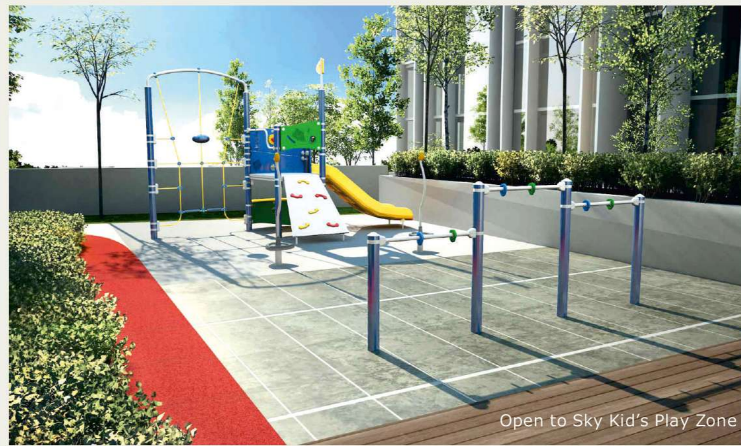
Open to Sky Kid's Play Zone