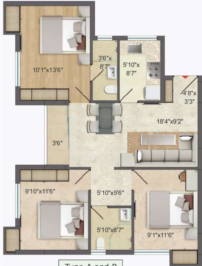
Type A and B