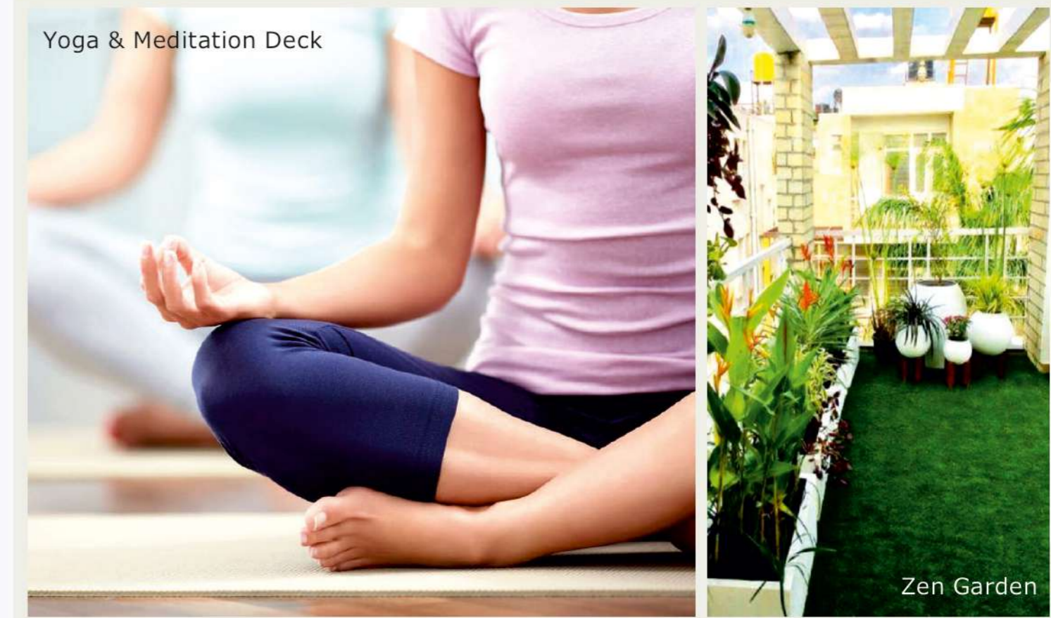
Yoga & Meditation Deck