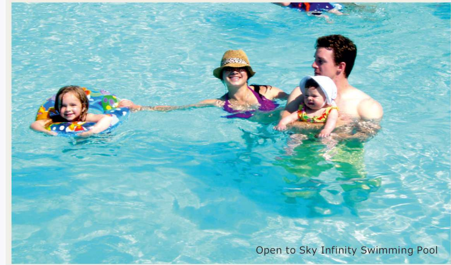
Open to Sky Infinity Swimming Pool