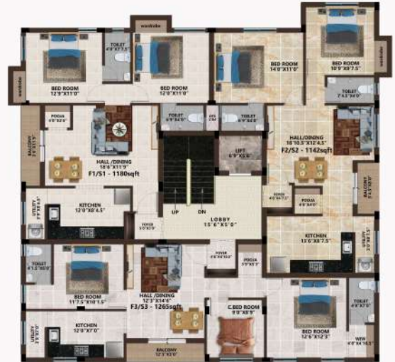
1st/2nd FLOOR PLAN