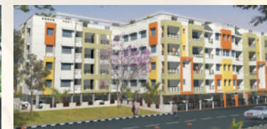
Scion Aleo Vera @ Kodihalli