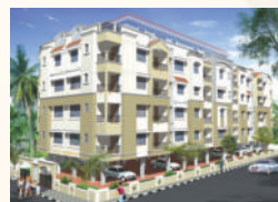
Scion Lavendula @ Doctor's Layout