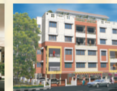
Scion Harmony @ Rahath Bagh