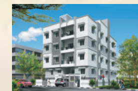
Scion Greenleaf @ OMBR Layout