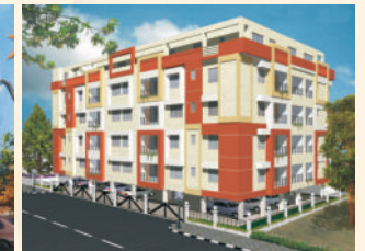
Scion Park View @ Doctor's Layout