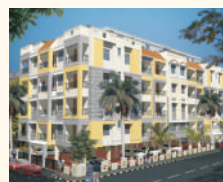
Scion Enclave @ Kodihalli