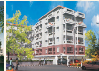
Scion Vista @ GM Palya