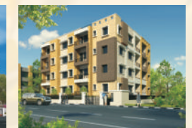
Scion Habitat @ Doctor's Layout