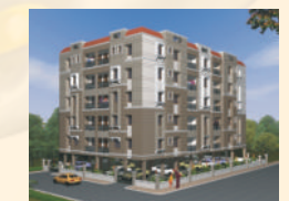
Scion Avenue @ Kaggadasapura