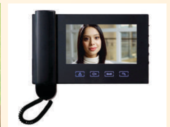
Video door phone

Scion Windflower offers you an unrivalled combination of luxury, convenience and value for connoisseurs of good living. The premium project offers competently priced apartments to 19 socially upscale families. As the adults find the gymnasium indulging, children will rejoice in play areas. The family enjoys peace of mind with professional security and electronic surveillance in place. For promoters, every detail is important in creating the magic for graceful and healthy living.