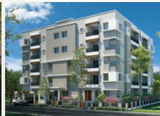
Scion El Dorado @ HBR Layout