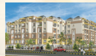
Scion Chitrakut @ CV Raman Nagar