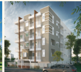
Scion Winsome @ HRBR – II Layout