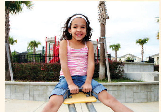
Children play area