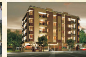
Scion Luxor @ HRBR Layout