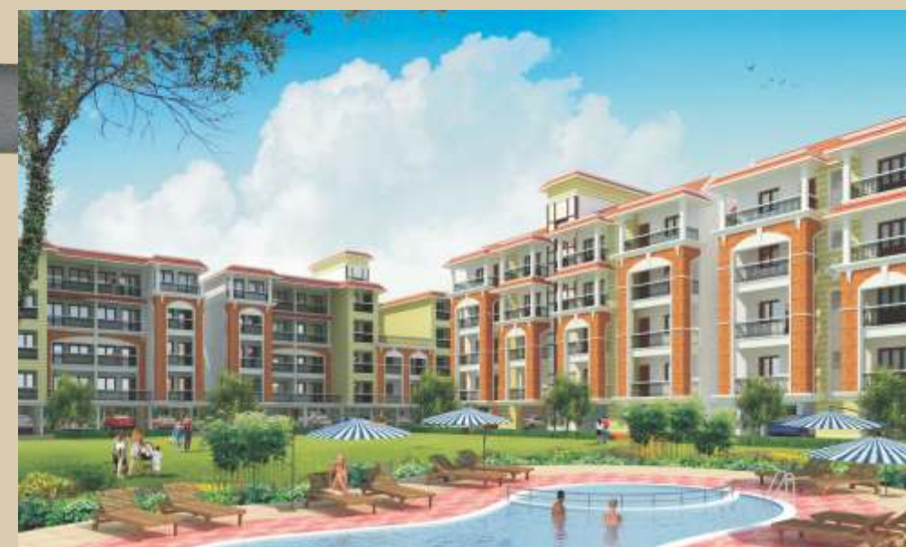
BUILDING B1, B2, B3, C1 & C2