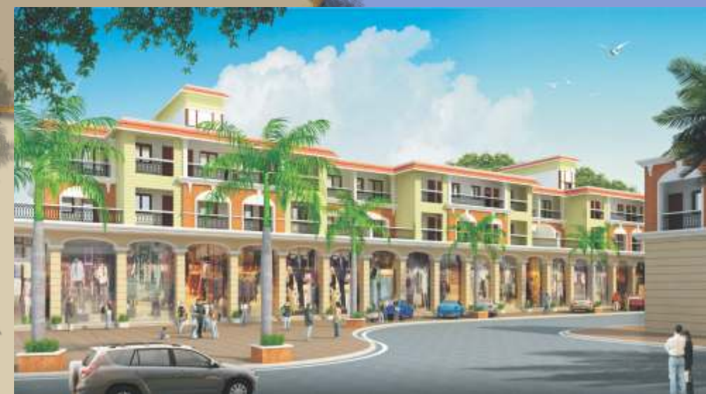
BUILDING A1 & A2