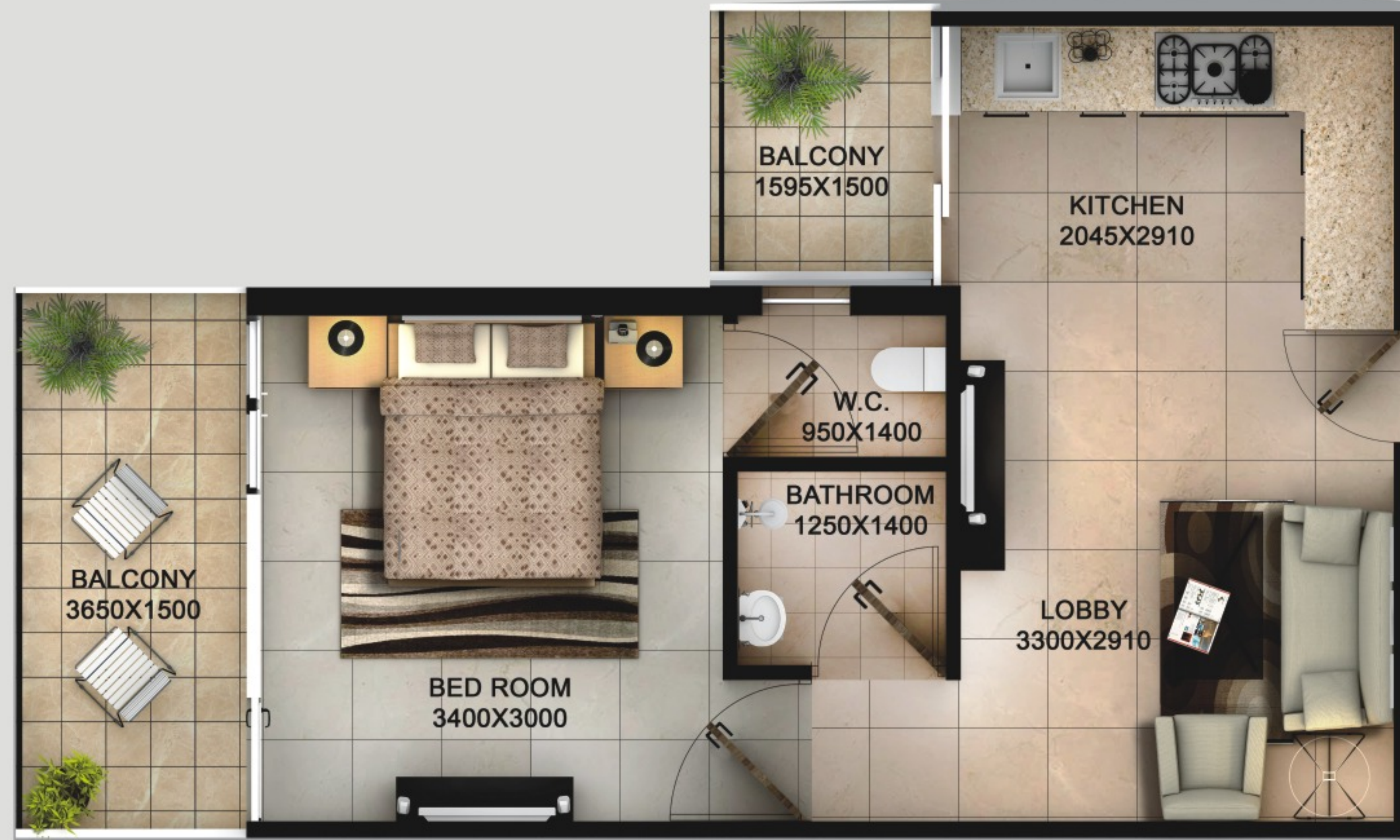
UNIT PLAN: 1BHK