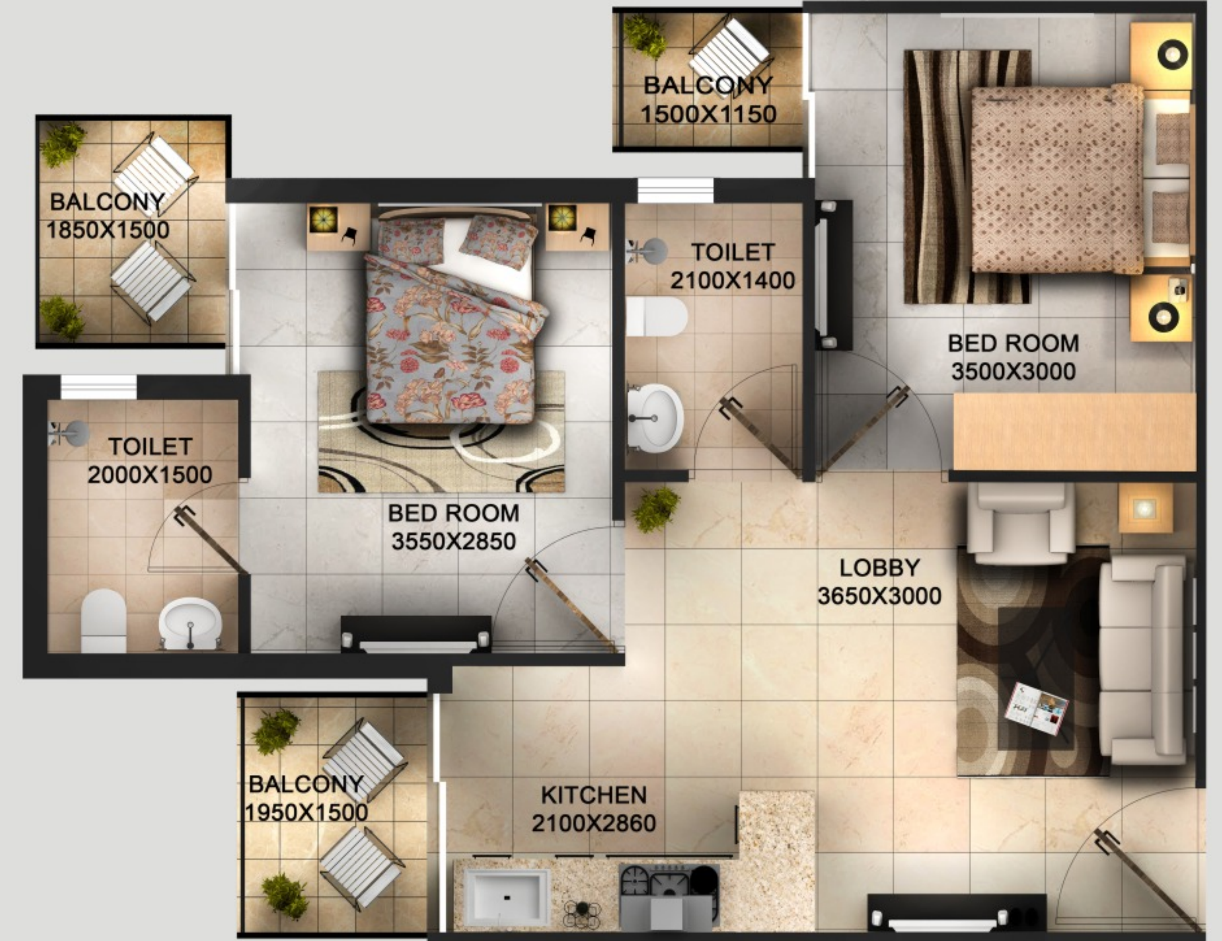
UNIT PLAN: 2BHK