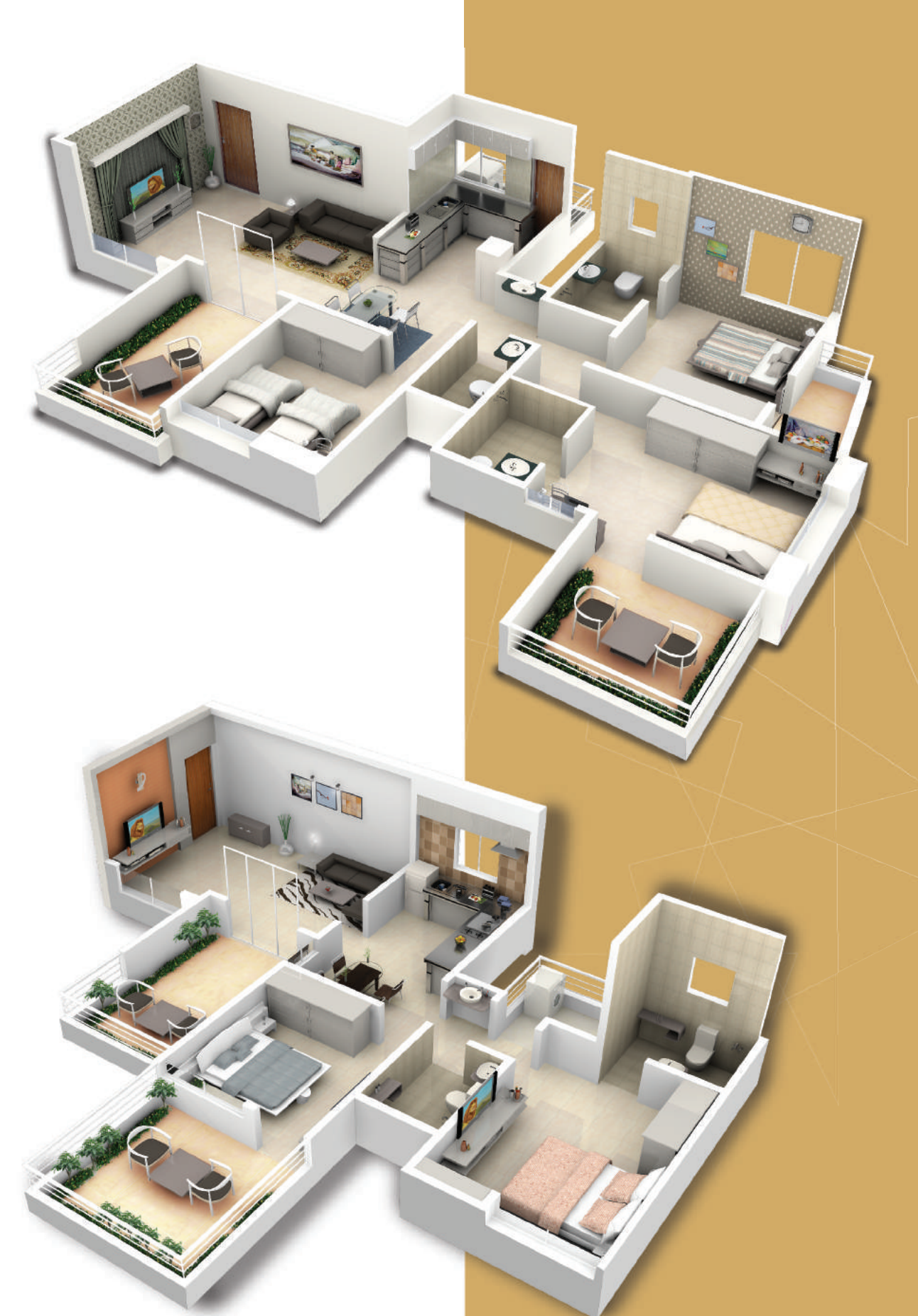
TYPICAL 3 BHKD LAYOUT