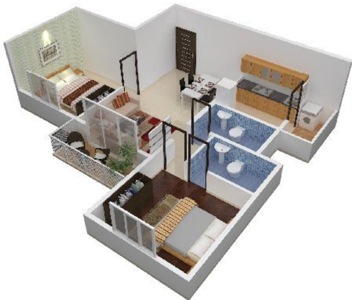
2 BHK Compact Area- 983 sqft