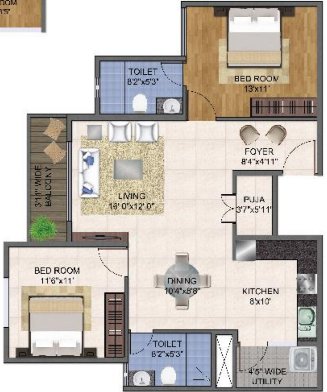
2 BHK Large 3 Area- 1242 sqft