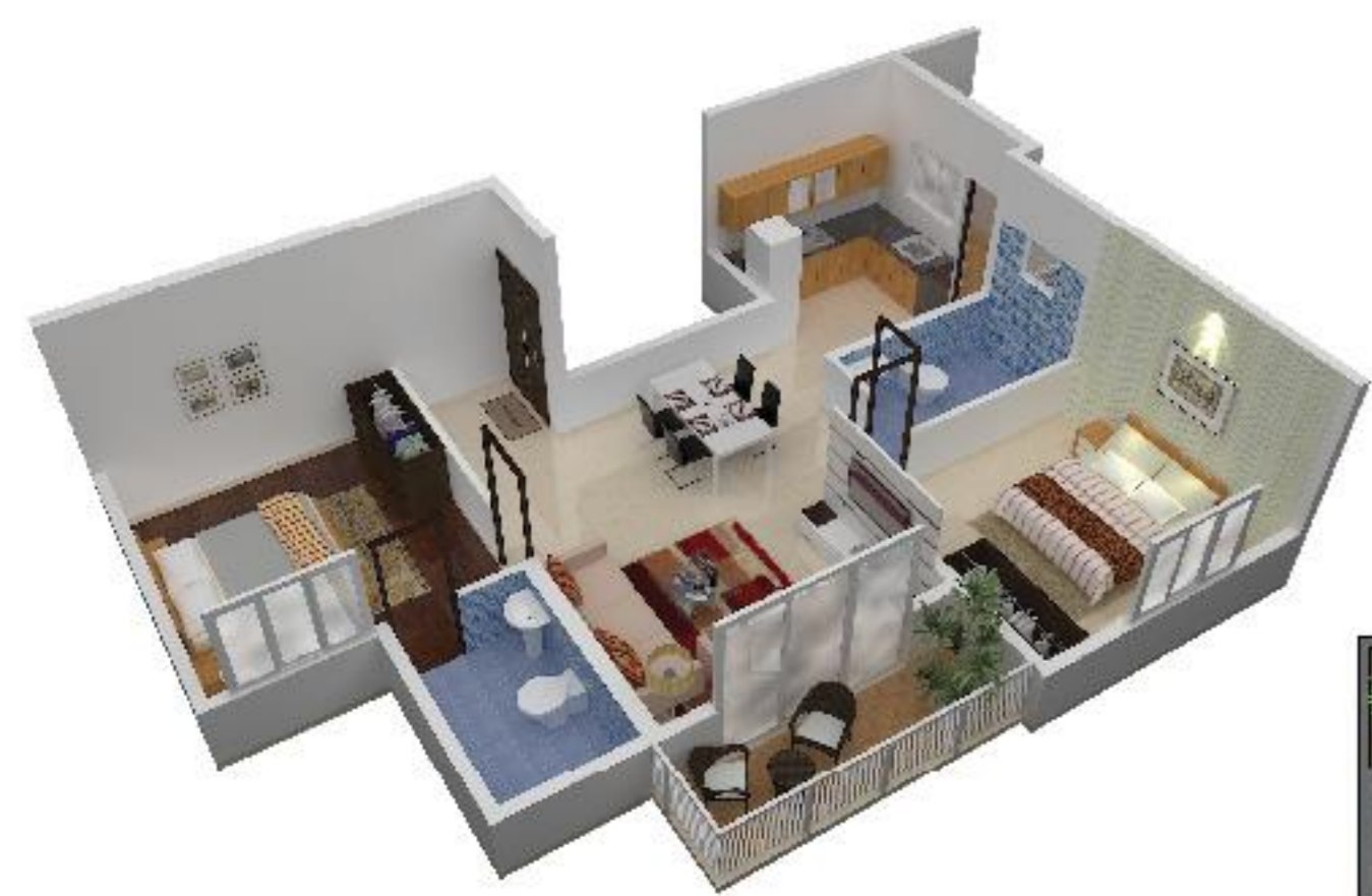
2 BHK Medium 2 Area- 1083 sqft