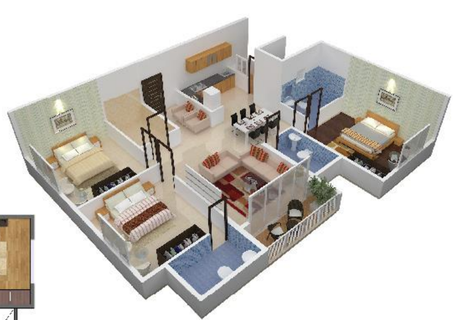
3 BHK Large Area- 1647 sqft