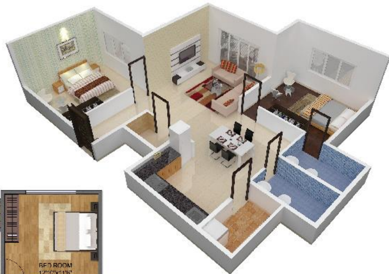
2 BHK Large 1 Area- 1312 sqft