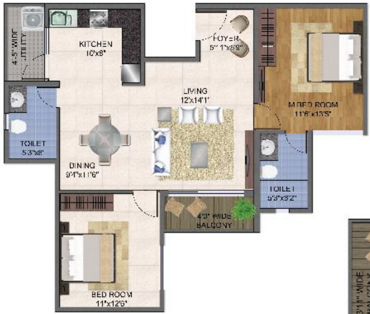
2 BHK Large 2 Area- 1218 sqft