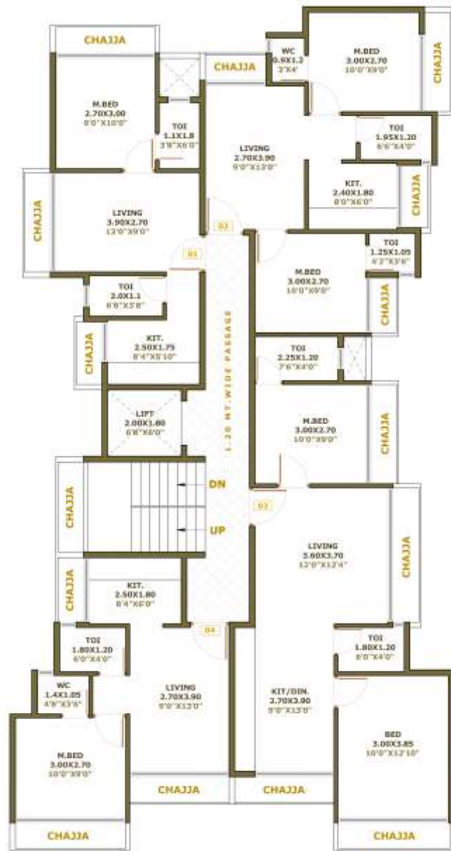
4 th & 5 th FLOOR PLAN