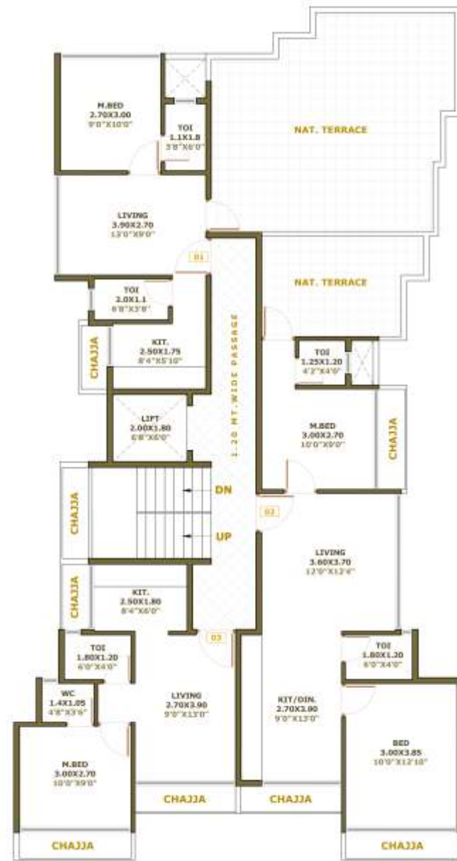
6 th FLOOR PLAN