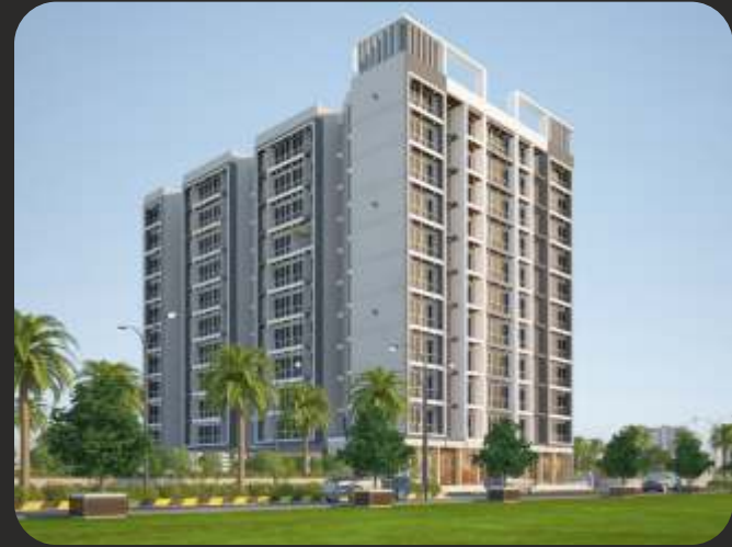
Pushpak Nagar, Ulwe