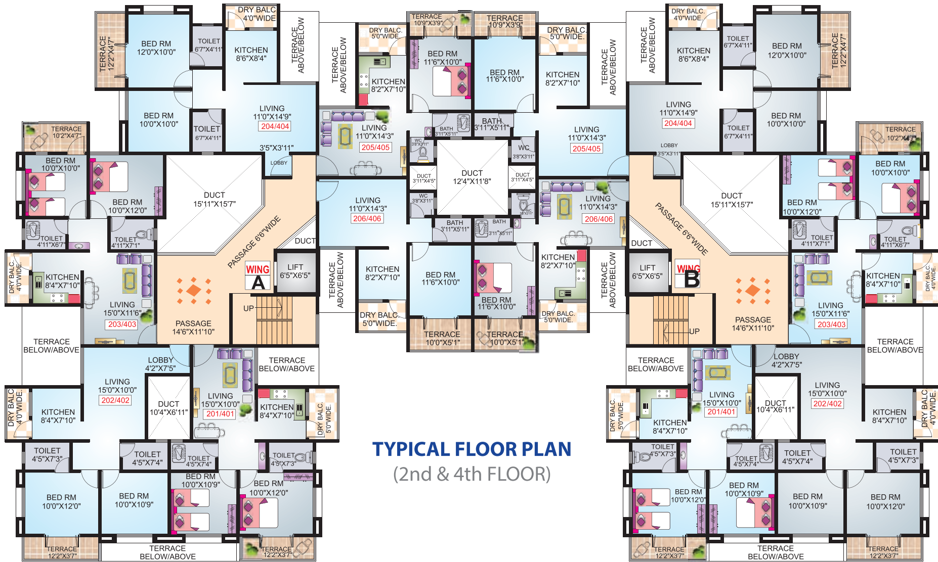
TYPICAL FLOOR PLAN (2nd & 4th FLOOR)