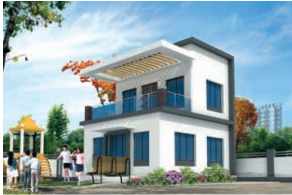
← Club House