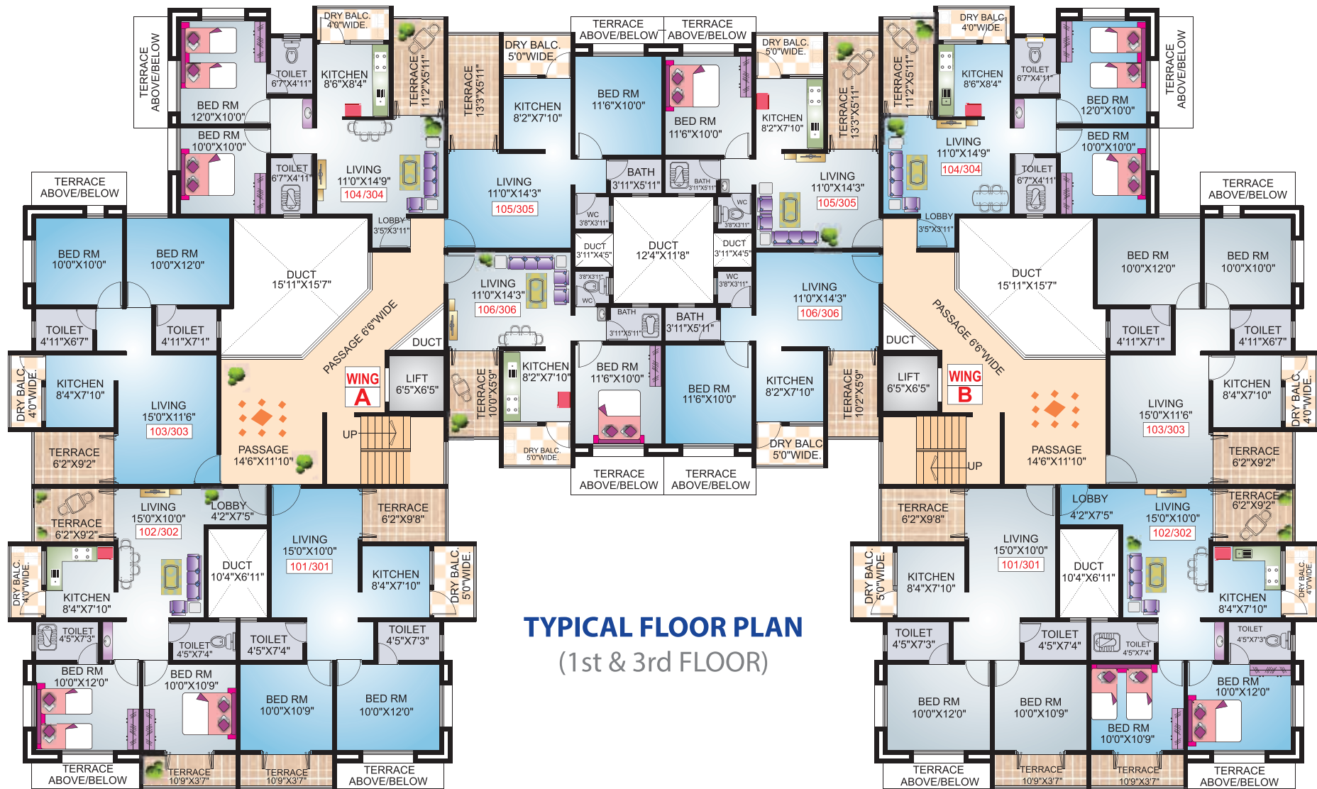
TYPICAL FLOOR PLAN (1st & 3rd FLOOR)