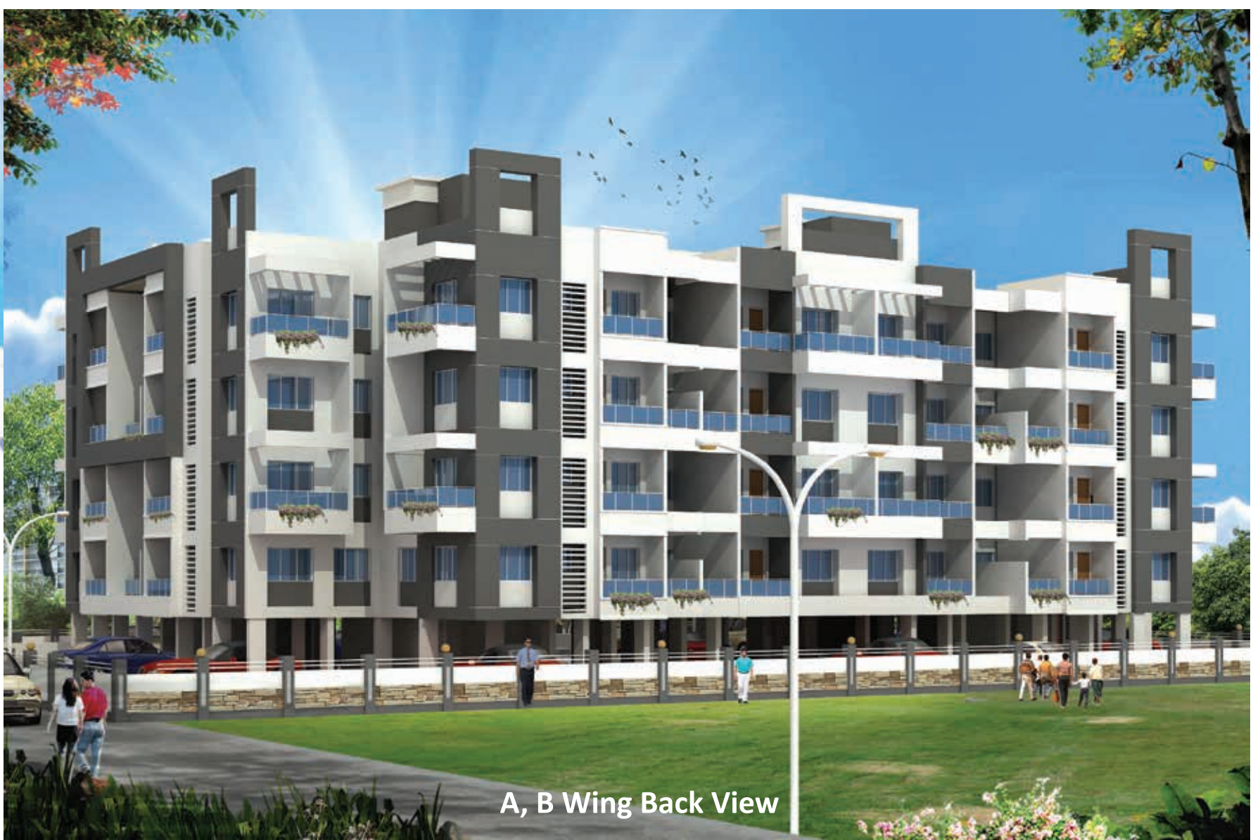
A, B Wing Back View