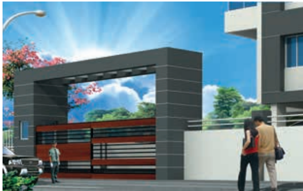
Decorative Entrance Gate →