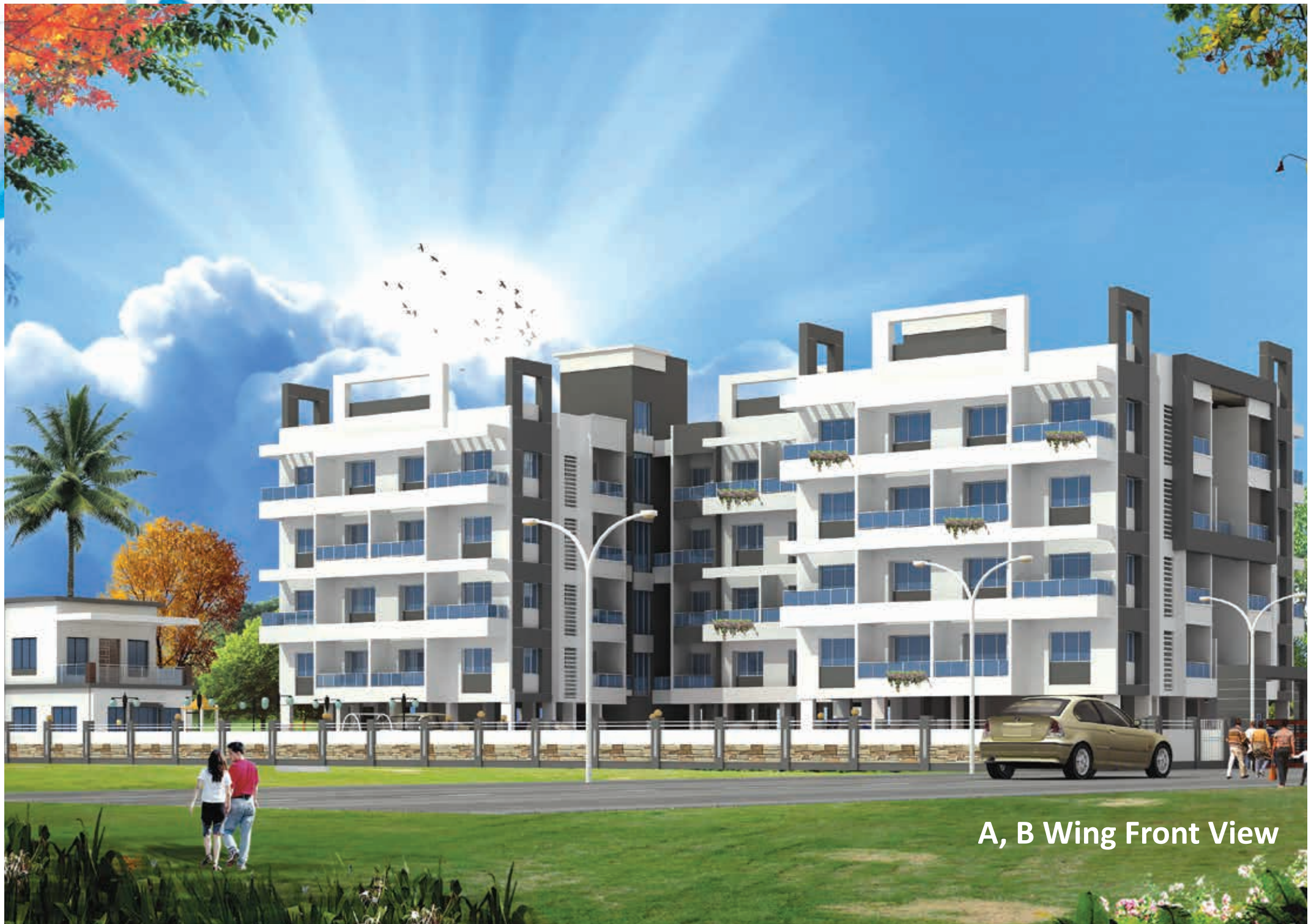
A, B Wing Front View