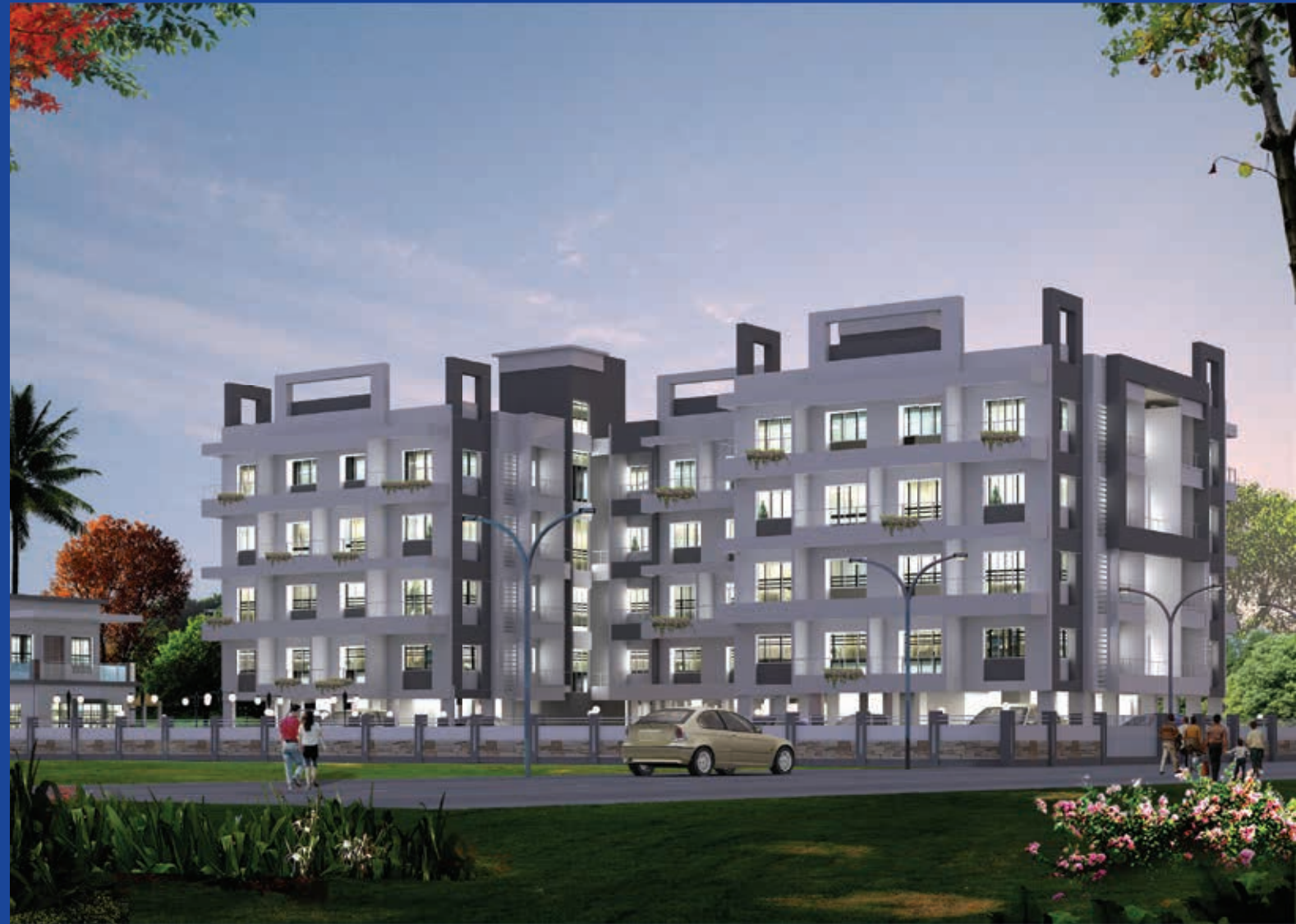
A, B Wing Night View