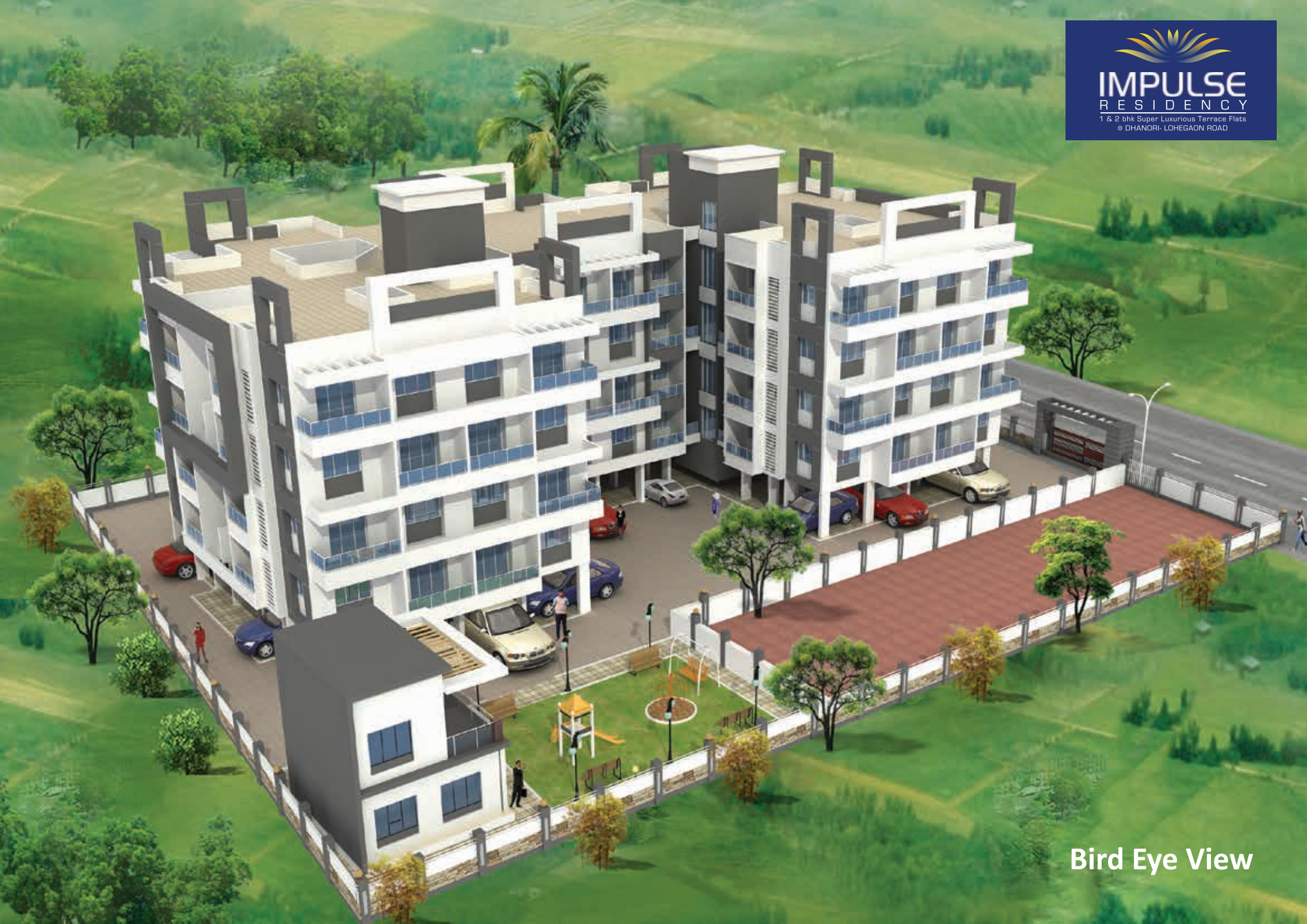
Bird Eye View