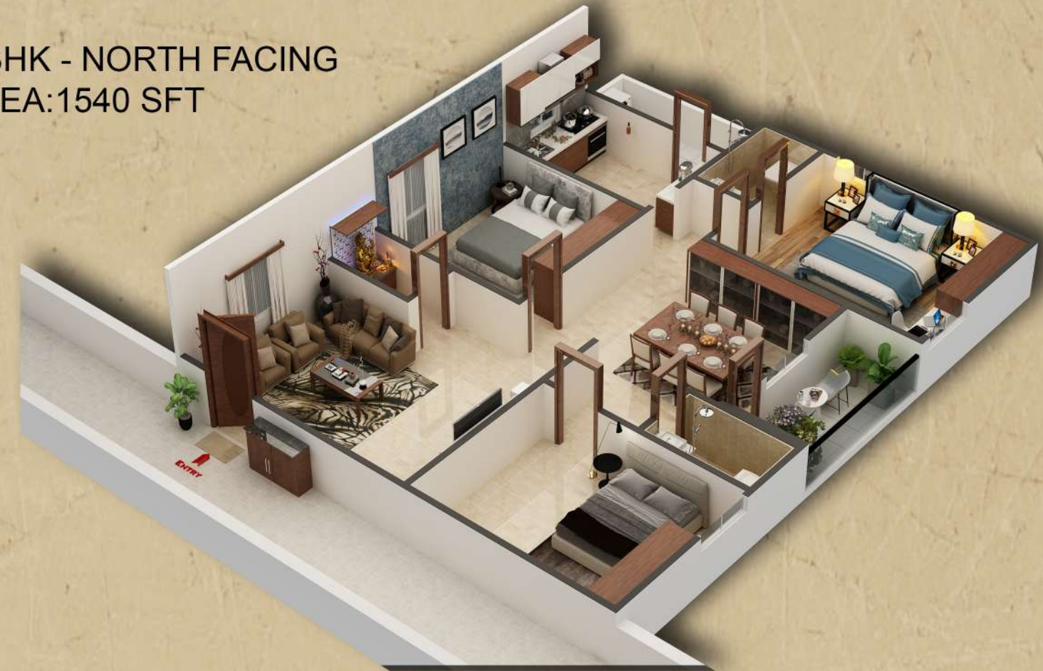
3 BHK - NORTH FACING AREA:1540 SFT