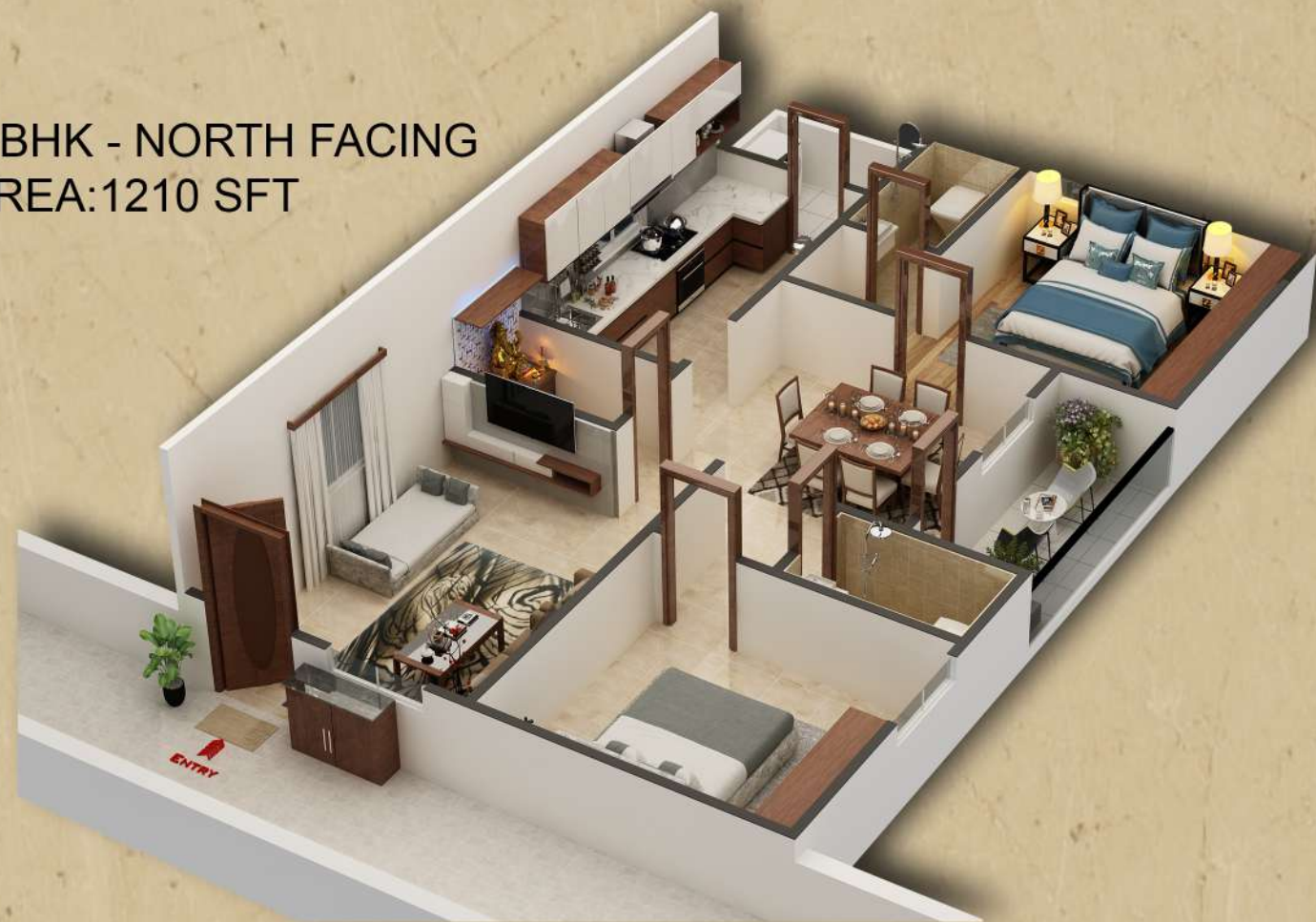
2 BHK - NORTH FACING AREA:1210 SFT