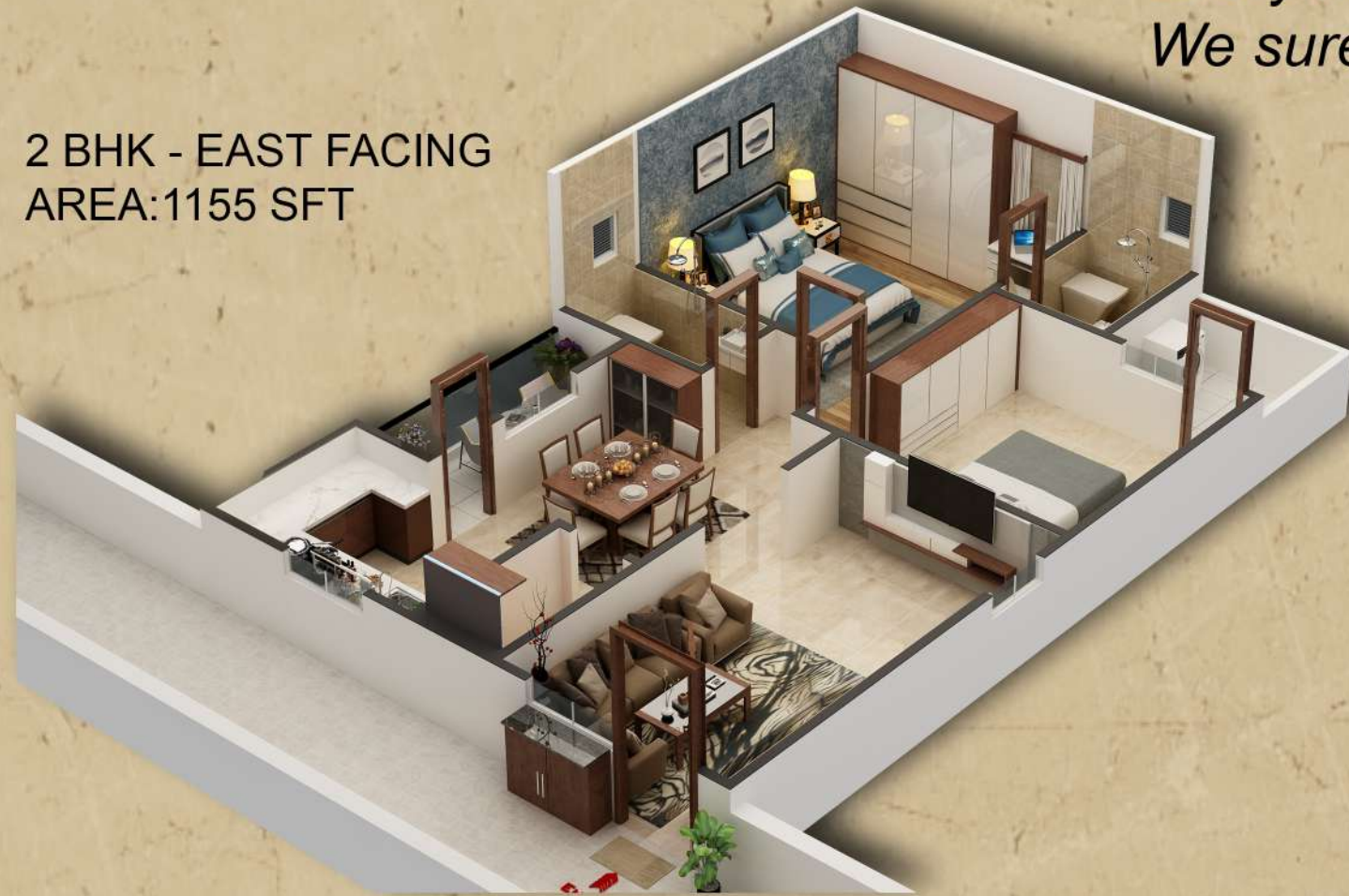
2 BHK - EAST FACING AREA:1155 SFT