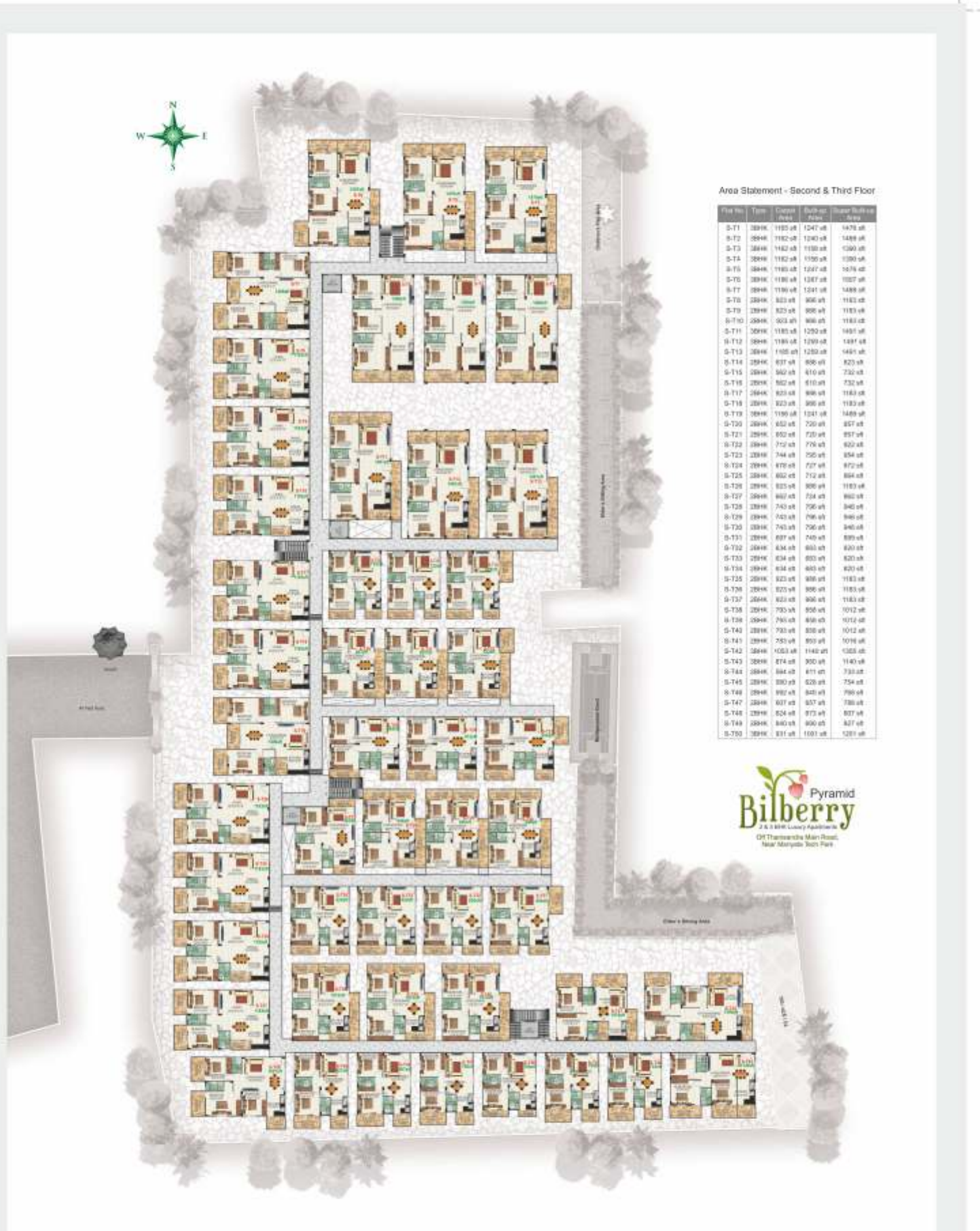
Second & Third Floor Plan