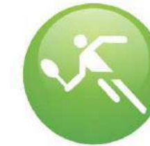
Lawn Tennis Court