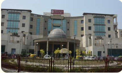
SGPGIMS (Sanjay Gandhi Postgraduate Institute of Medical Sciences