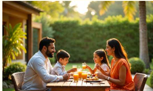
EXPERIENCE LUXURY LIVING