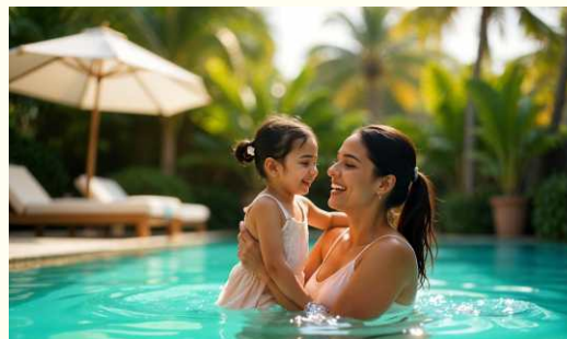
LAVISH SWIMMING POOL @GOCLUB