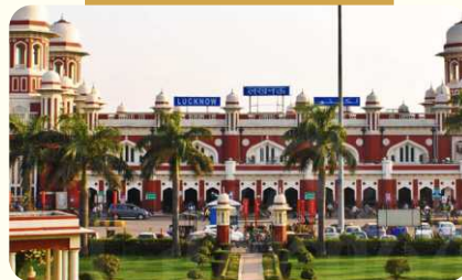
Charbagh Railway station