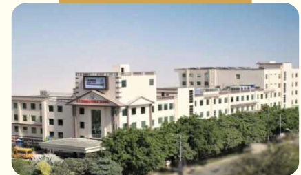
GD GOENKA Public school