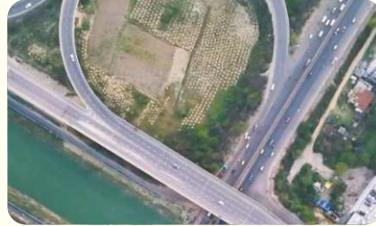
Outer Ring Road (Kisaan Path)