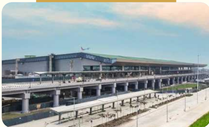
Lucknow Airport / Chaudhary Charan Singh International Airport