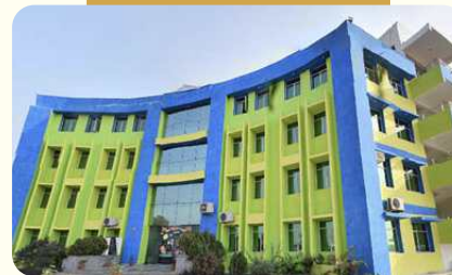
The Millennium Schools