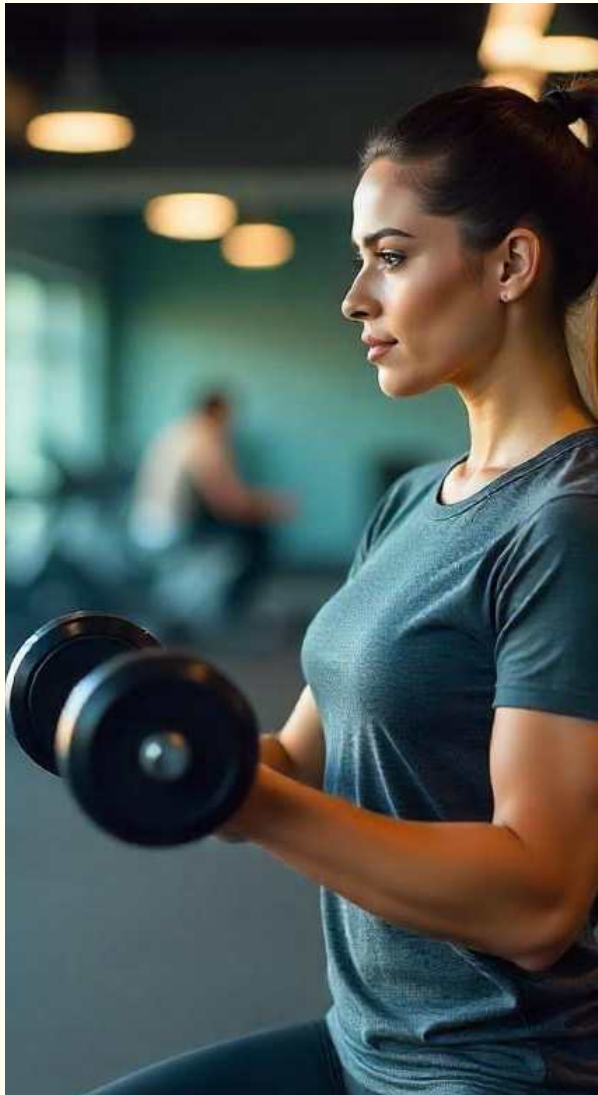
THE ULTIMATE GYM