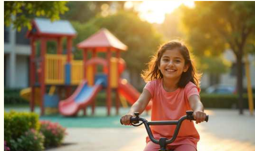
THE PERFECT PLAY AREA