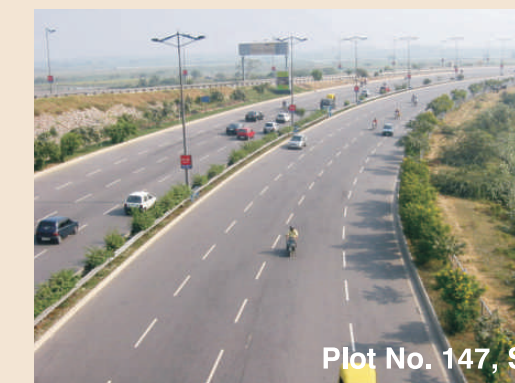
Plot No. 147, Sector - 02, Ulwe, Navi Mumbai