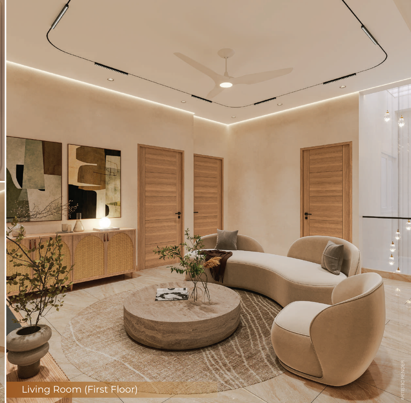
Living Room (First Floor)