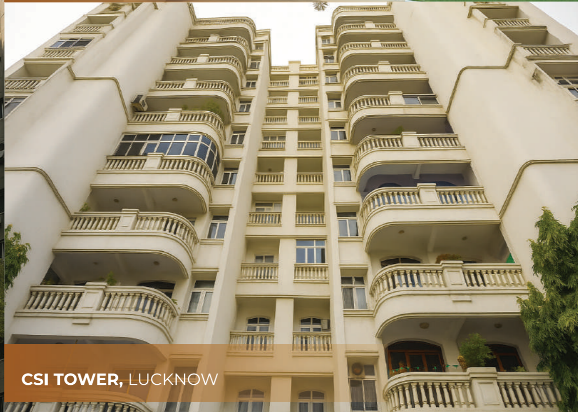
CSI TOWER, LUCKNOW