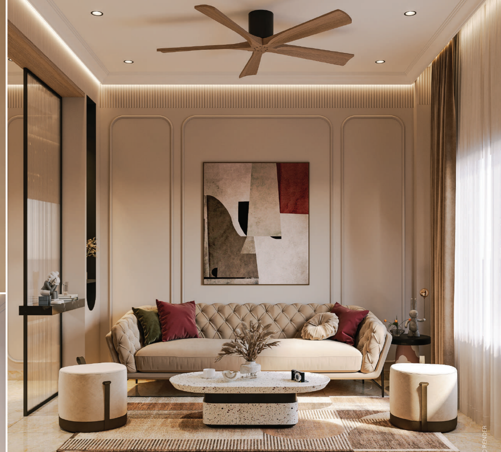
Drawing Room (Ground Floor)