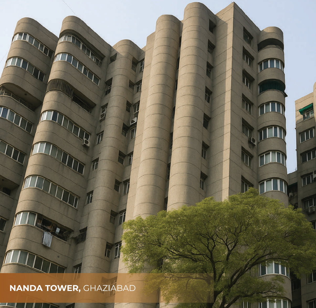
NANDA TOWER, GHAZIABAD