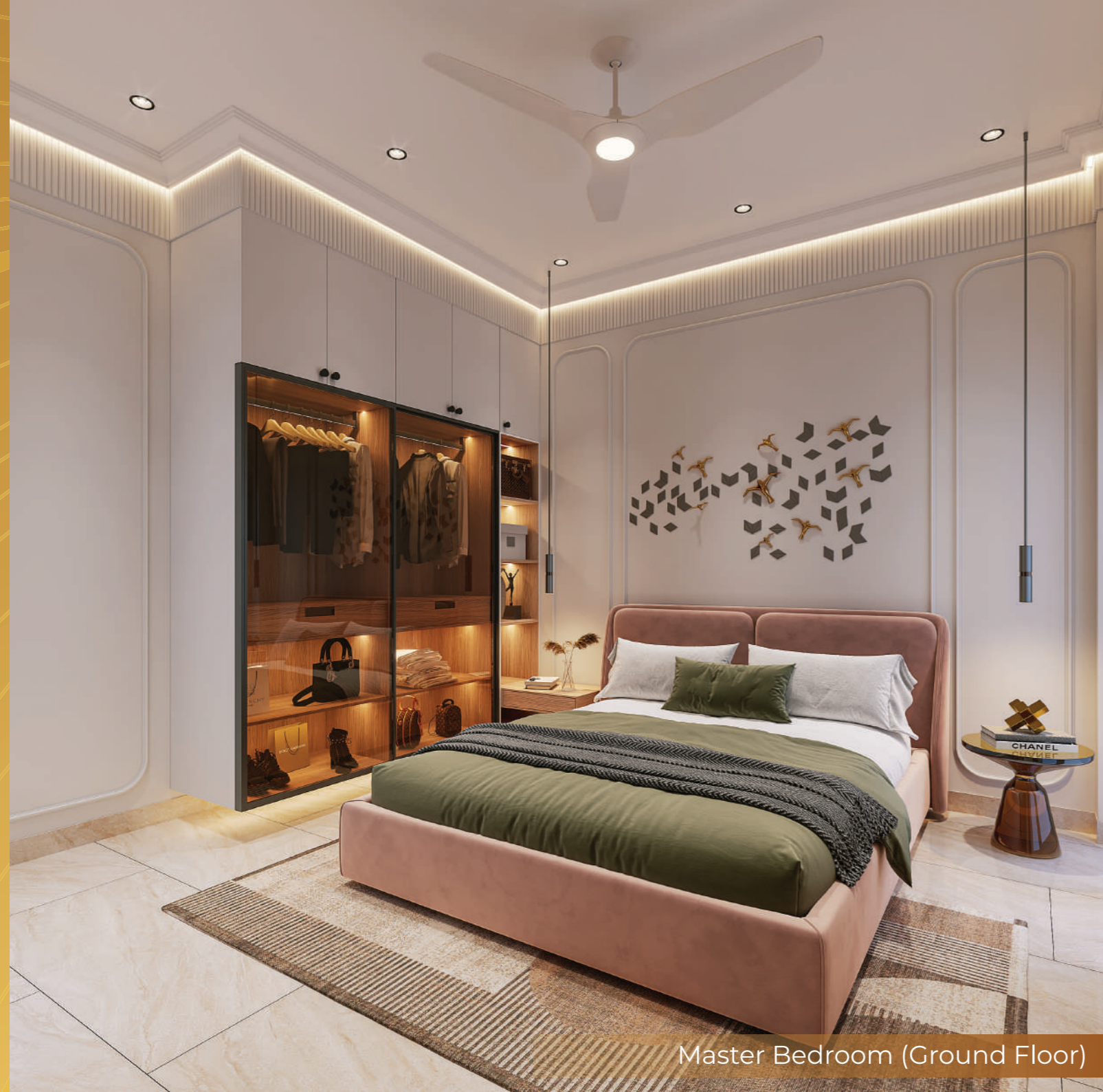
Master Bedroom (Ground Floor)