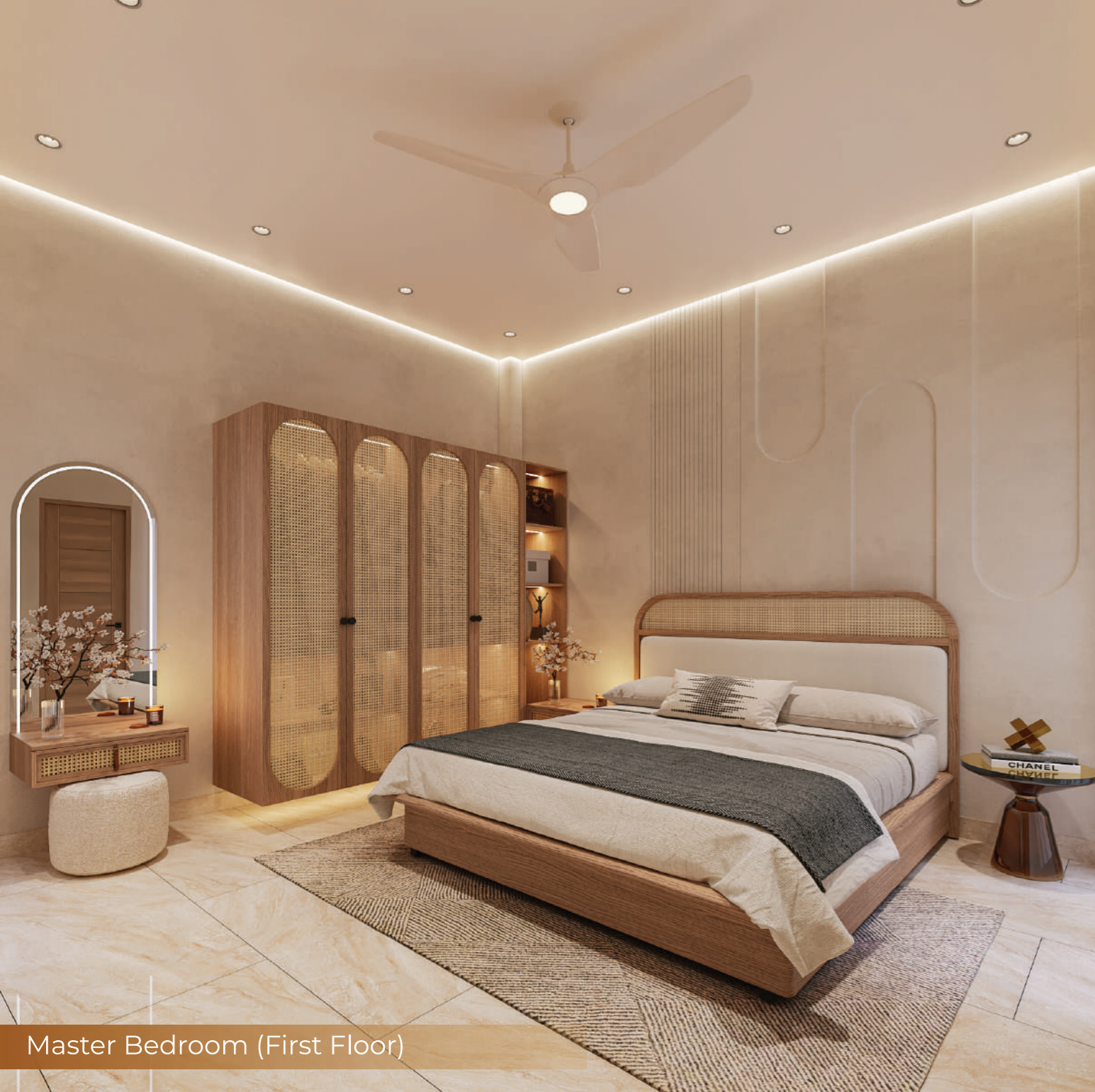
Master Bedroom (First Floor)