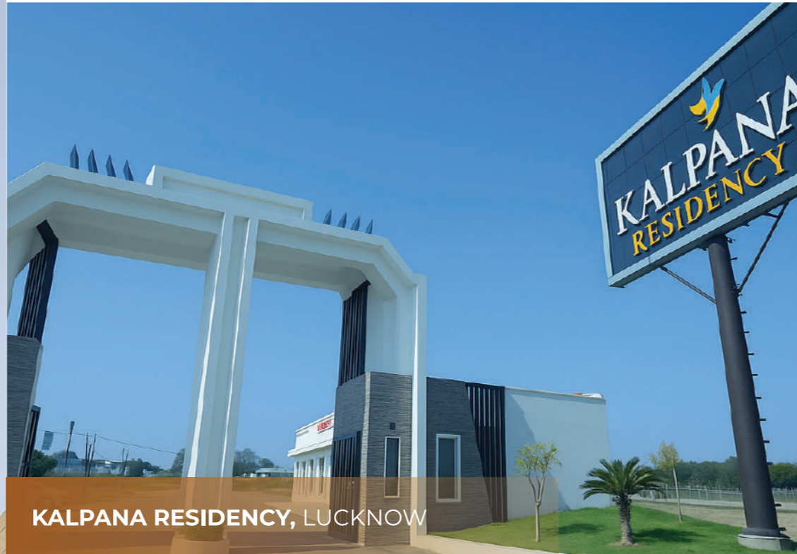
KALPANA RESIDENCY, LUCKNOW