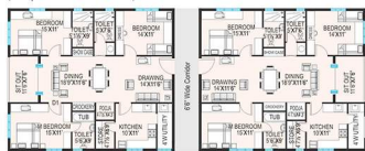
Type - 1 A - 9, 10, 11, 12, 13, 14 B - 1, 2, 5, 6 C - 2, 3, 4, 5