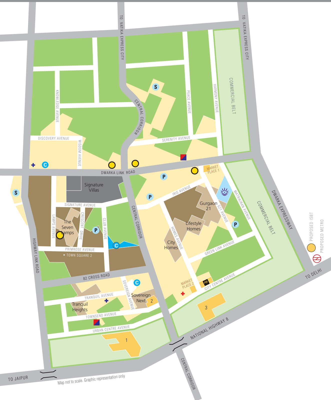
Map not to scale. Graphic representation only