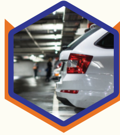
COVERED CAR PARKING