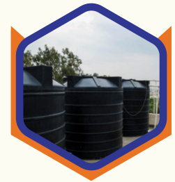
TANK FLOAT LEVEL SWITCH