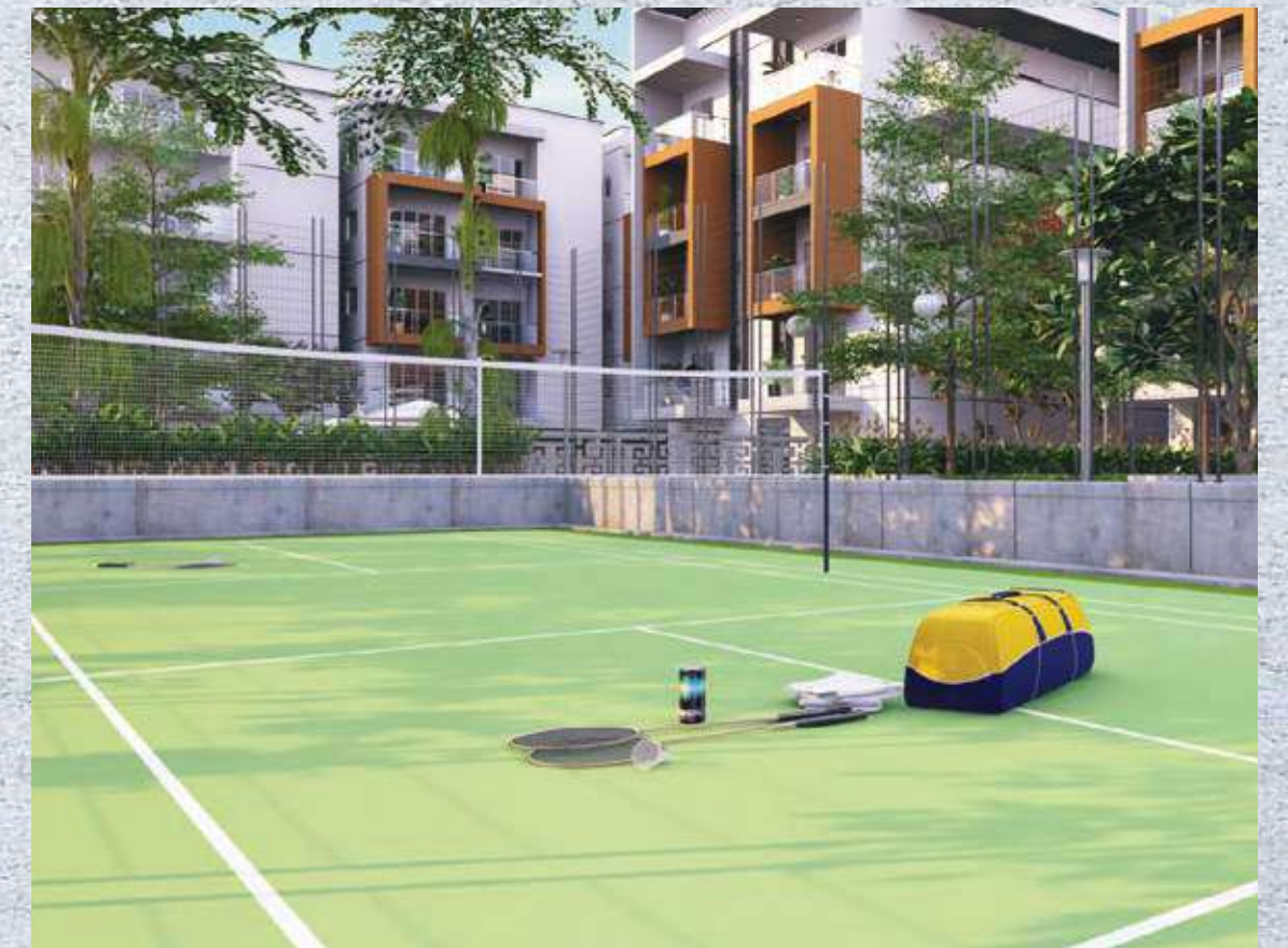
The perfect place for you to sweat and be healthy.