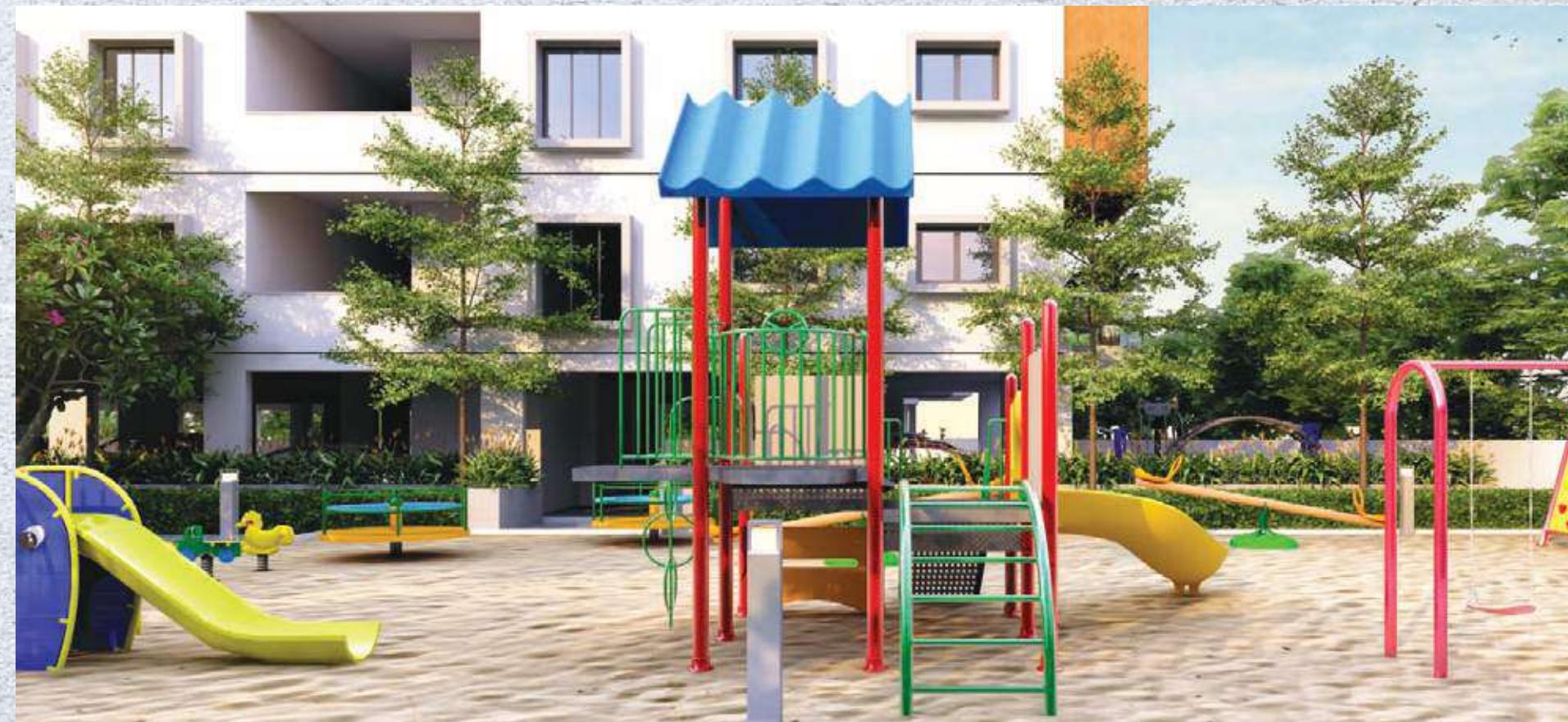
This project comes with a wide variety of play area equipments which is a safe & comfortable space for your kids to play.