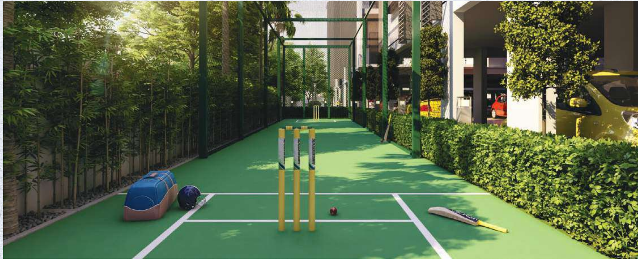
Physical fitness is not only one of the most important keys to a healthy body, it is the basis of dynamic and creative intellectual activity.