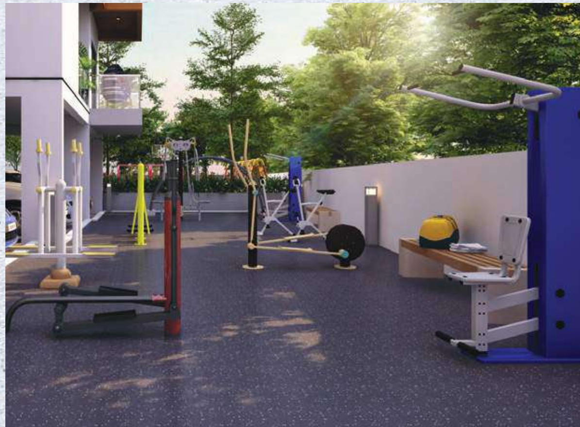
Get fit in your own space & workout without even leaving your apartment with our outdoor GYM.