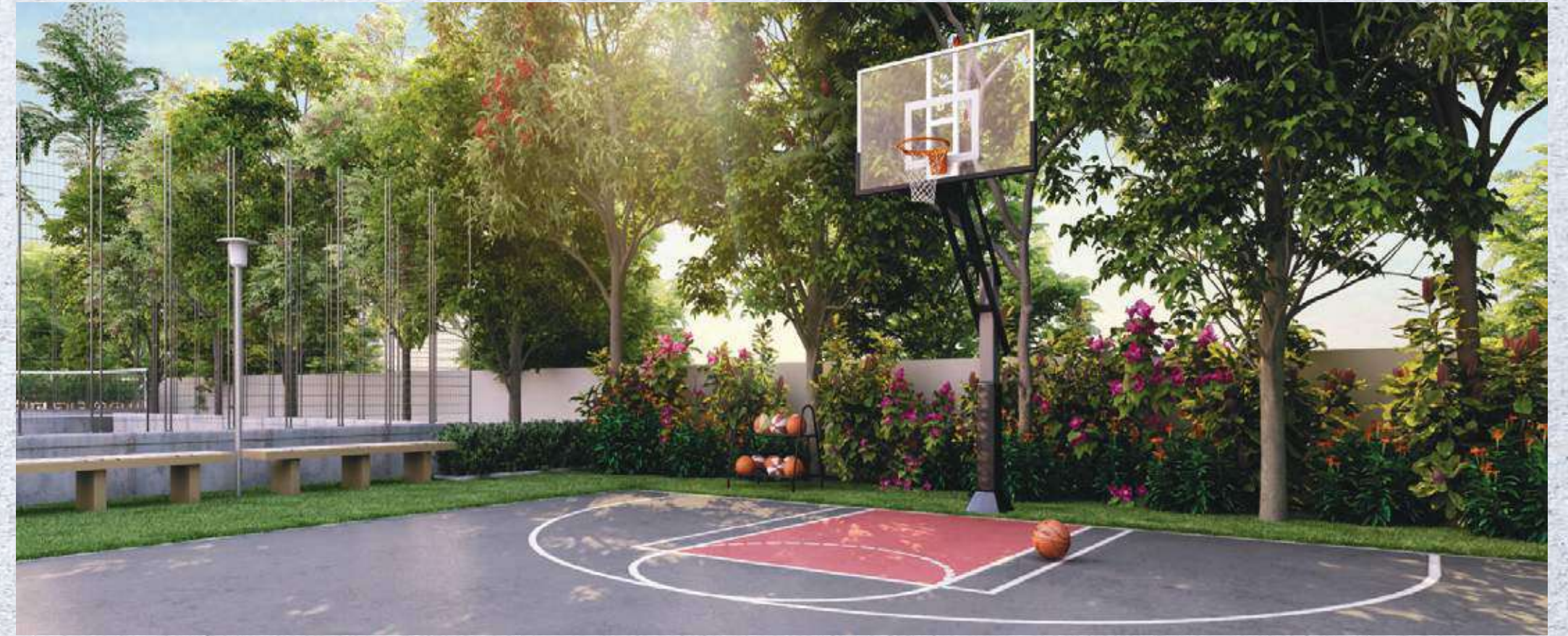
A perfect spot to unwind and have some fun game has everything you need to relax and have a good time.