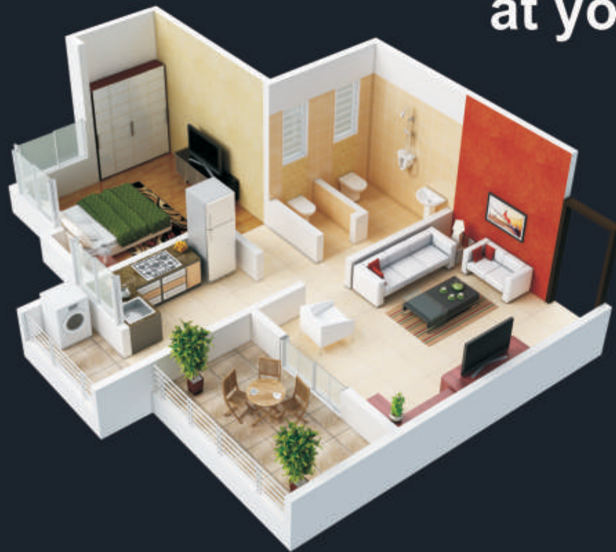
1 BHK HOMES