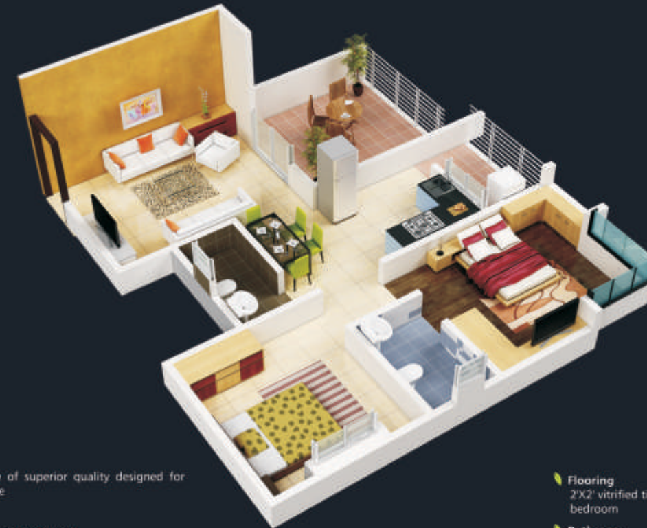
2 BHK HOMES