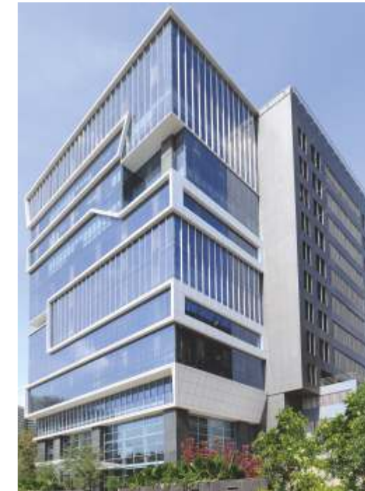
ARENA SPACE - JOGESHWARI, MUMBAI