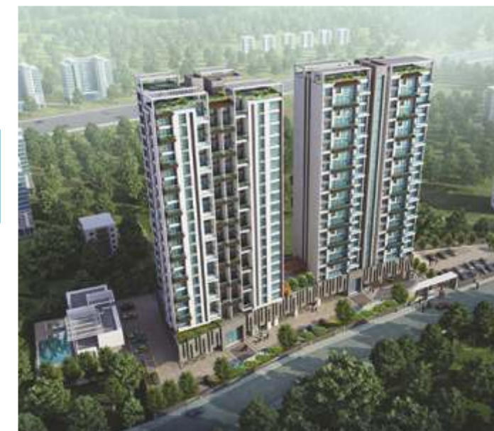
REGENCY WILLOW - LONAVLA