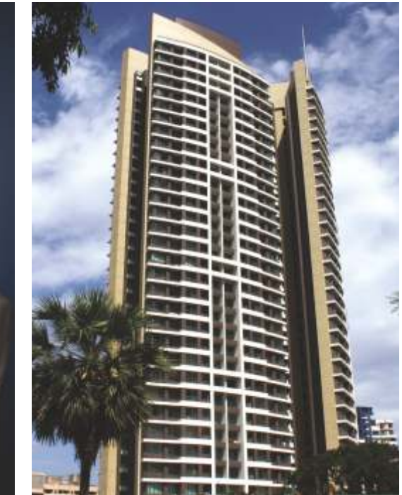
KALPATARU TOWERS - KANDIVALI, MUMBAI