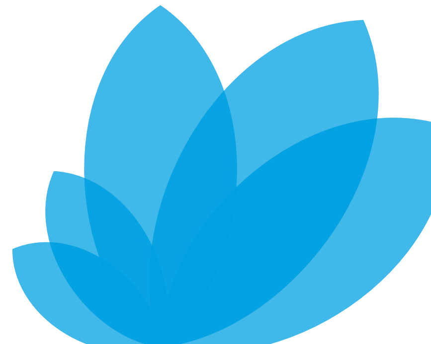
ABIL IMPERIAL - BANER, PUNE

The design style of Casa Unico at Karjat, incorporates elements of nature. Cultural stone, decorative railings, balconies and round pillars express the romantic flavor of the Mediterranean life. The gated community has been designed to offer comfortable living with global amenities in the midst of inexplicable tranquility.