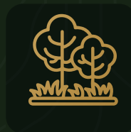
PARK & LAWNS