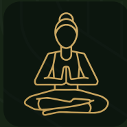
YOGA & MEDITATION HALL