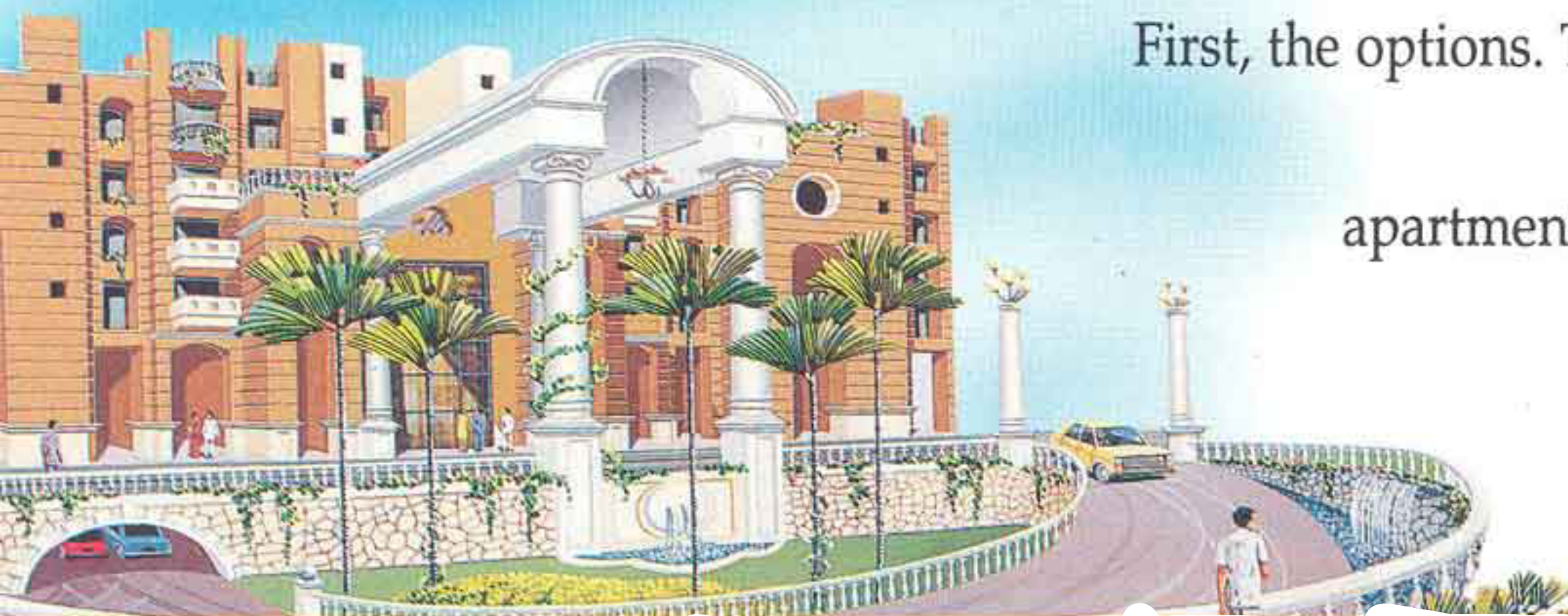
An artist's impression of the entrance porch of DLF Windsor Court, with a cut-section of the apartment block that also shows the first four floors.

First, the options. Two of the most exclusive apartment complexes ever, both in