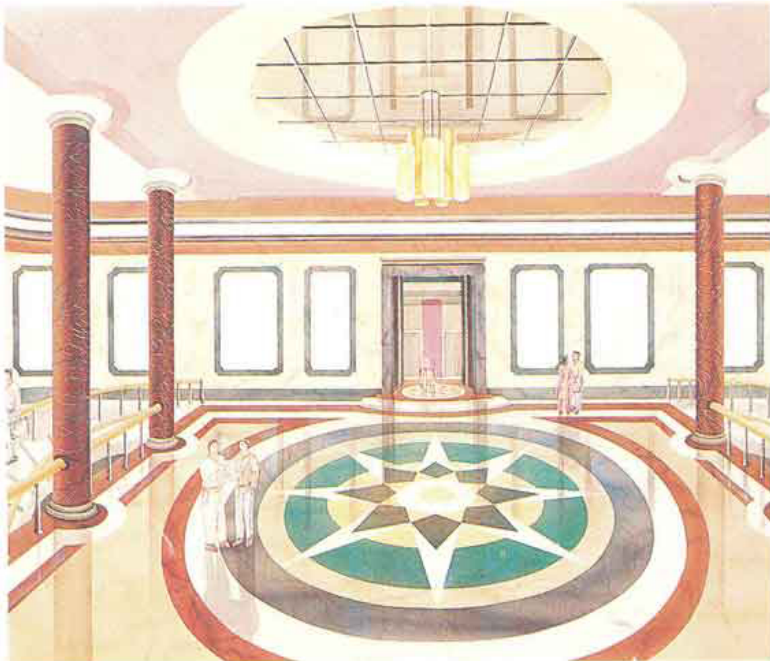
An artist's impression of the grand entrance lobby of DLF Richmond Park

Drop in at the DLF office today. Check out the options.