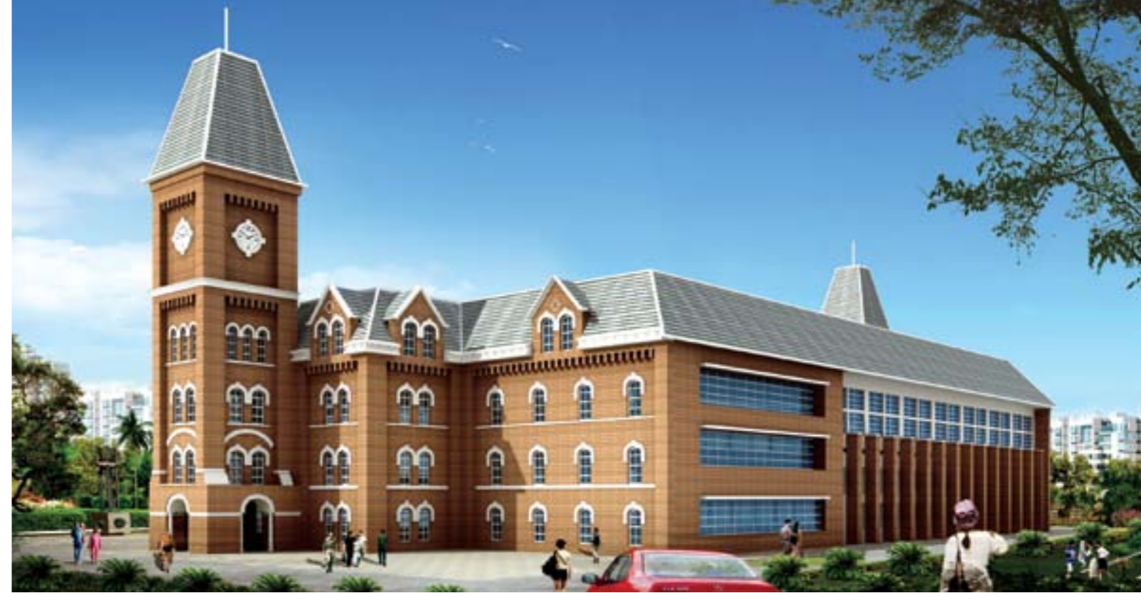
A world-class school with a comprehensive curriculum