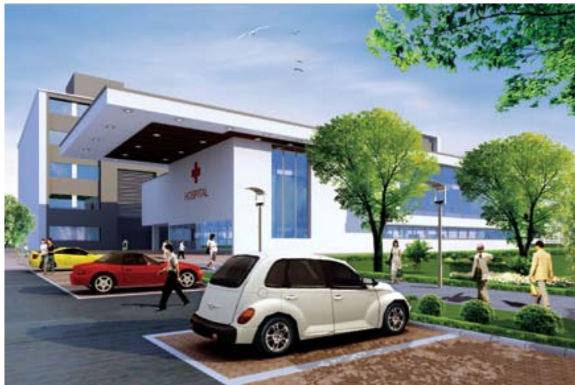
A fully-equipped medical care centre