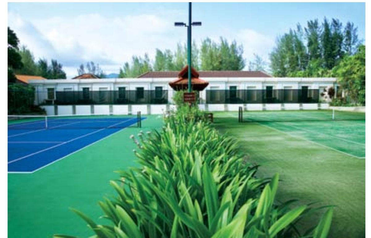
Dedicated sports facilities with professional coaches