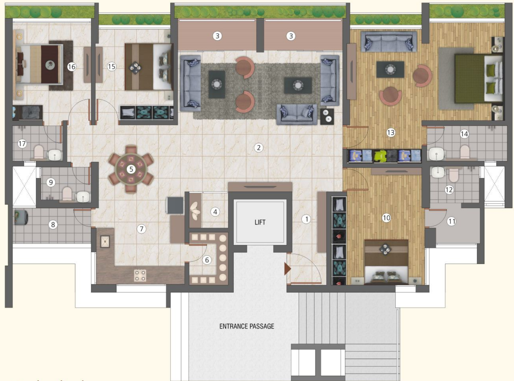
A 4 bhk UNIT FLOOR PLAN 2754 SQ.FT