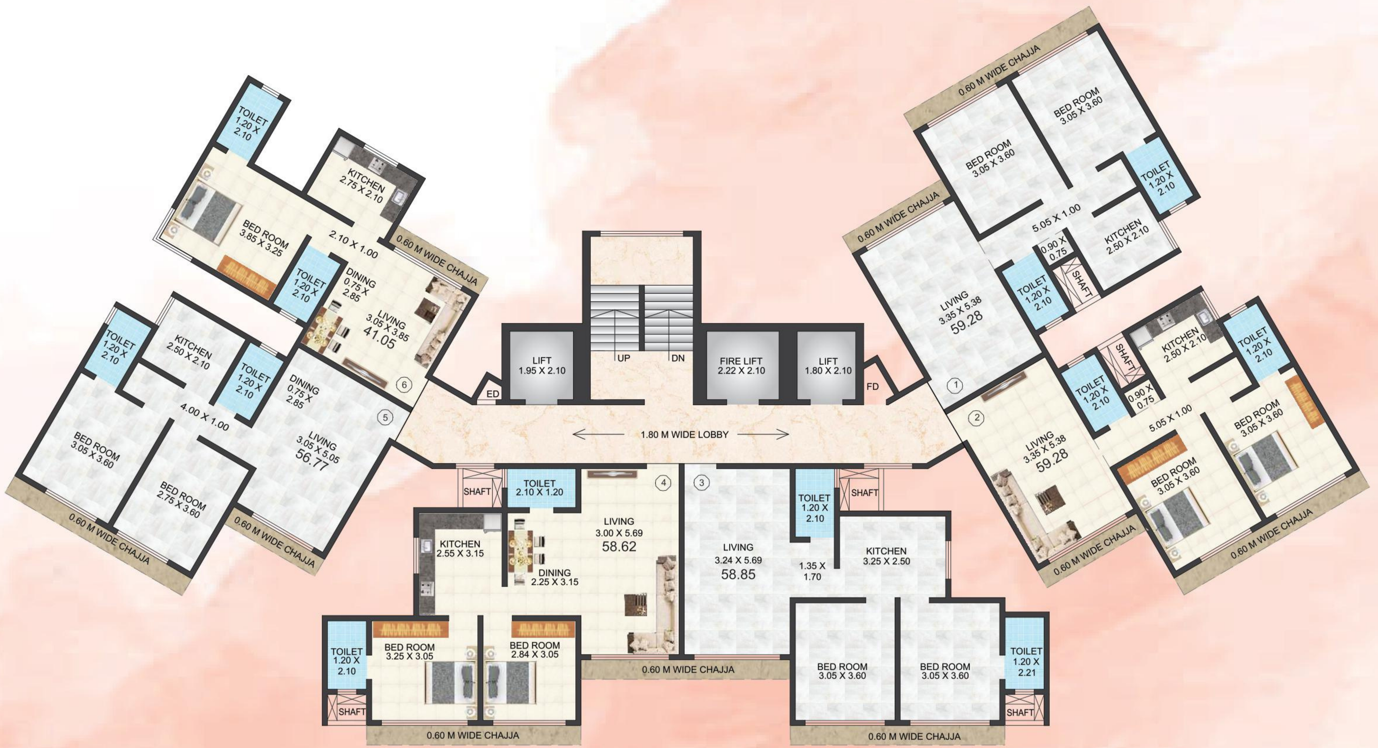
12ND, 14TH TO 17TH FLOOR PLAN