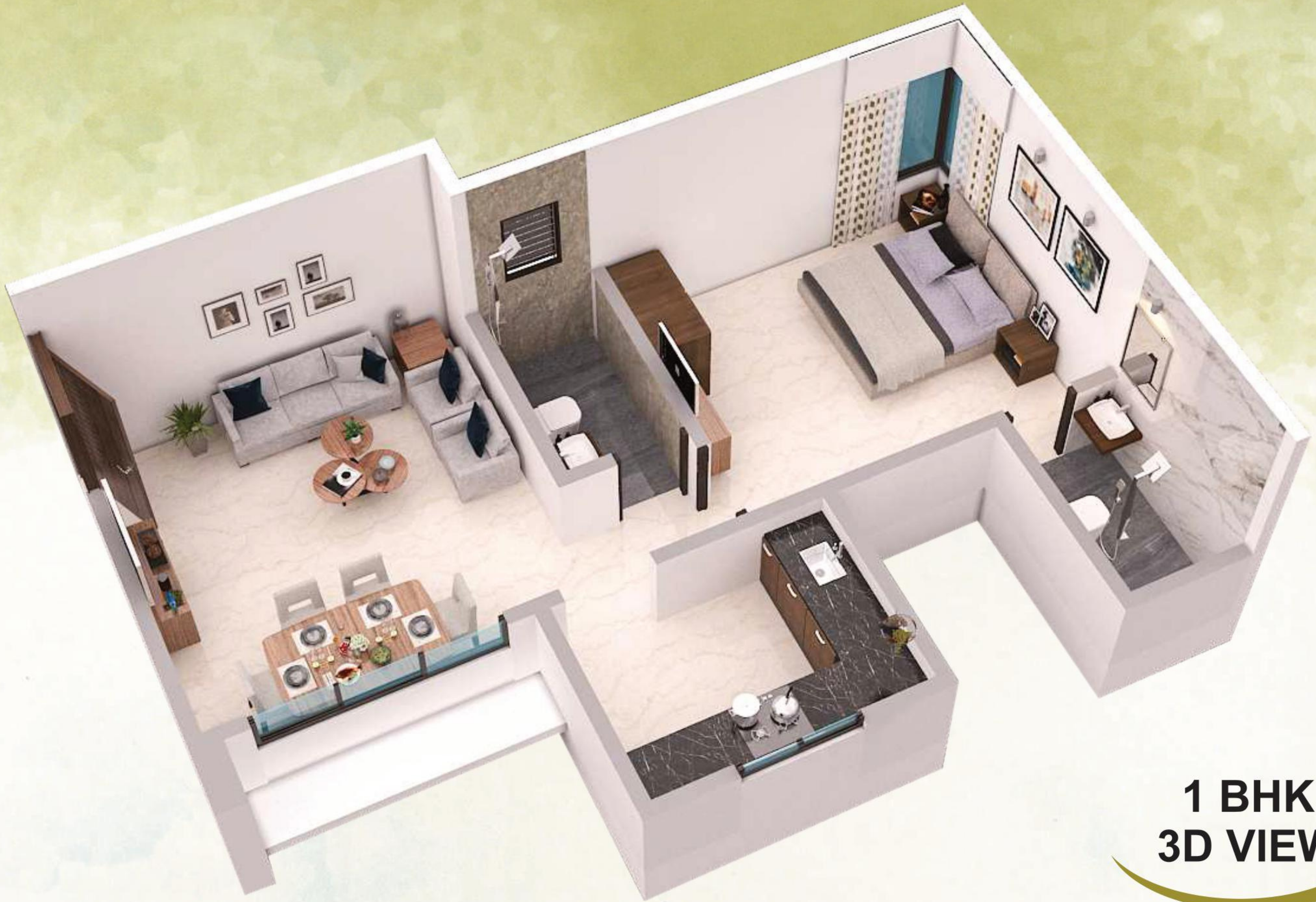
1 BHK 3D VIEW