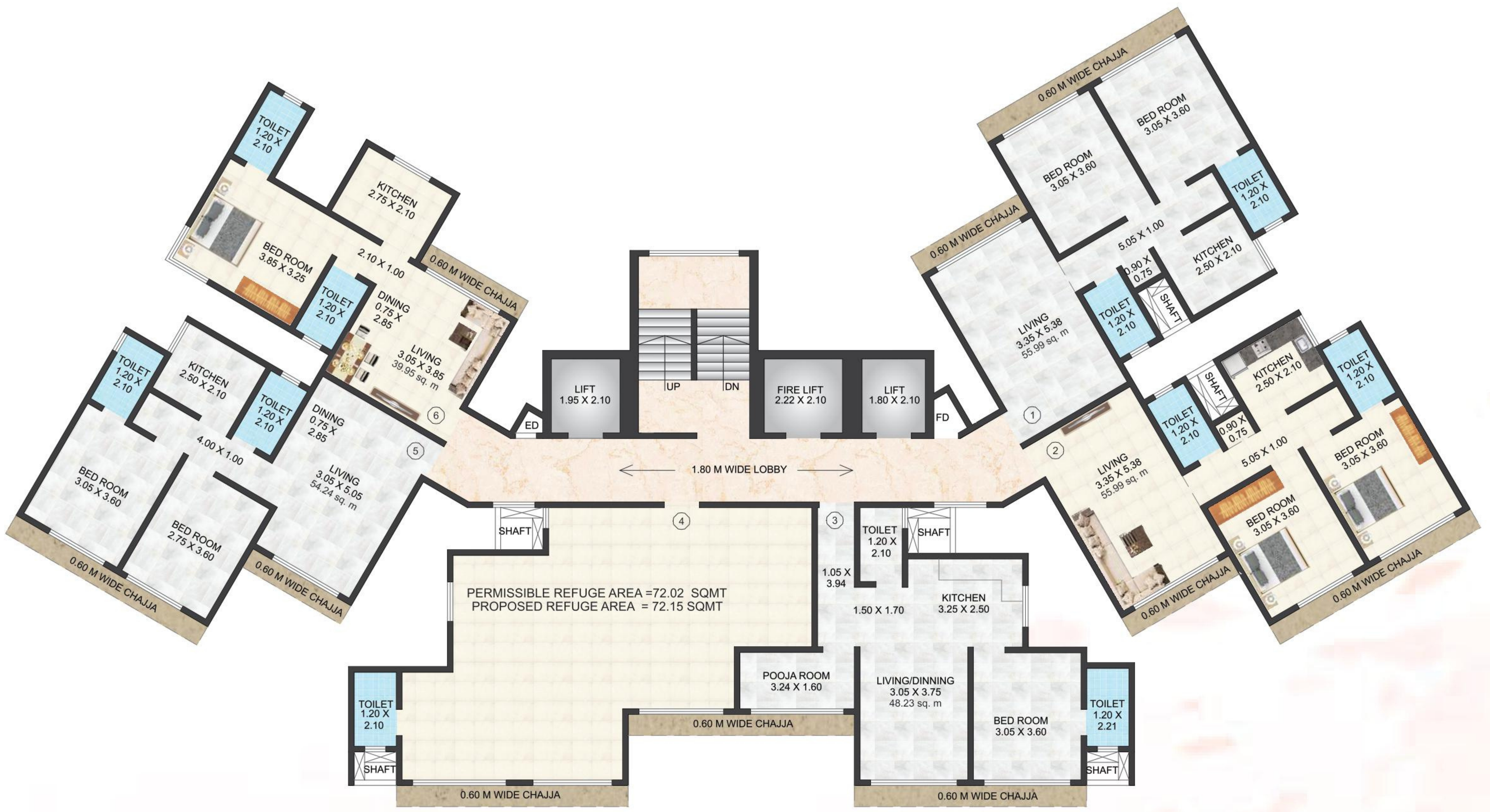
13TH REFUGE FLOOR PLAN