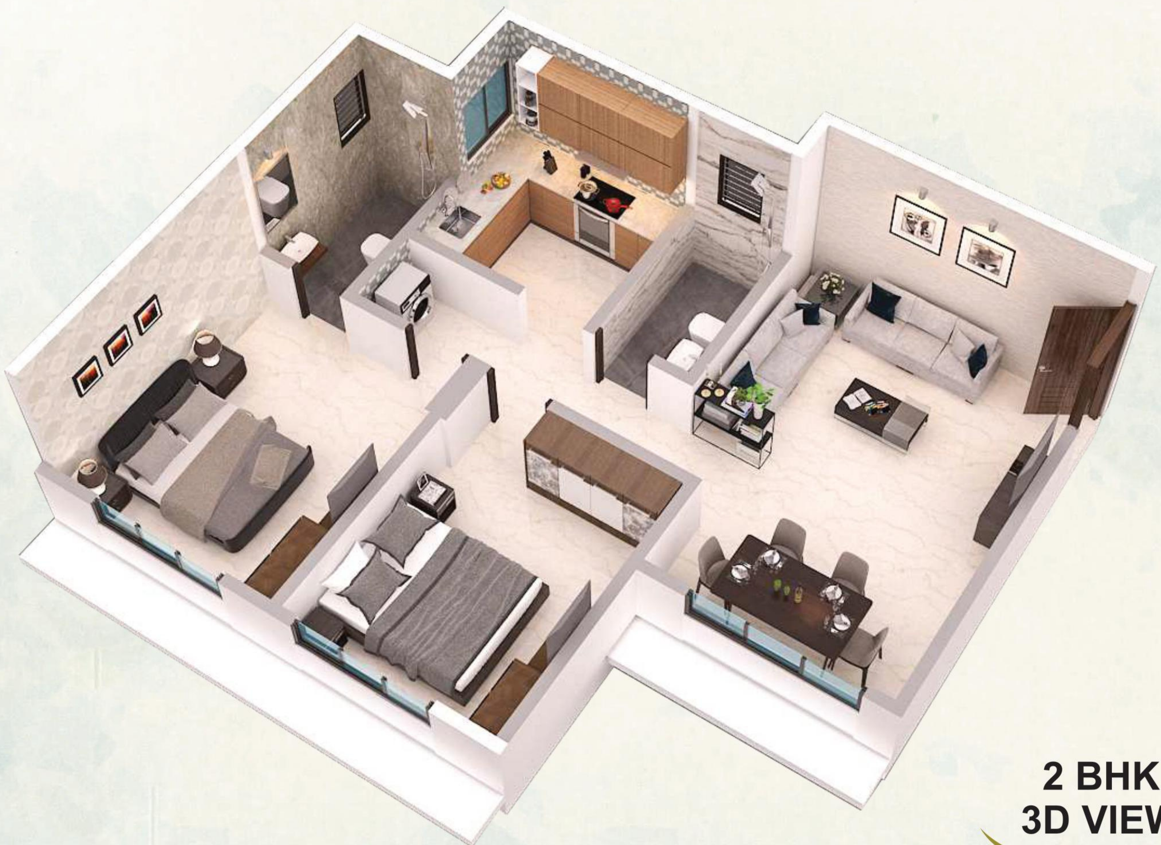
2 BHK 3D VIEW