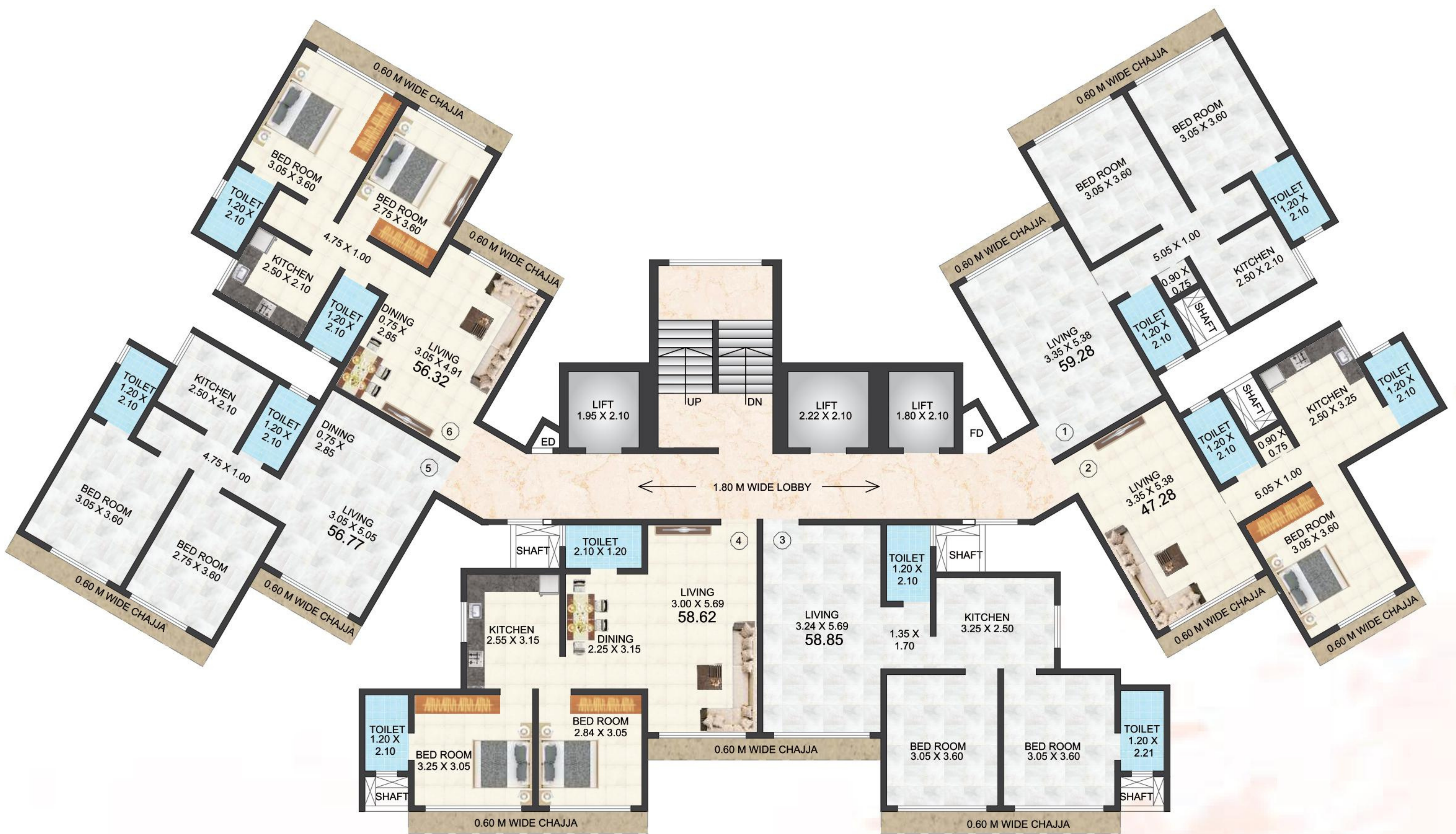
4TH FLOOR PLAN