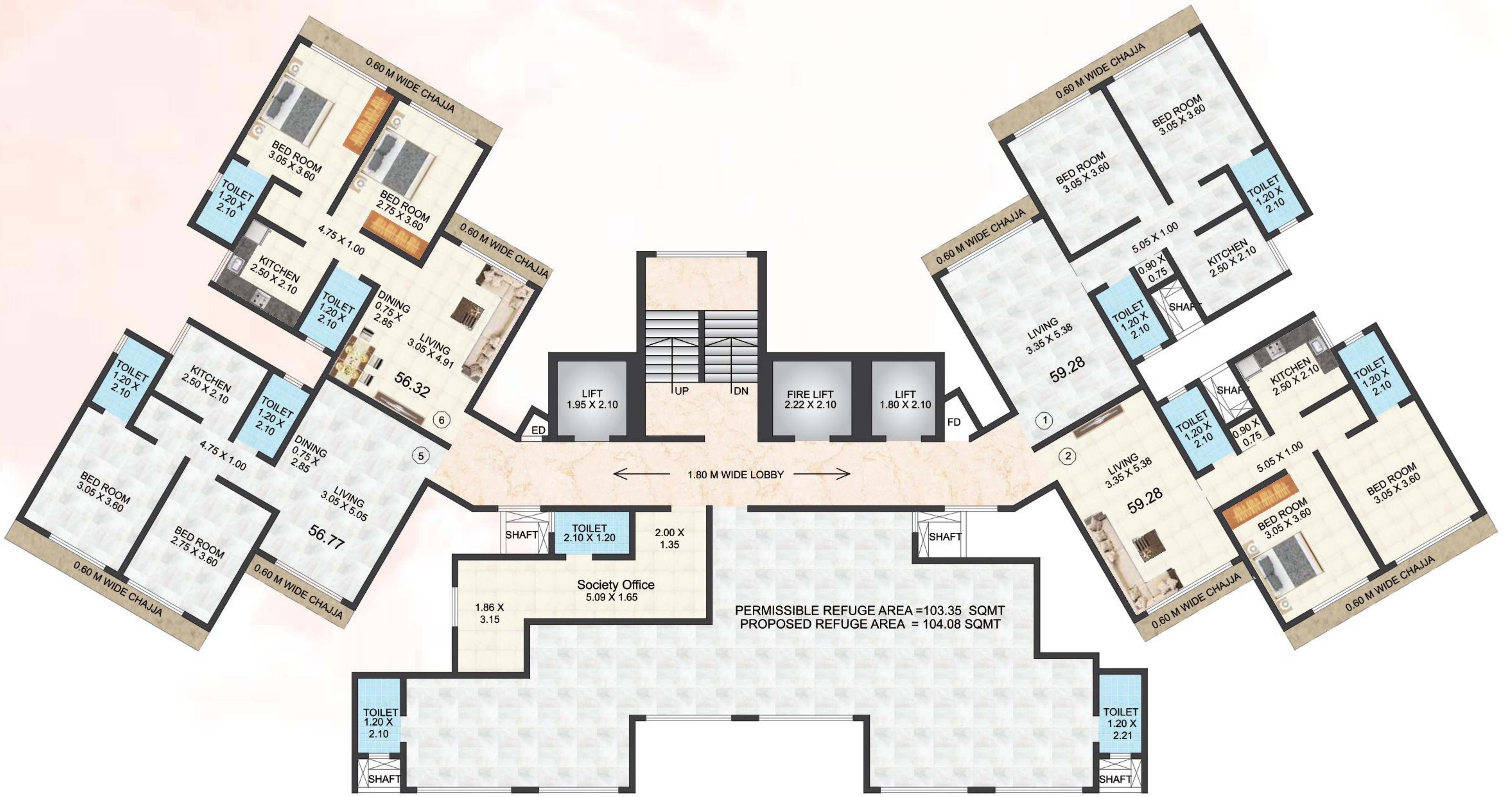
6TH REFUGE FLOOR PLAN