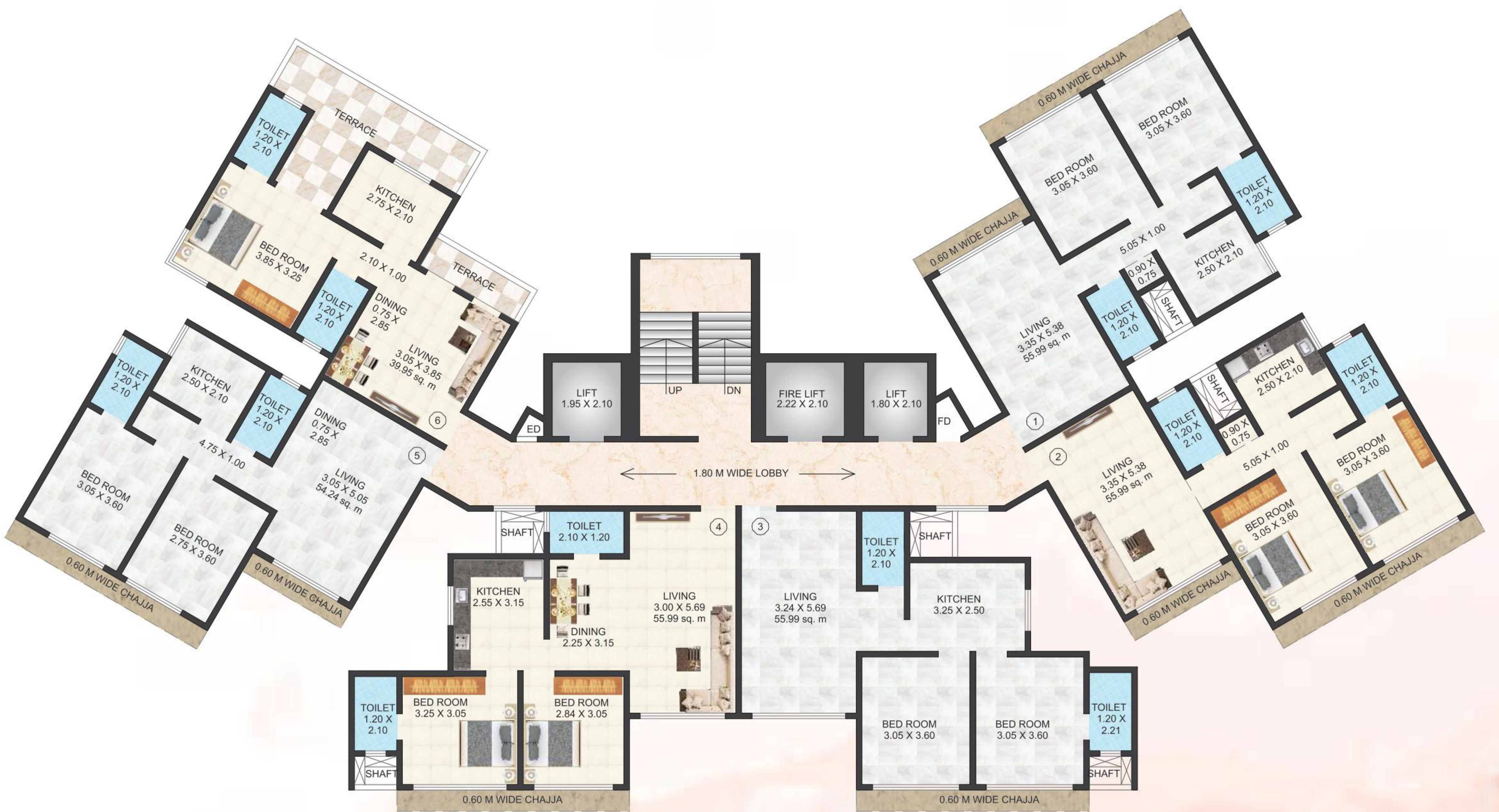
11TH FLOOR PLAN