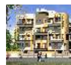
Alfa Green Fields