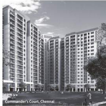
Commander's Court, Chennai