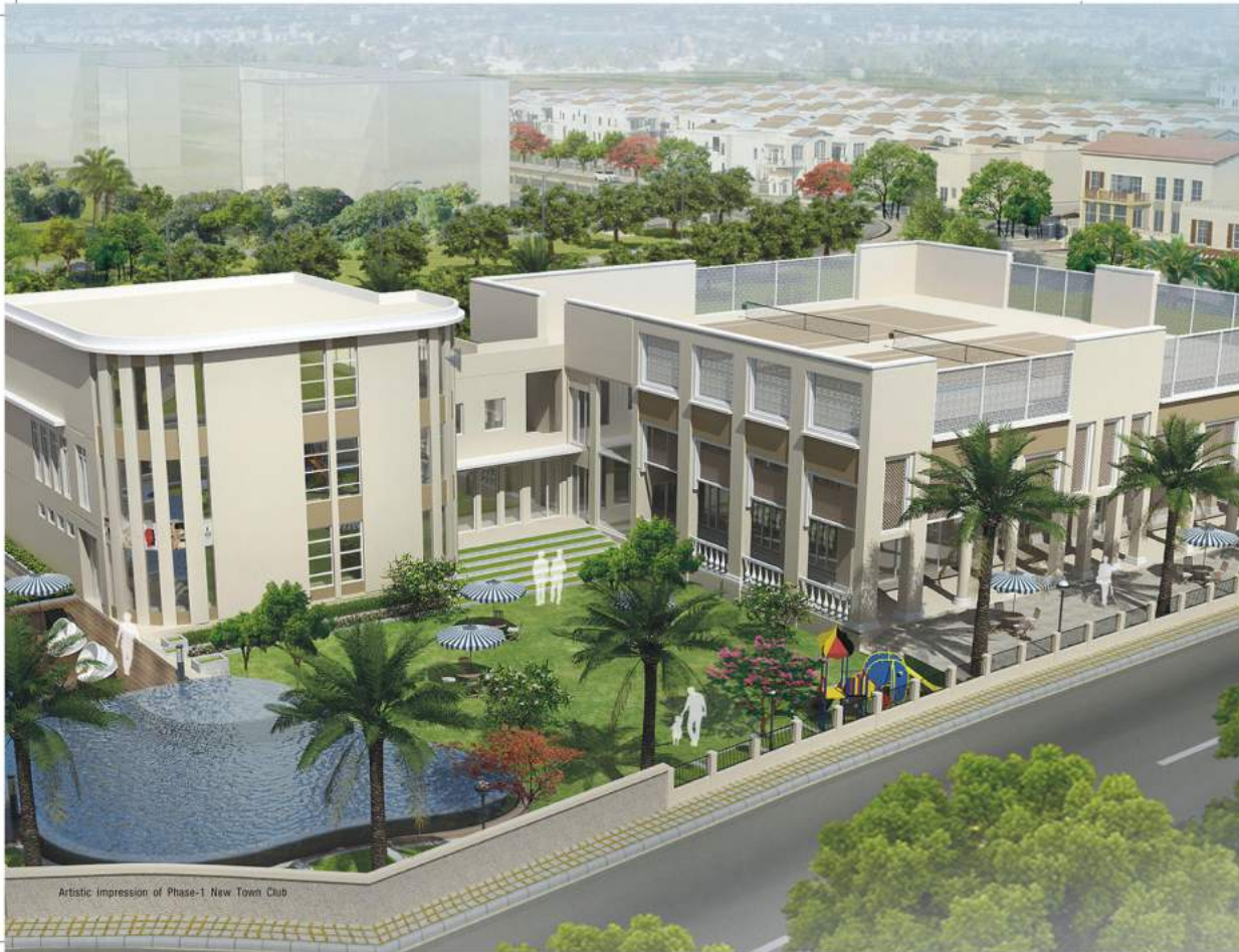
Artistic Impression of Phase-1 New Town Club

The features and amenities indicated are proposed, and are subject to change without prior notice, at our sole discretion of the company.