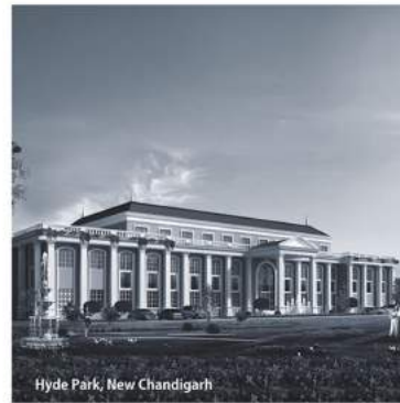
Hyde Park, New Chandigarh